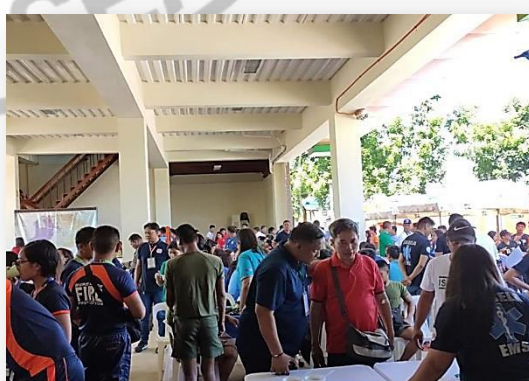
Bloodletting Activity held at PDRRMC-BFP Building, Capitol, Alibagu, City of Ilagan, Isabela last July 11, 2019