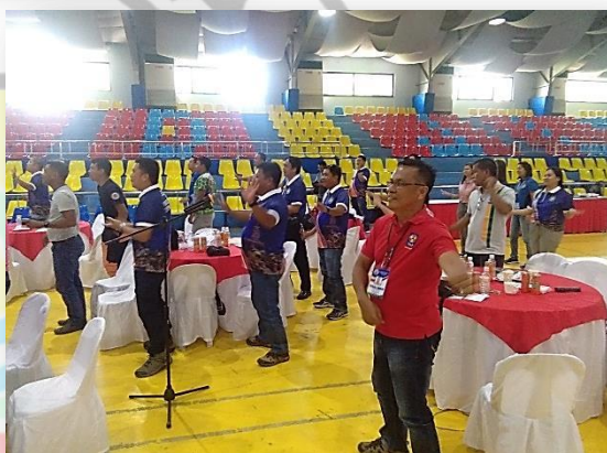
The Regional Disaster Resilience Forum at Community Center, Centro, City of Ilagan, Isabela last July 30, 2019