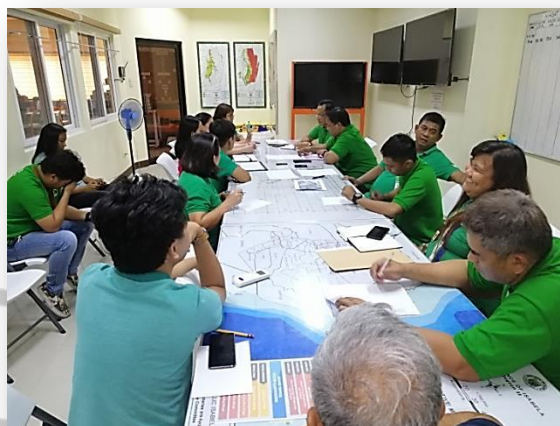
Meeting re: the Bloodletting Activity held at PDRRMO Operations Center, Capitol, Alibagu, City of Ilagan, Isabela last July 8, 2019