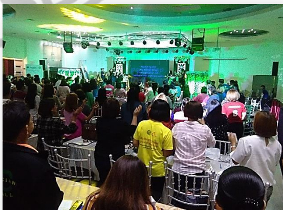
The DRRMH-Summit held at Japi Hotel, Cauayan City, Isabela last July 31, 2019