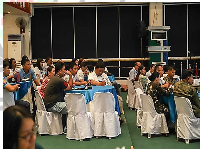
Joint LCPC, POC, PDRMC, PSB Meeting in support of Oplan Balik Eskwela 2019 of the DepEd at GFNDY Hall, Capitol, Alibagu, City of Ilagan, Isabela last May 31, 2019