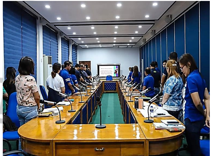
Depart of Interior and Local Government (DILG) Pre-Assessment at Blue Room, Capitol, City of Ilagan, Isabela last May 23, 2019