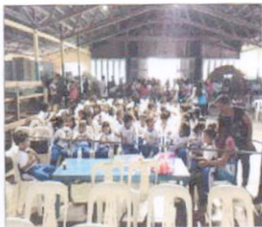
Pre-schooler waits in anticipation to the days lined up activities.