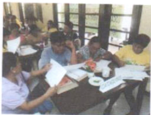
The barangay folks groups together for the LIPH workshop