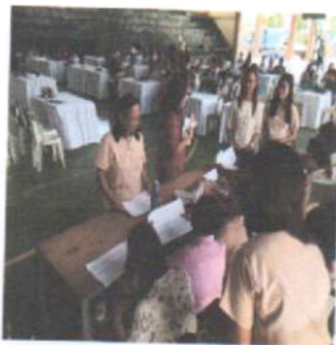
Barangay officials presents their output during the LIPH orientation/workshop