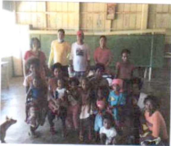
The Agta community in Palanan, Isabela takes a pose with the provincial Health Dentists and their very own municipal Dentist