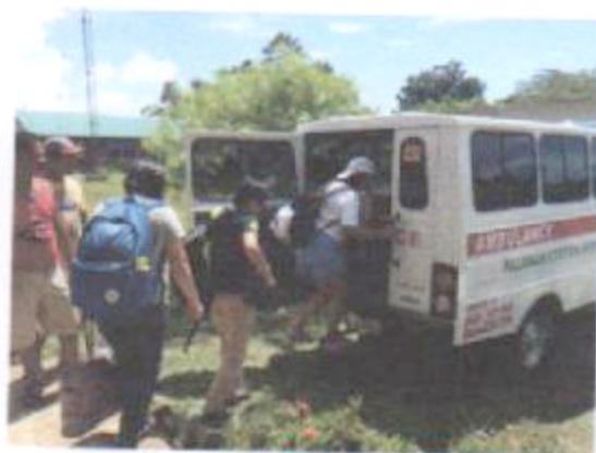
Palanan Station Hospital, as well as the RHU staff, welcome the IPHO field health personnels.