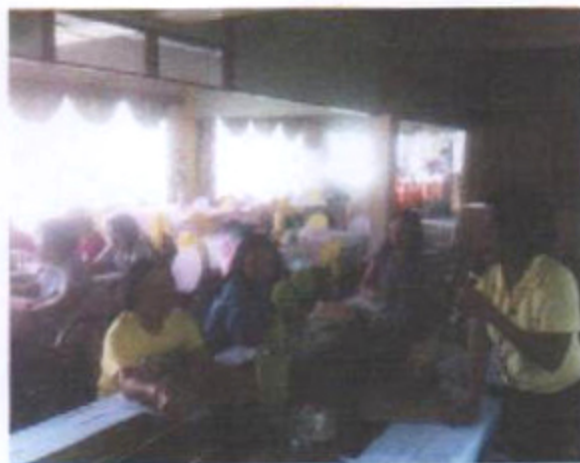
The Nurse IV from the Isabela Provincial Health Office shares her insights during the interactive forum on setting-up of recording/reporting system.