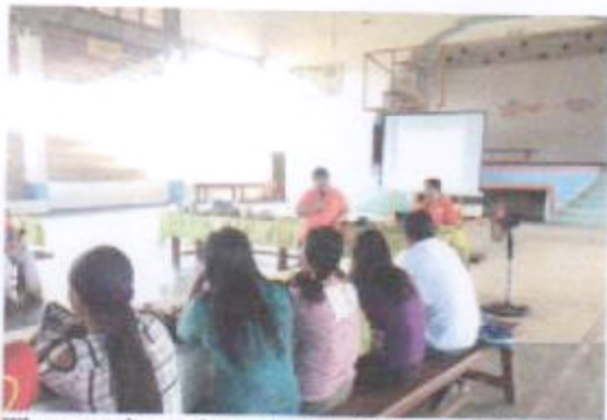
The one-day orientation/ update at Divilacan, Isabela