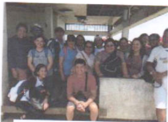
The 18 field Health staff beams upon arrival at Palanan, Isabela via Sky Pasada airline in Tuguegarao, City.

The said annual activity aims to strengthen the involvement of the Rural Health Units, BHWs, BNS, Day Care Workers and CHT partners in Health Education, Promotion, Advocacy and Social Marketing of Public Health Programs