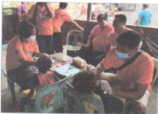
Public Health Dentists perform fluoride application to Dumagat kids in Divilacan, Isabela.