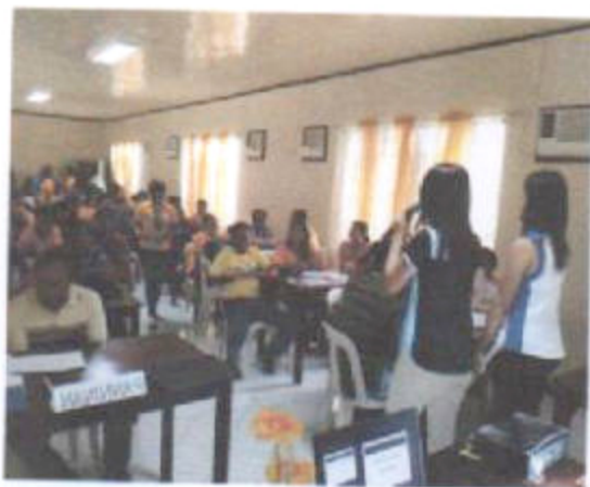
The MHO of San Mariano welcomes everyone. PHO I airs her inspiring message to all the participants