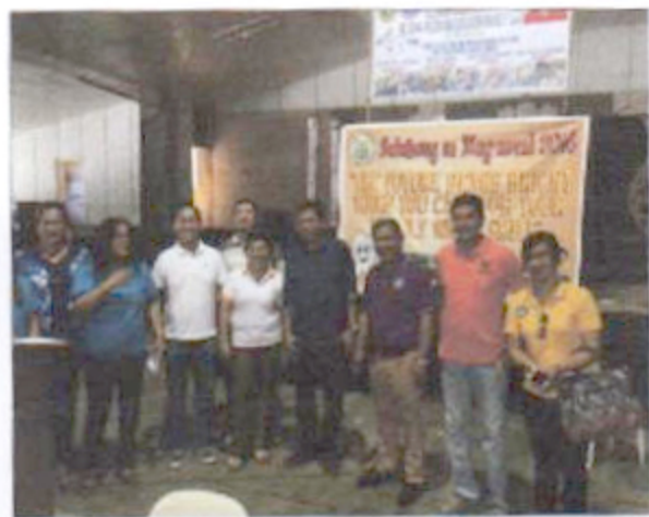
The Provincial Dentist II in partnership with Ramon officials spearheads the event.