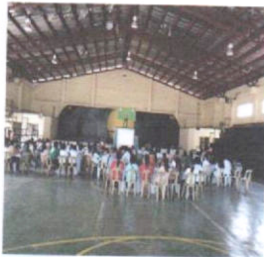
Every LIPH stakeholders eagerly shares their views