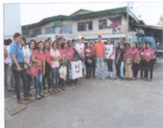
Public Health and Hospital Dentists pose before the parade