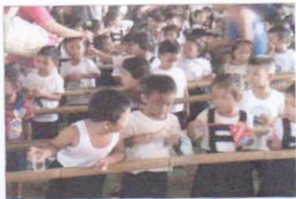
Actual tooth brushing drill before the fluoride application