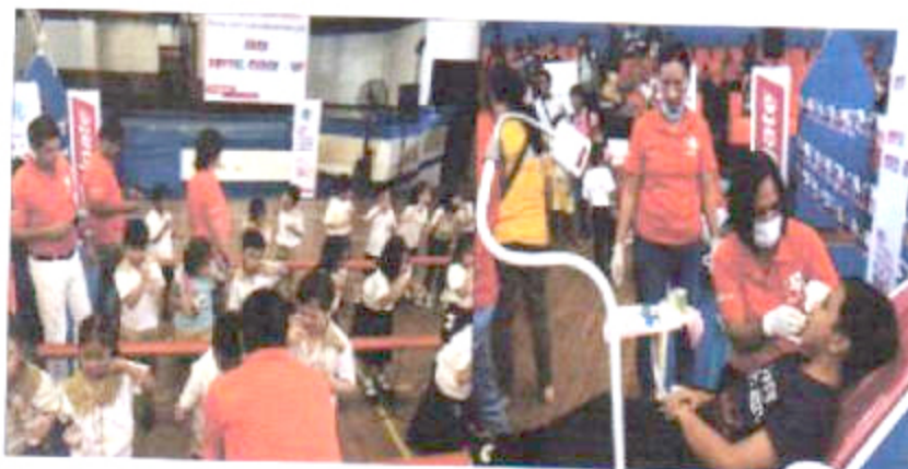
Pre- schoolers enjoy the Toothbrushing drill