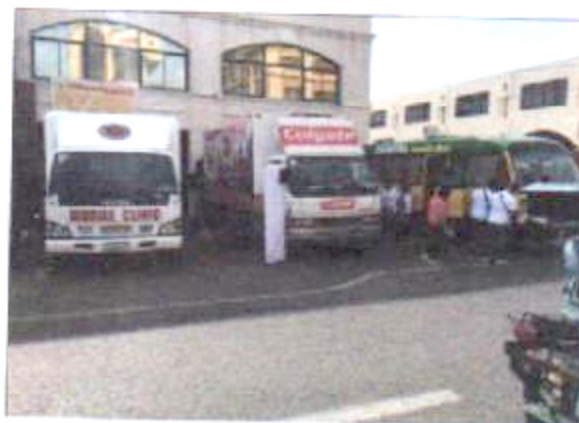
Mobile dental buses of the province as well as partners and sponsors utilizes their facility for the fluoride application.