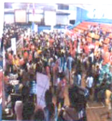
The influx of children and people just to witness the successful event.