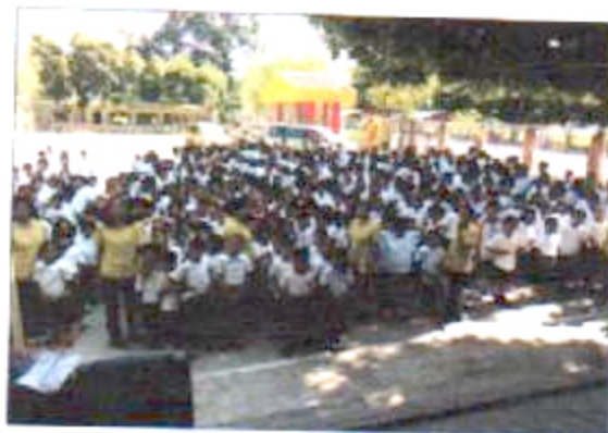
Sta. Maria pre-schooler gets ready as they welcome the "Salubong sa Mag aaral" activity