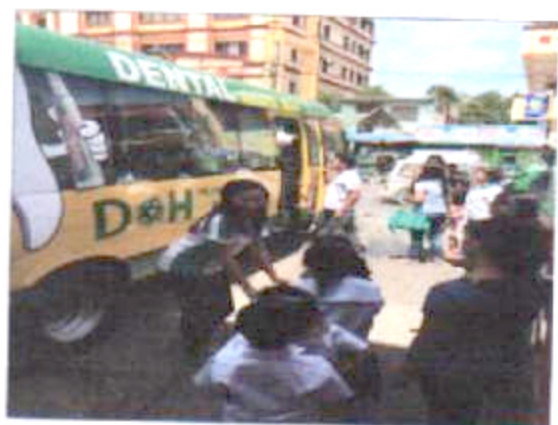
PHO staff ushers in children inside the mobile Isabela Dental health bus for the fluoride application.