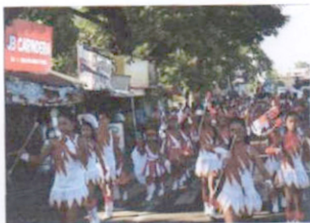
The Salubong sa Mag-aaral event kicks off with a parade from the participating schools of Alicia, Isabela