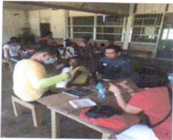
Fluoride application to Agta Children of Palanan