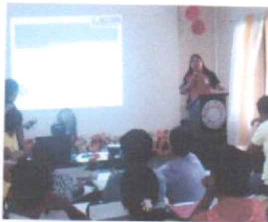
The Supervising AO of IPHO gives an Overview of the LIPH Orientation/workshop