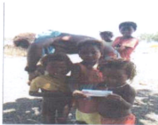
Dumagat children of Maconacon, Isabela were given free toothpastes and toothbrushes.