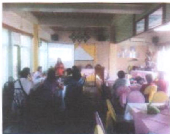
Prevention of Blindness Program Coordinator discusses the roles and responsibilities of the Local Committee on Sight preservation.