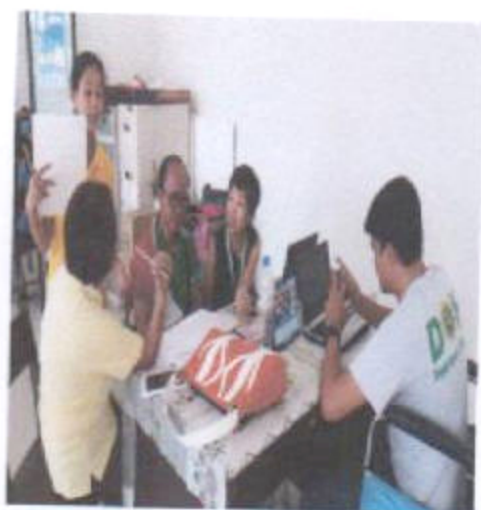
RHO2 DMOs and IPHO staff mentors the supervising nurse re LIPH worksheets