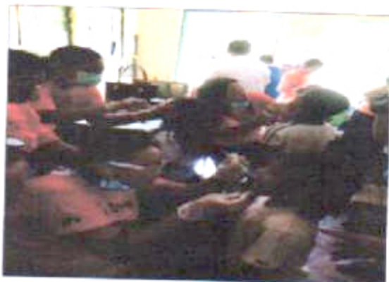
Public Health and Hospital Dentists in action...