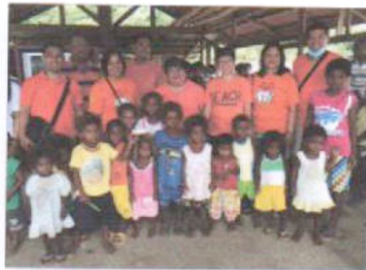
The IPHO team during the coastal integrated monitoring with the Dumagat children of Divilacan, Isabela on July 2016