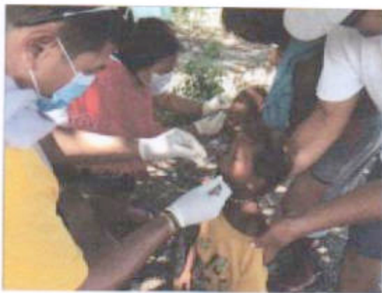
Fluoride application in Maconacon, Isabela