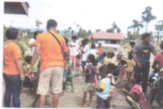
Oral Health program: toothbrushing drill at Divilacan, Isabela.