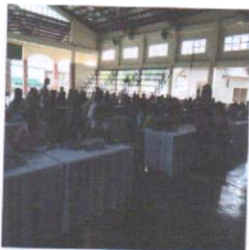
The MHO gives the over-all objective of the LIPH orientation/workshop to the participants of every barangay