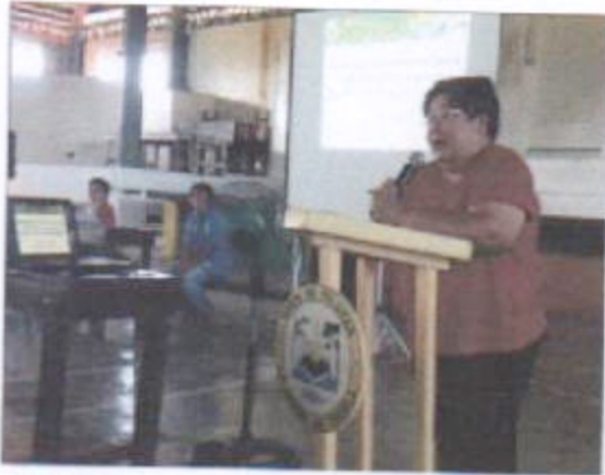
PHO II gives an inspiring message to Palanan constituents