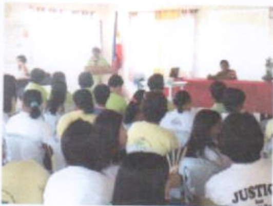
Together with the Vice mayor of Maconacon, Isabela, PHO II thanks the participants for coming to learn.