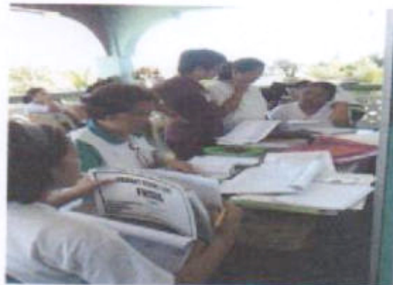
While training/update is ongoing for the BHWs, BNS and others, Data Quality check for RHU staff in Maconacon ensues.