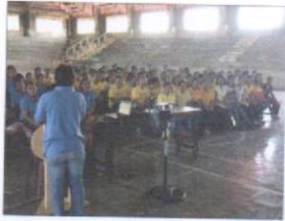
The LMB of Palanan grateful of the visit, urges the participants to attentively listen to all the lectures, as she warmly welcomes the IPHO monitoring team