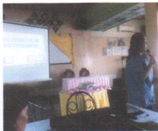
Rural Health Physician from the Isabela Provincial Health Office delivers her opening remarks during the Local Committee on Sight preservation.