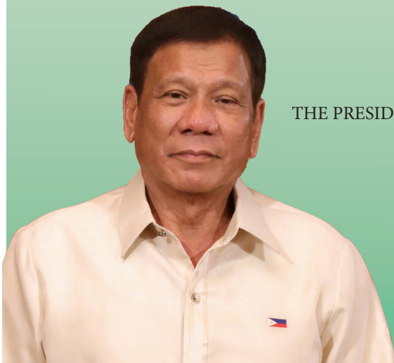
RODRIGO ROA DUTERTE