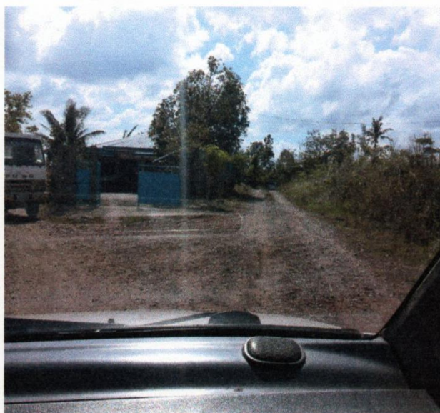
Old Road at Guibang, Gamu, Isabela