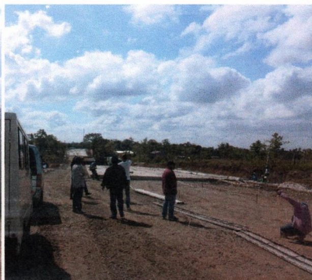
On-going concreting of By-Pass and Diversion Road at Guibang, Gamu, Isabela