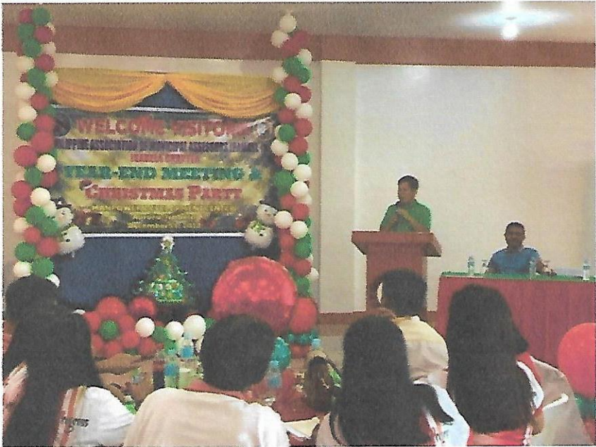
PAMAS Meeting and Christmas Party on December 19, 2022 at LGU- Aurora, Isabela