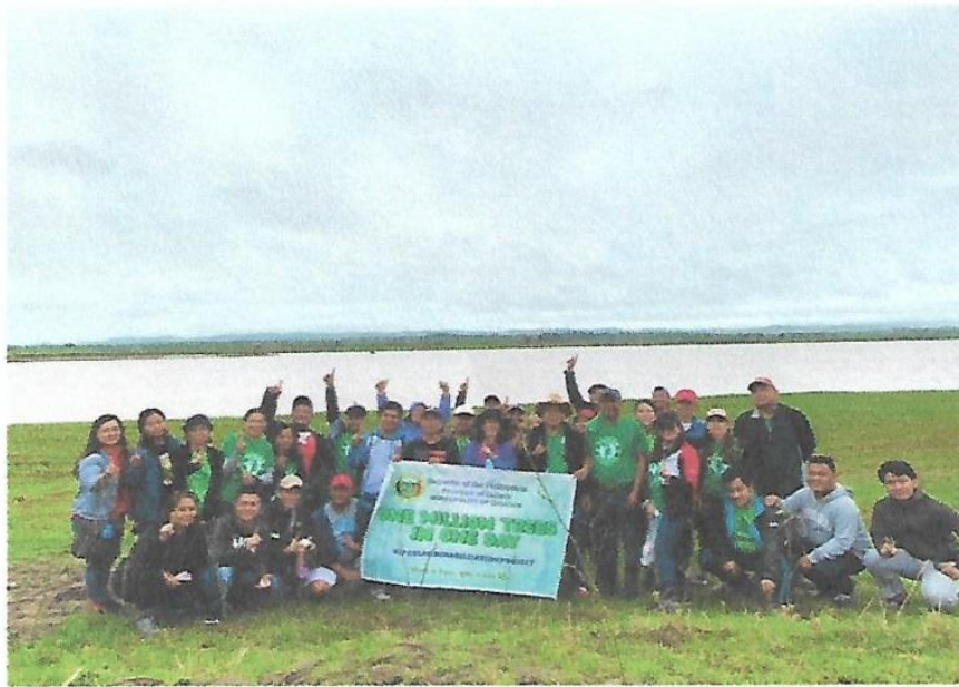
Taken during the One Million Bamboo Tree-Planting activity On December 20, 22 at Casibarag Norte, Cabagan, Isabela