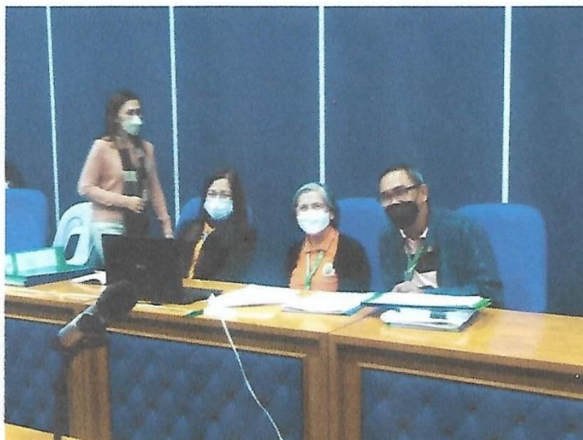
Taken during the ISO 9001:2015 System's Audit by Certifying Body (Stage 2)