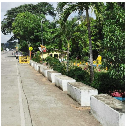
Ocular inspection conducted by Technical Team of the Provincial Appraisal Committee at Nappaccu, Reina Mercedes, Isabela