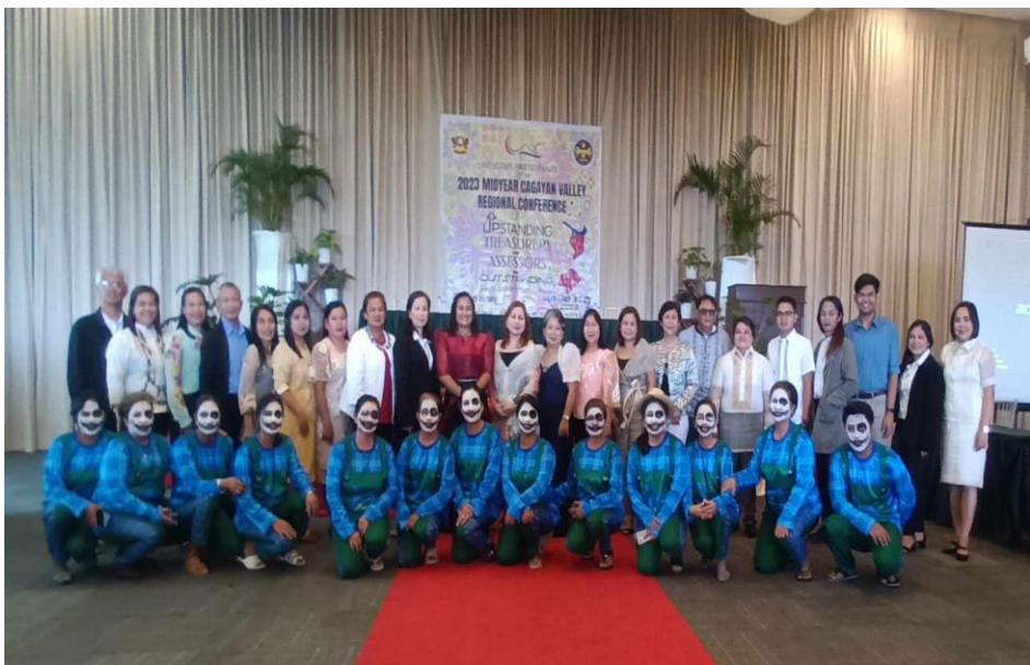
Participants in the concluded 2023 Midyear Cagayan Valley Regional Conference held at Crown Legacy, Baguio City