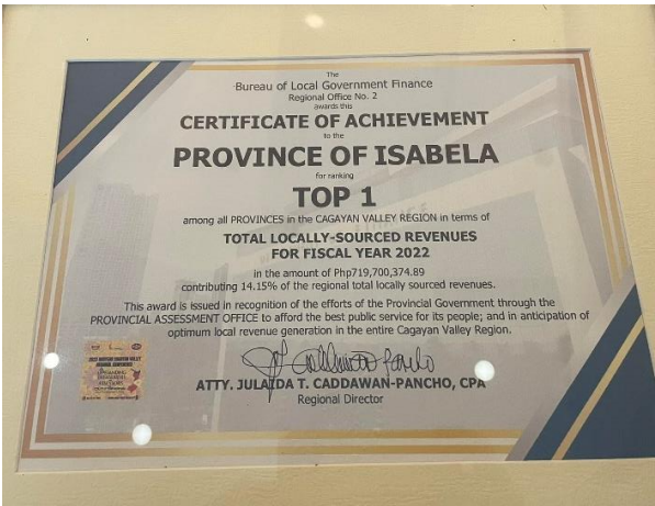
Certificate of Achievements Awarded to the province of Isabela, during the s received by the Province of Isabela during the 2023 Midyear Cagayan Valley Regional Conference held at Crown Legacy, Baguio