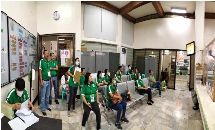
The Provincial Assessor and staff during the State of the Nation Address of President Ferdinand R. Marcos Jr.