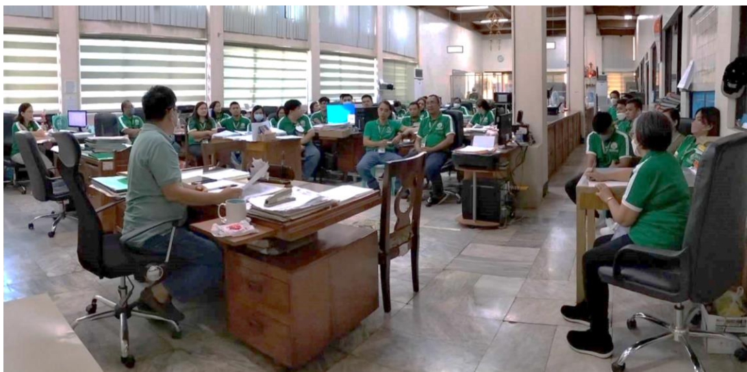
The Provincial Assessor meet his staff on July 11, 2023 and have discussed important matters.

Some pictures taken during the different activities