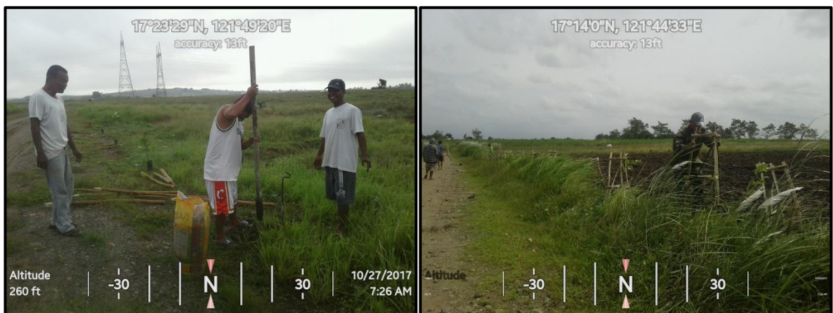
Road side planting conducted at Cansan, Cabagan on October 27, 2017.

In coordination with the Local Government Units, both barangay and municipality, site preparation activities were supervised and conducted. As of October, 2017 the road side planting was already conducted at Cansan, Cabagan and Carmencita, Delfin Albano on October 27, 2017 and October 28, 2017 respectively. On the other hand, Calamagui, San Pablo road side planting is set to be conducted on November 9, 2017.