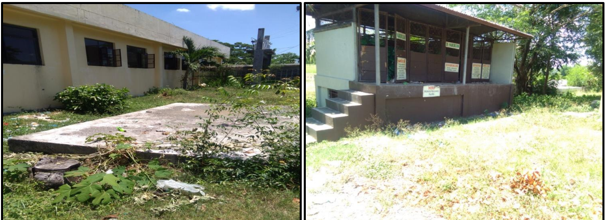
Roxas District Hospital: (Right) Septic vault; (Left) MRF