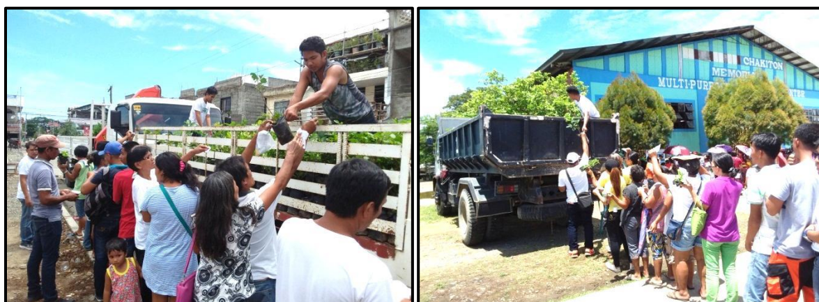
ENR Personnel distributing fruit-tree seedlings to farmer beneficiaries during Farmers' Congress sa Barangay 2.0 at Cabagan (left) and Dinapigue (right), Isabela