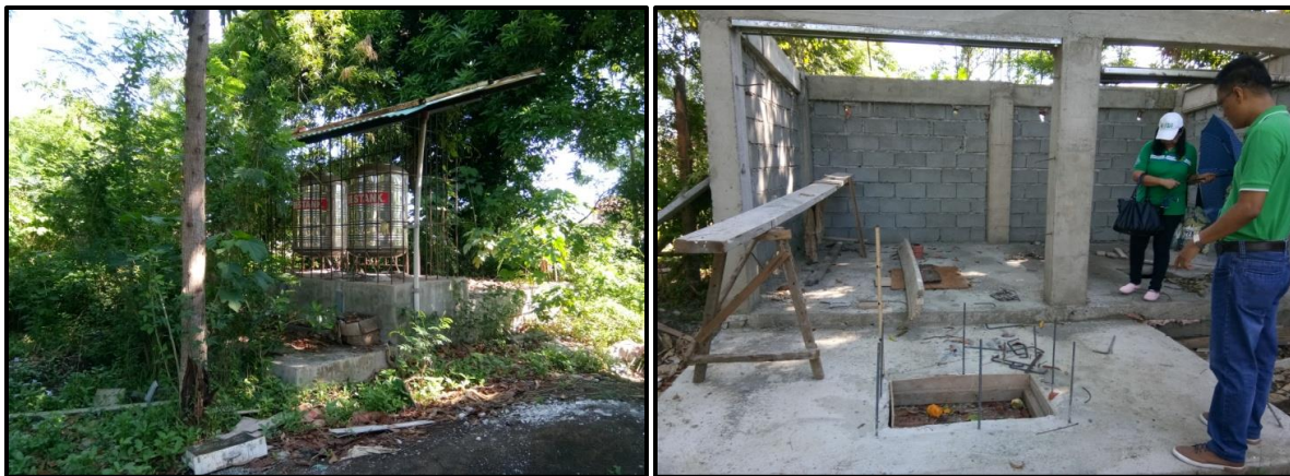
Cabagan District Hospital: (Right) Current Infectious vault; (Left) New Infectious vault under construction