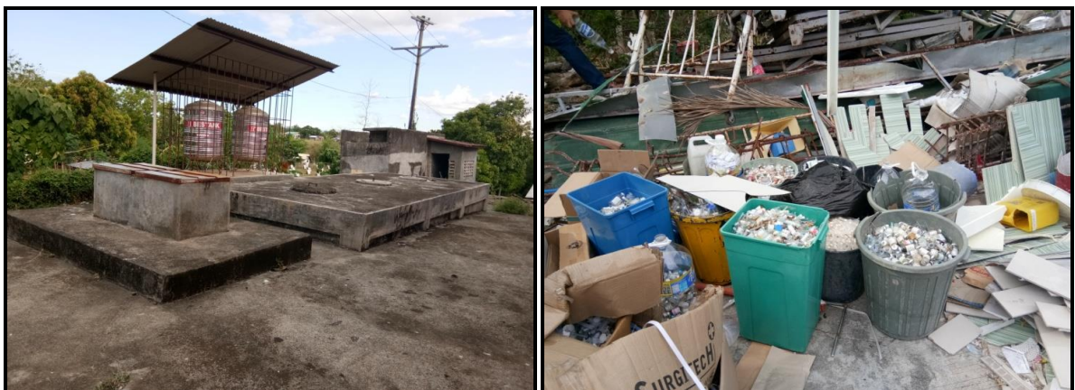
Cauayan District Hospital: (Right) Infectious vault; (Left) Hazardous wastes for disposal