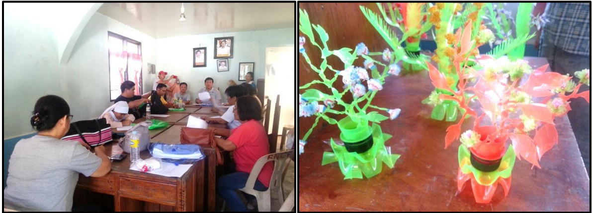
Barangay Bucal Sur, Dinapigue, Isabela