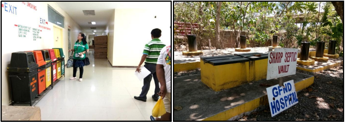
Governor Faustino N. Dy Sr Memorial Hospital: (Right) Lobby; (Right) Sharp septic vault