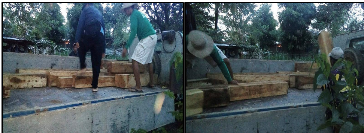
ENR personnel and ISEP-TF loading the abandoned forest products seized at Aggasian, City of Ilagan, Isabela

For this month, a total of 208 pieces of different species of CHW (Lumber and Flitches) with a total volume of Three Thousand Four Hundred Seventy Four and 60/100 (3,474.60) board feet and a total of 52 pieces of Narra Flitches with a volume of One Thousand Two Hundred Ninety Eight (1,298.00) board feet were apprehended in the conduct of forestry laws and enforcement activities thru the combine efforts of PGI-ENRO, ISEP-TF and partner agencies. These apprehended lumbers & flitches are under the custody of PGI-ENRO.