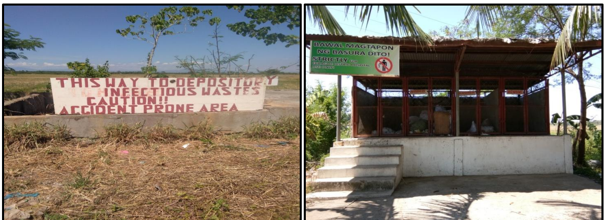
Echague District Hospital: (Right) Infectious vault; (Left) MRF