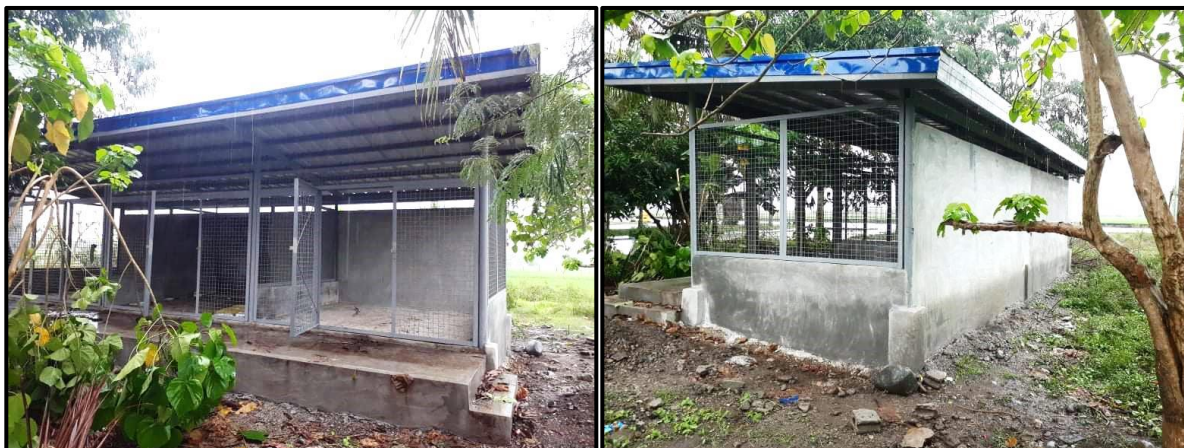
Photos of the MRF established at Echague District Hospital