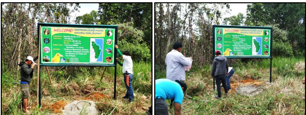
Putting-up of placards in the NSMNP Buffer Zone together with DENR-PENRO Isabela