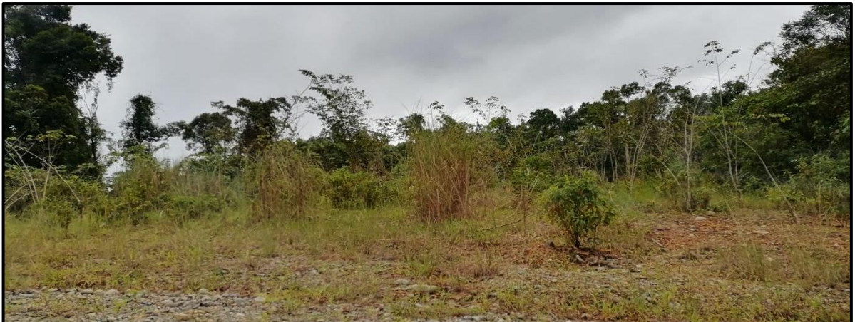
No major impact was seen during the typhoon aftermath monitoring and documentation at the IDRRIP Reforestation Areas