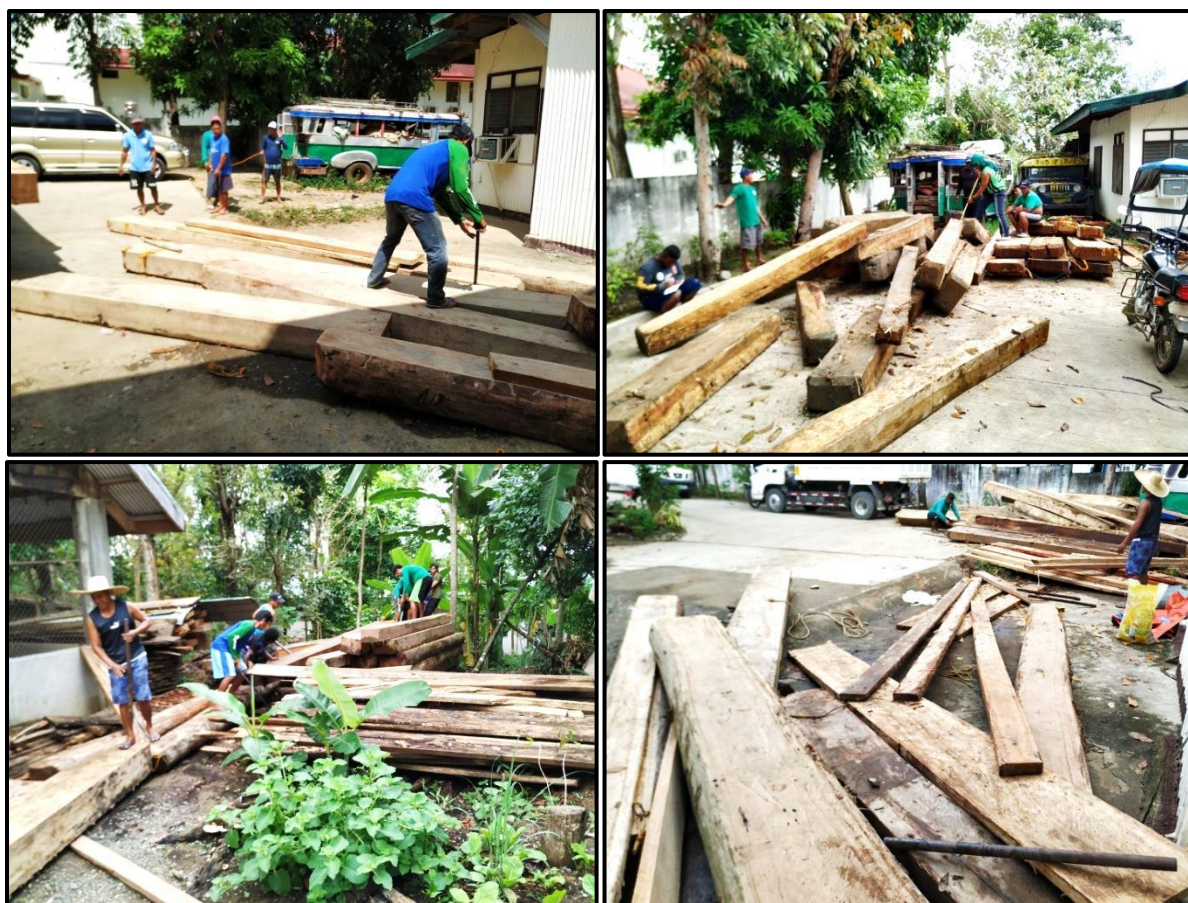
Photos during conduct of inventory, scaling and stockpiling of apprehended forest products under PGI custody.

The ISEP-TF also conducted inventory and stock piling of apprehended forest products under PGI custody. The good quality forest products were re-stockpiled and separated from the already weathered ones (no more economic value).