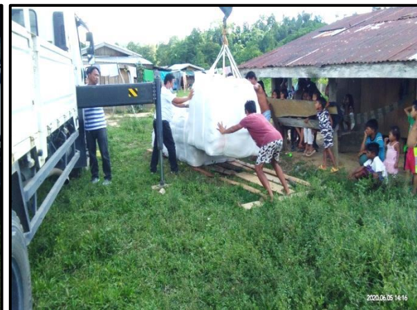
Delivery of construction materials to relocated Lagis residents in the vicinity of the road project