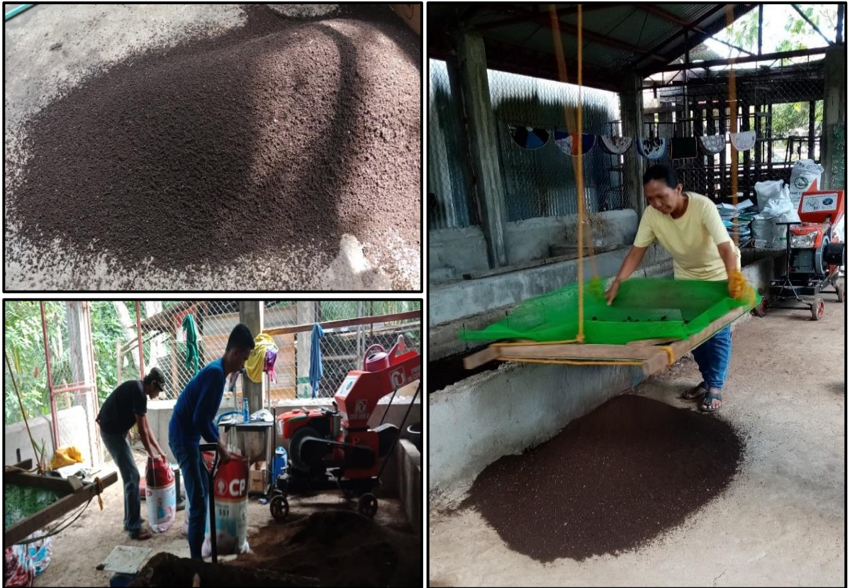
The first class organic fertilizer ready to harvest and undergo sieving prior to packaging and distribution to requesting agencies and individuals.