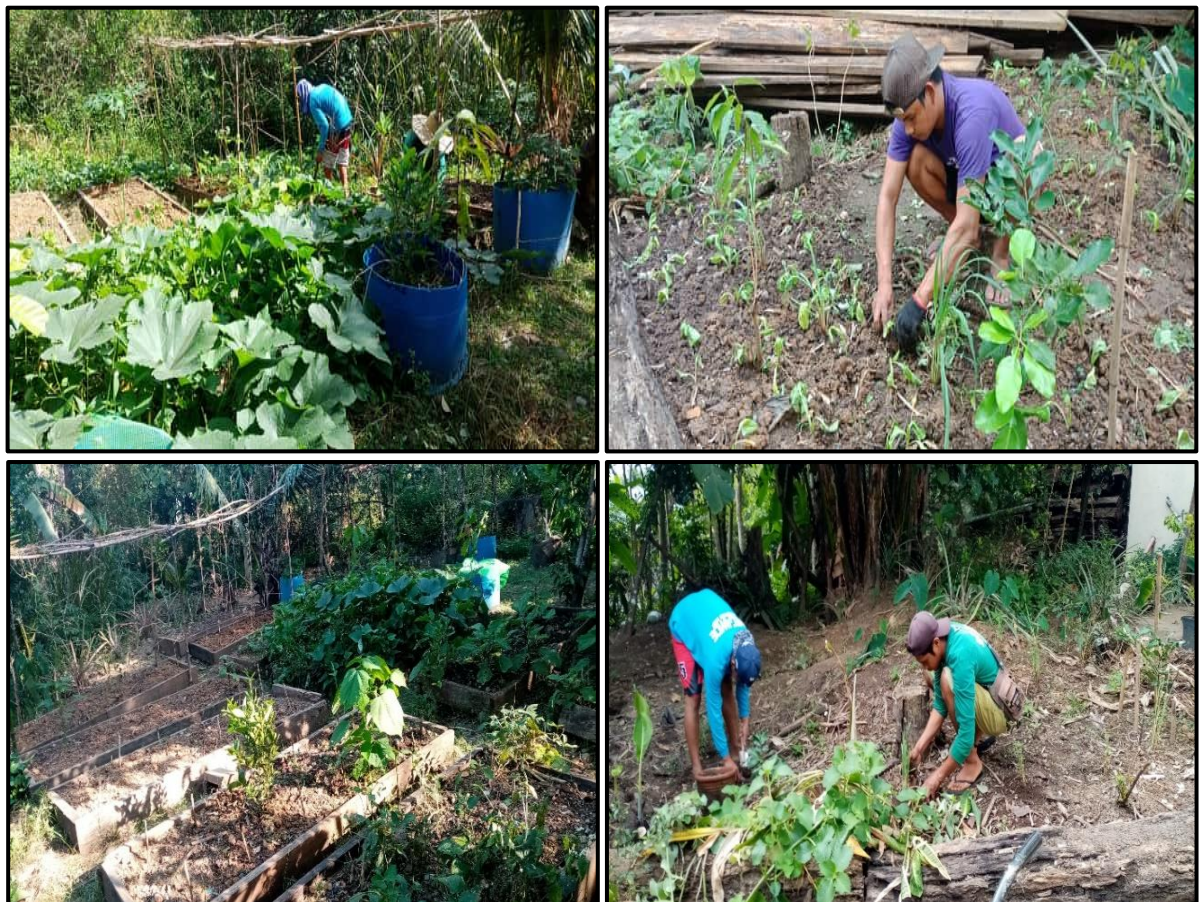
Establishment and development of an Organic Vegetable Garden utilizing the produced vermicasts and showcasing multi cropping as pest control measure.