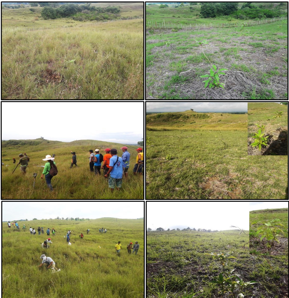
Photos showing portion of the Reforestation Project established on 2019 particularly at the Molave block where Molave seedlings showed high survival rate. Photos on the left side were taken during the establishment on September 5, 2019 while photos at the right side were taken on August 19, 2020 during project monitoring.

The project is a 6-hectare Reforestation established last 2019 in partnership with the Local Government Unit of Quezon. As counterpart, the Provincial Government provided for the seedling and fertilizer requirements. On the other hand, LGU Quezon thru their Municipal ENR Office conducted the site preparation, planting, maintenance and protection activities, supervised by this Office. The area is within the LGU maintained Forest Eco Park.