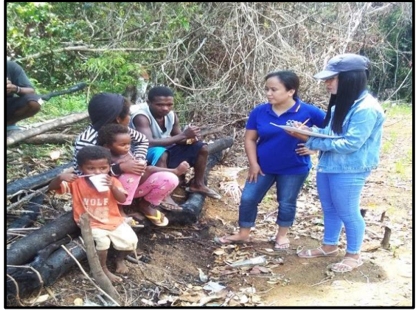
Inventory of Forest Occupants together with City LGU of Ilagan and DENR-CENRO Naguilian Personnel