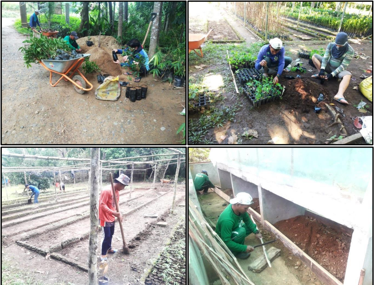
The Job Order laborers in the conduct of their regular activities at the Provincial and Clonal Nurseries