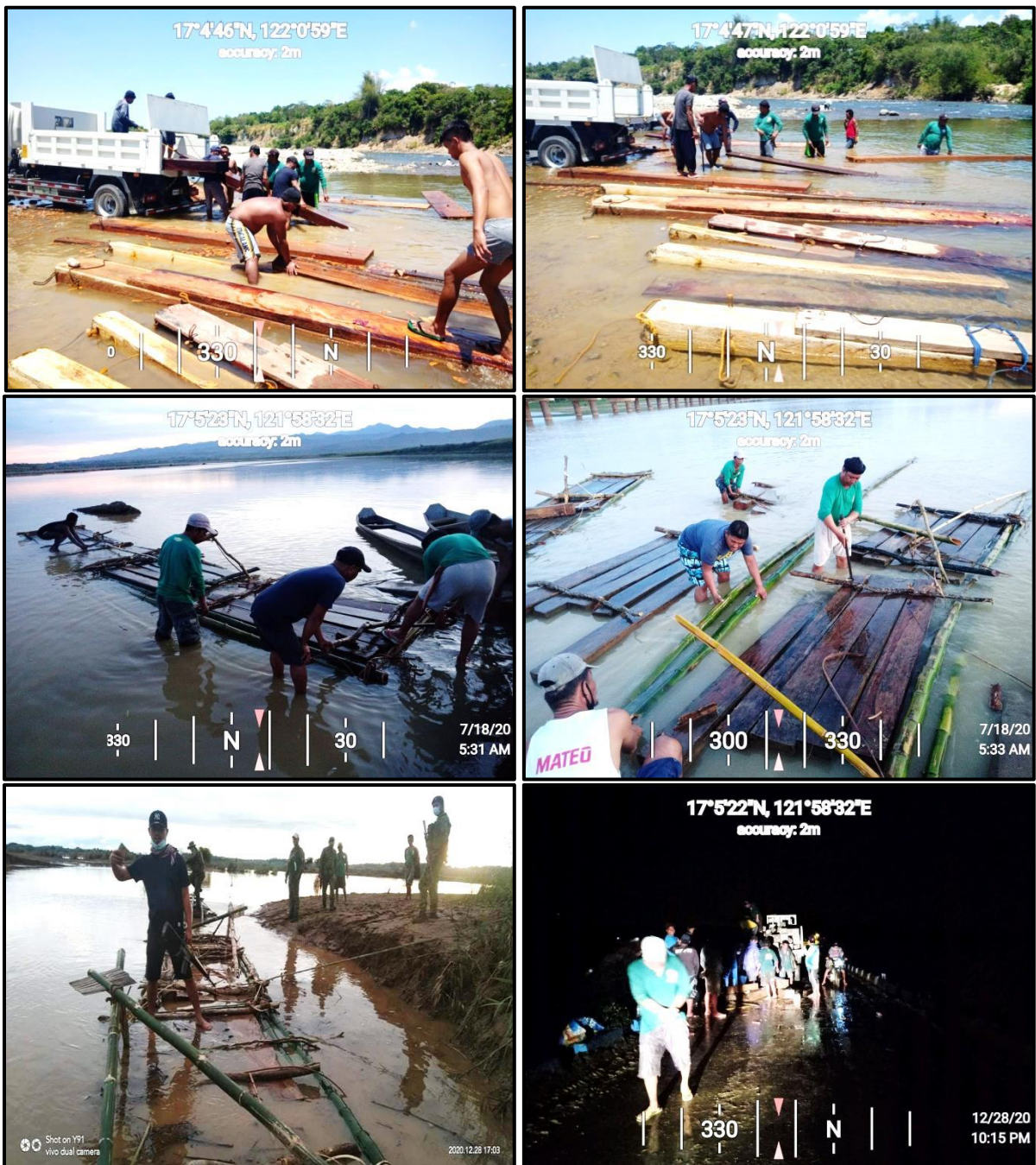
Photos during series of ISEP-TF forest protection activities with support from PNP personnel, where volume of forest products, mostly abandoned, was apprehended.