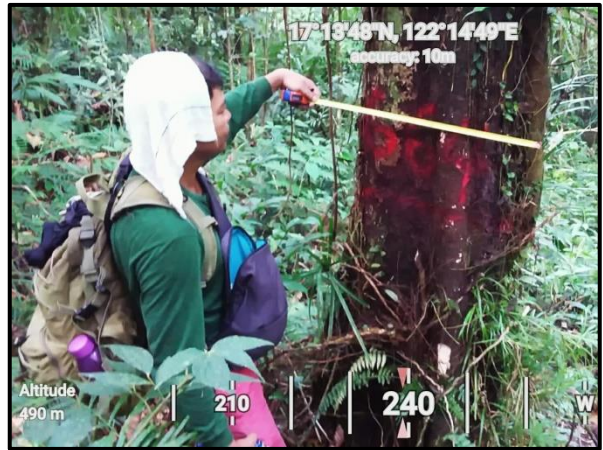
Photos during the conduct of inventory of standing trees within the proposed re-routing of IDR