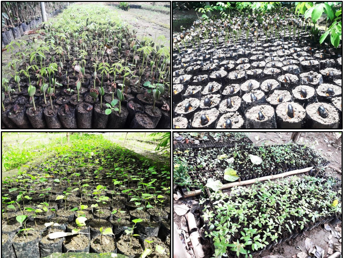
Photos showing some of the propagated Ipil, Tindalo, Narra and Kulipapa thru seeds and wildlings collected.