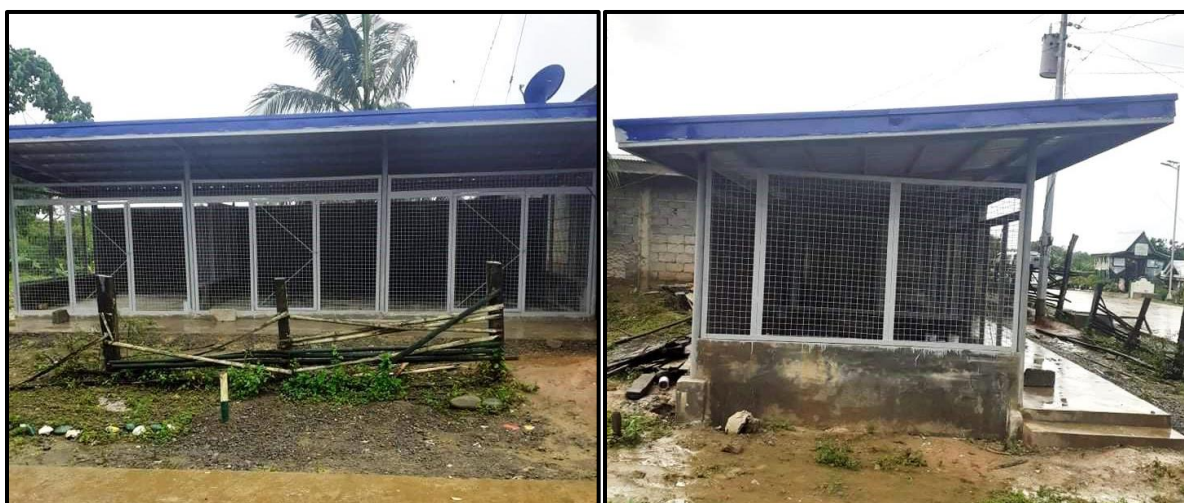
Photos of the MRF established at Barangay Villa Teresita, San Guillermo, Isabela.