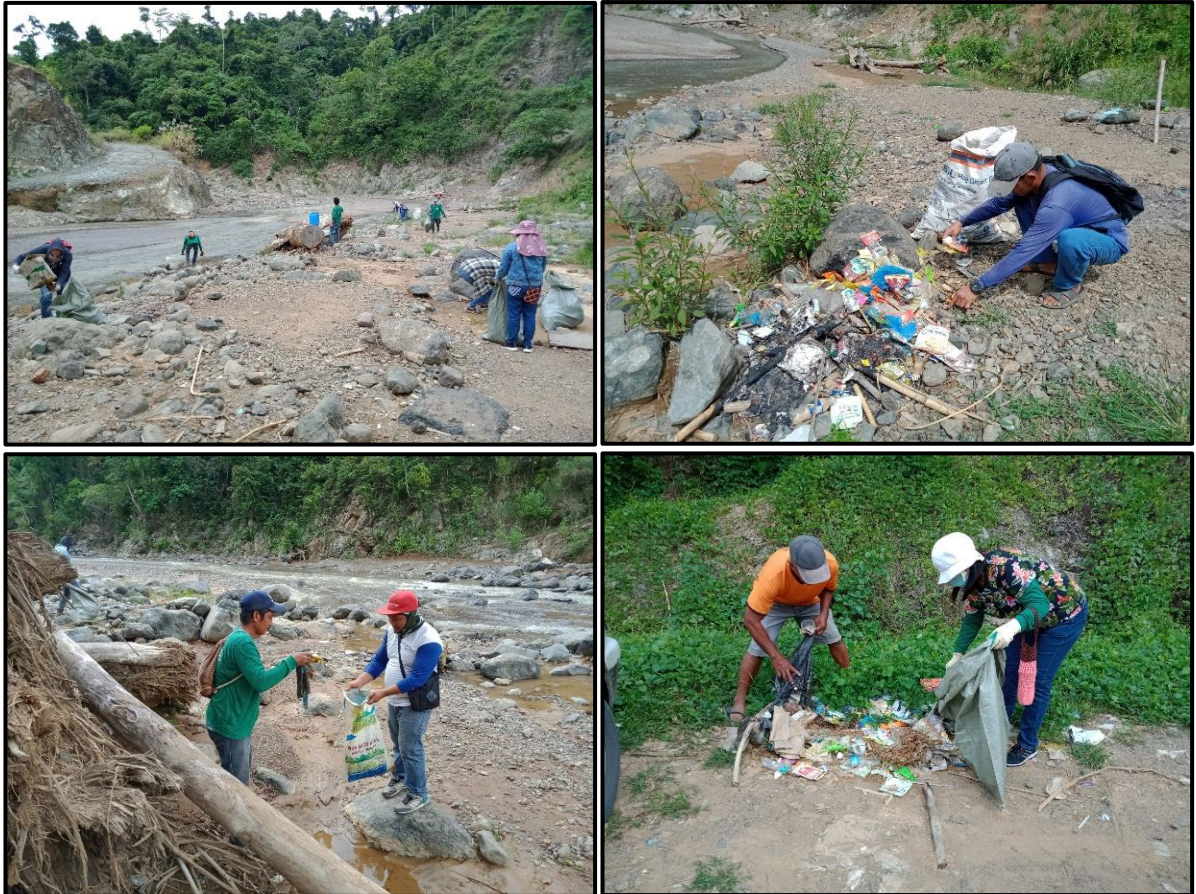
Photos of the clean-up activities implemented along Henekan and Disiope River