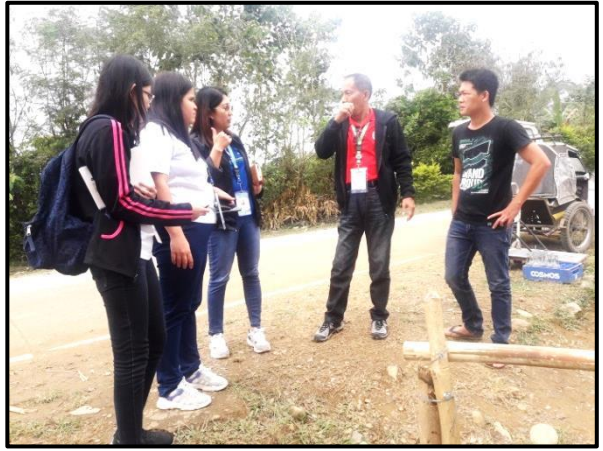
Compliance Monitoring of IDRRIP conducted by DENR-EMB R02 and PGI personnel.