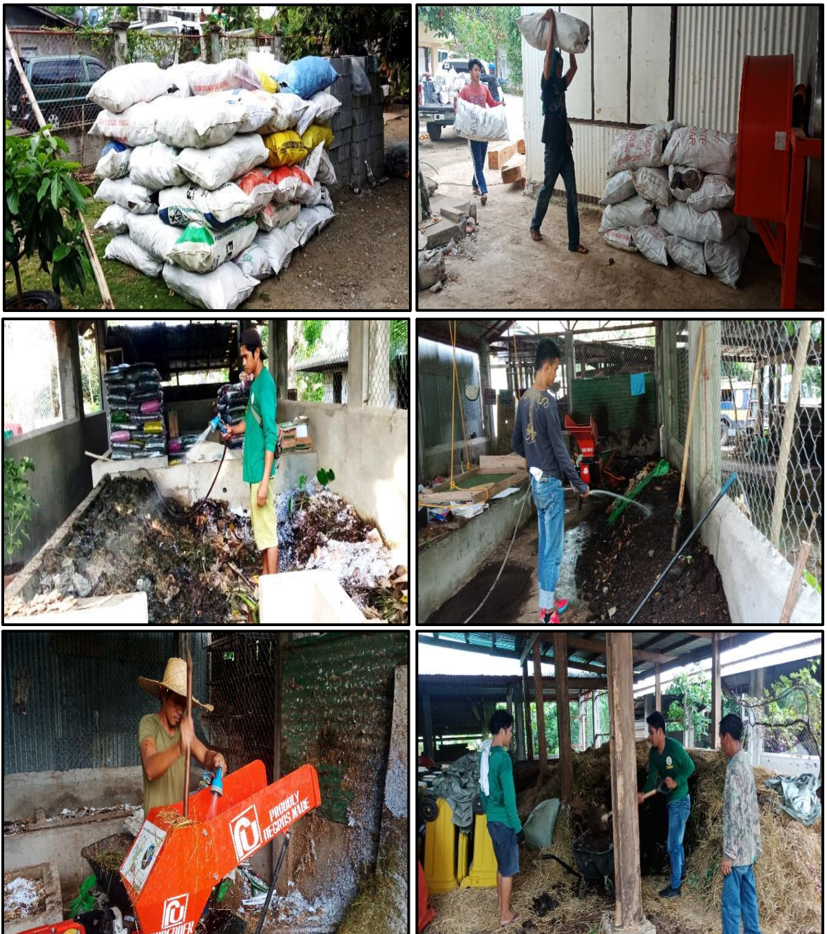
Operation and Maintenance of the Organic Fertilizer Production Facility utilizing the shredder machine to hasten decomposition of organic materials

In addition, the composting facility equipment specifically the shredder is also being utilized to assist in degrading materials for the vermin-worms. Continuous collection of organic materials is being implemented. The Organic Fertilizer Production Facility is manned by two Job-Order workers and supervised by one (1) technical personnel.