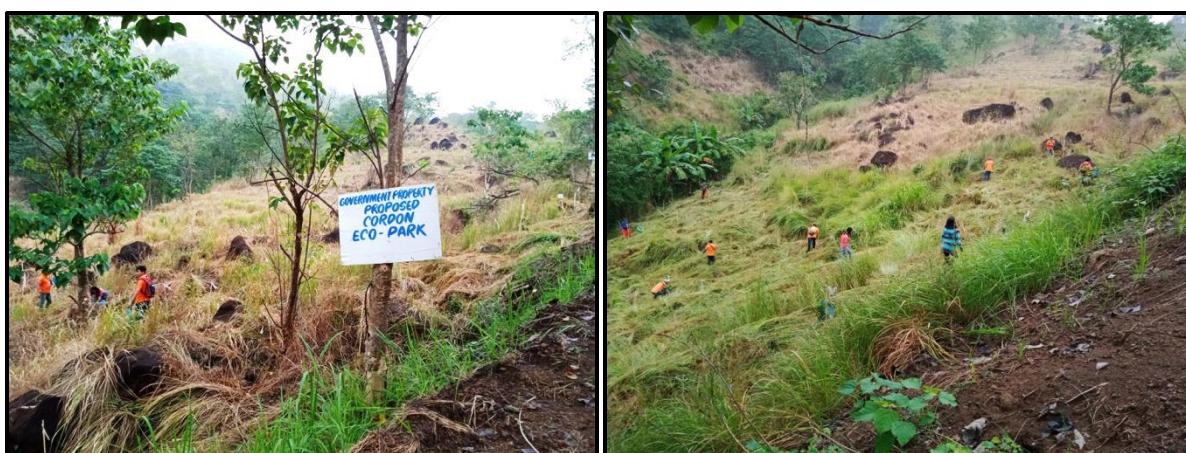
Tree planting at the Proposed Cordon Eco-Park

In conjunction with the same environmental events, tree planting activities were also conducted within LGU Echague compound and in their Sanitary Land Fill area at Brgy. Pangal Sur, Echague, Isabela on November 26, 2020.