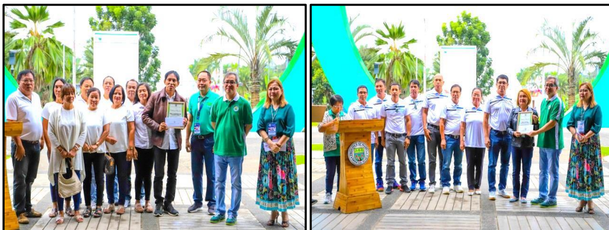
Barangay Officials of Casibarang Sur, Cabagan (Left Photo) and Gappal, Cauayan City (Right Photo) during the awarding ceremonies

The eight (8) non-winning barangay-entries awarded with consolation prizes amounting to Ten Thousand Pesos (₱ 10,000.00) each were the following: