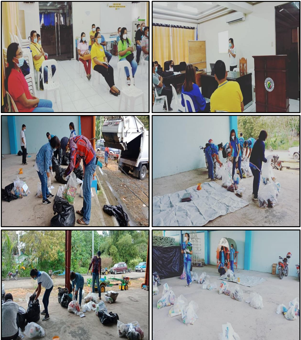
Pre-Orientation Workshop and actual conduct of WACS (November 10, 26 & December 3, 2020) at Quirino, Isabela

In compliance to the provision of RA 9003 known as the Ecological Solid Waste Management Act of 2000, the Provincial 10-year ESWM Plan is updated every two years thereafter based on the submitted individual plans of its component cities and municipalities. With the aim to come-up with sustainable programs, projects and activities for the plan implementation, the Provincial Government thru the ENR Office assisted in the updating of individual plans thru material and technical extension for the conduct of Waste Analysis and Characterization Study (WACS) of requesting municipality. For this year, only Quirino requested and extended technical assistance in updating of their expired 10-Year Plan.