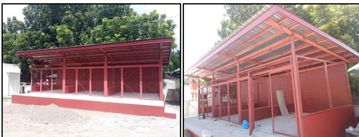
Photos of the MRF established at Barangay Ugad, Cabagan, Isabela.