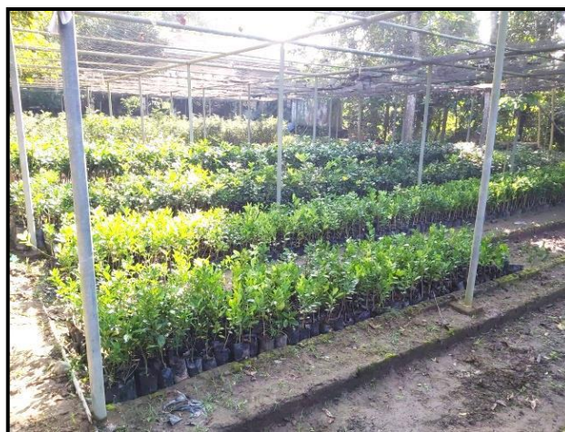
Table 1. Inventory of Seedlings at Provincial Nursery

For the year 2020, a total of 51,946 assorted fruit and forest tree seedlings both sexually and asexually propagated including the bamboo propagules were procured and produced and taken cared of at the Provincial and Clonal Nurseries. A total of 17,176 assorted seedlings were disposed and distributed to different public and private entities such as Municipal and Barangay LGUs, POs/NGOs/ Cooperatives, schools, other government agencies like the Philippine Army and Philippine National Police in support to our greening activities. However, due to unavoidable circumstances, 4.0% mortality rate equivalent to 2,074 seedlings was recorded.