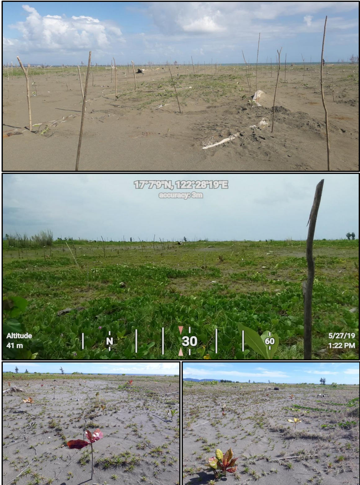
Photos of the 1-hectare Beach Forest Rehabilitation Project established on 2018 Upper: Taken on Nov. 11-12, 2018 , three (3) weeks after establishment and 2 weeks after the wrath of Typhoon Rosita. Middle: The 7-month old plantation taken on May 27, 2019 during project monitoring. Lower: Some of the photo documentation submitted by LGU Palanan taken on June 2020 showing project plantation development.