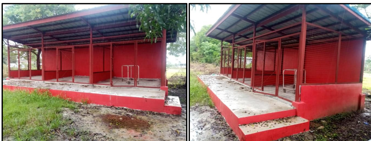
Photos of the MRF established at Milagros Albano District Hospital