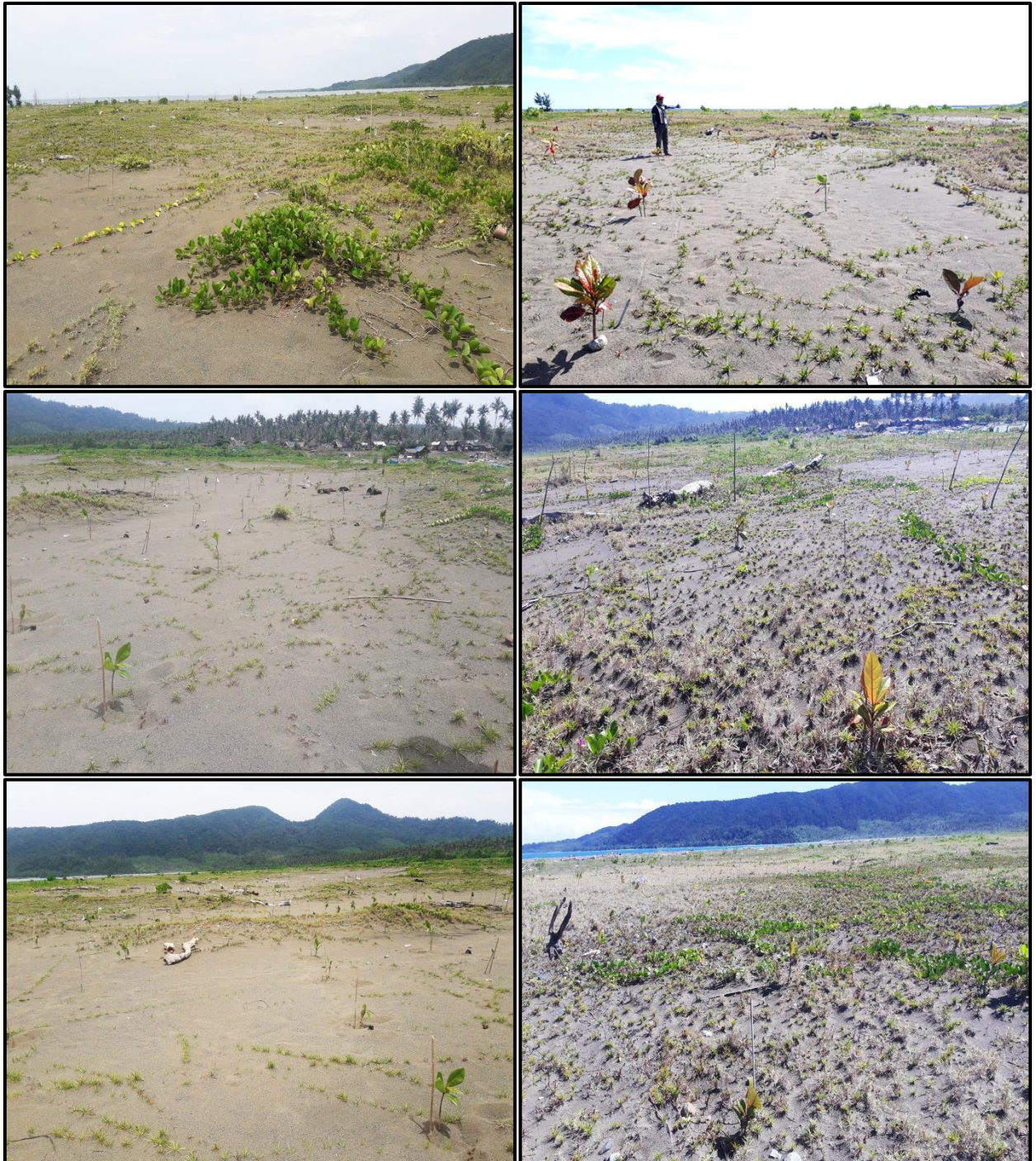
Photos of the 3-hectare Beach Forest Rehabilitation Project established on 2019

Left Side: Taken on May 2019 during the project inspection.