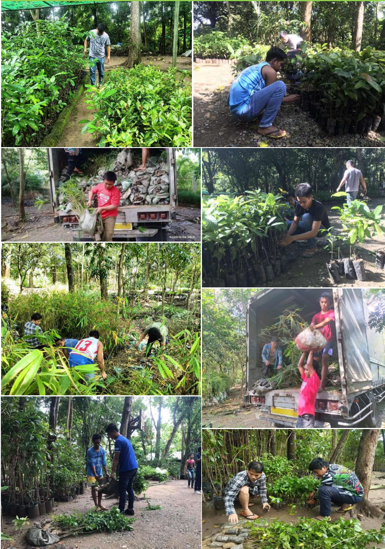
Pictures of the activities conducted at the ENRO Provincial Nursery for the month of December, 2023