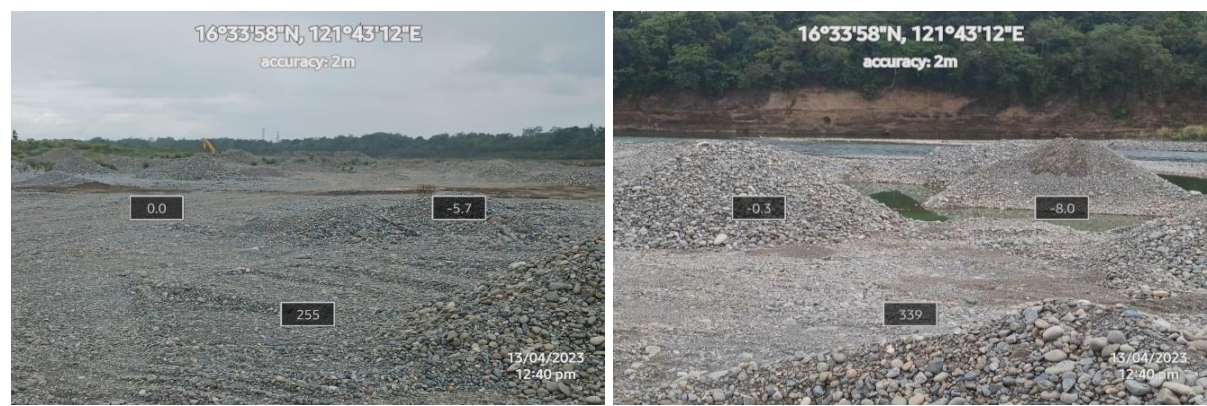
Disimpit, Jones, Isabela

Some of the photos daily submitted by ISEP-TF Operative Members assigned at the different quarry areas in the Province for the month of April, 2023.