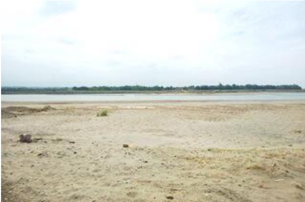
Calamagui East, Santa Maria, Isabela