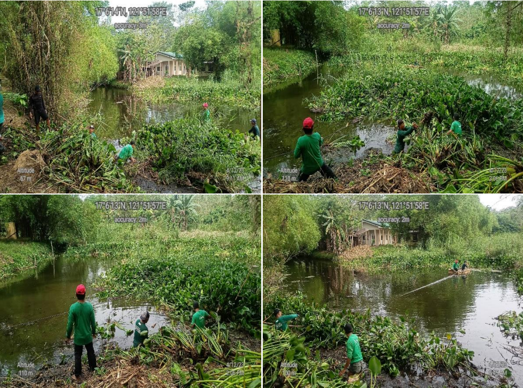
Clearing/removal of water hyacinths at the swamp areas of IPDC eco-park.