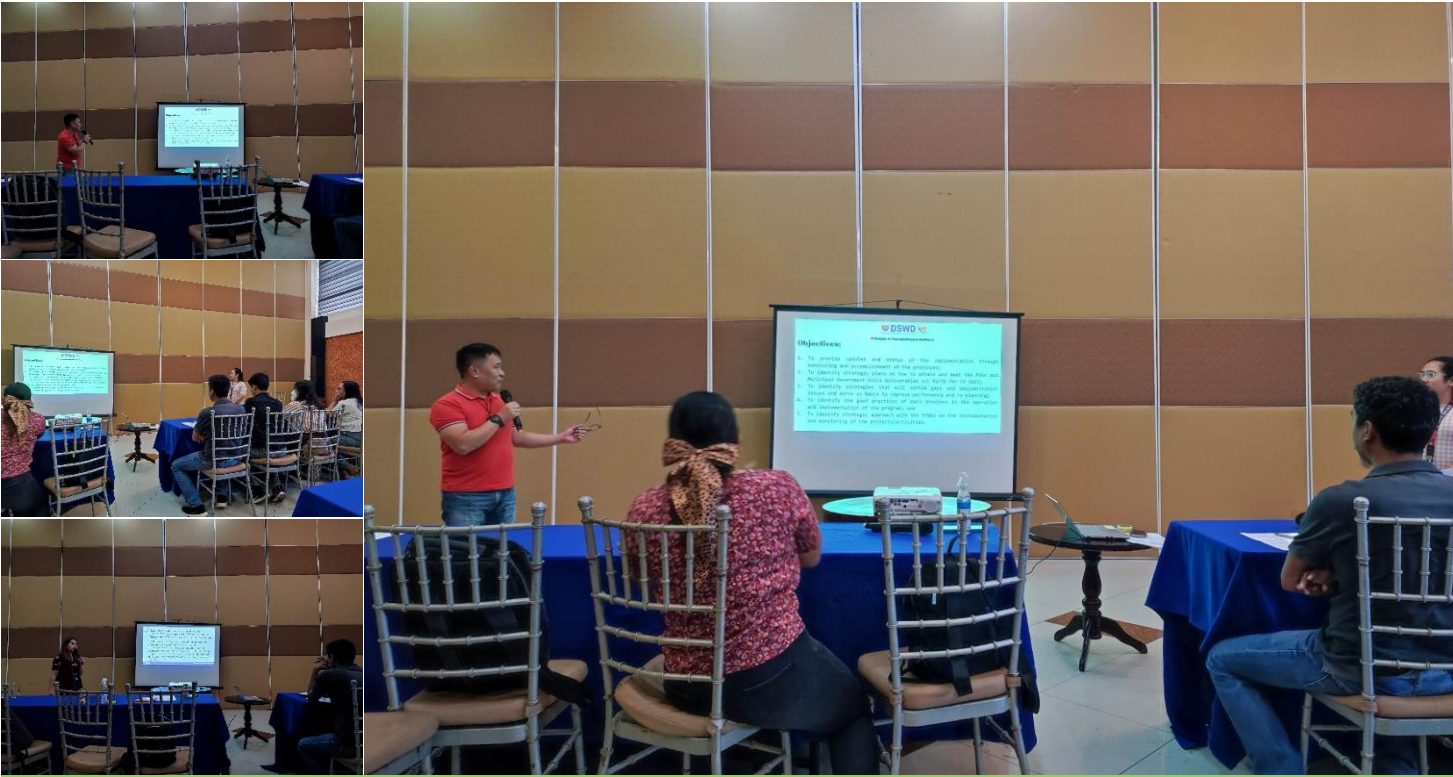
Consultation Meeting on RRP-CCAM thru Cash for Work on April 14, 2023 at Marco Paulo Hotel, Cauayan City, Isabela.