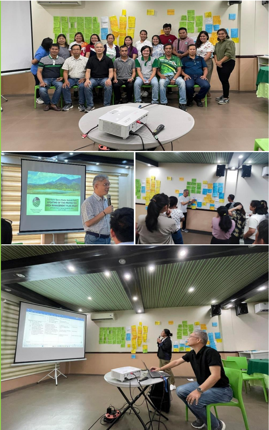
Workshop on the Updating of the NSMNP Management Plan at Japi Hotel, Cauayan City, Isabela on April 11-15, 2023