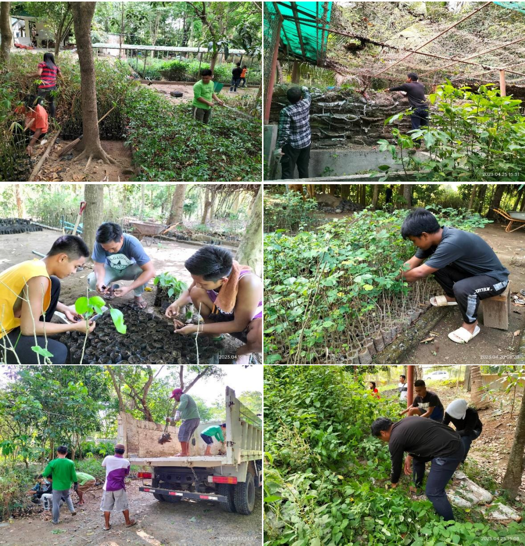
Pictures of the activities conducted at the ENRO Provincial Nursery for the month of April, 2023.