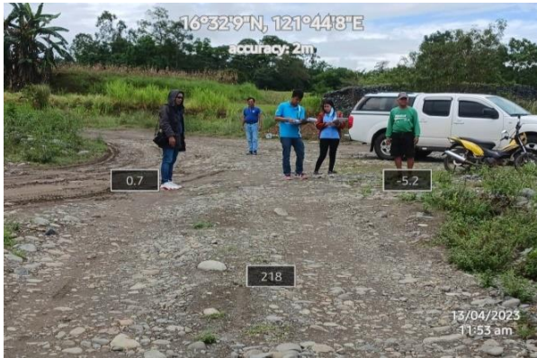
Nemmatan, San Agustin, Isabela