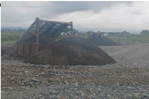
Sinaoangan, San Agustin, Isabela