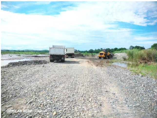
Some of the photos daily submitted by ISEP-TF Operative Members assigned at the different quarry areas in the Province for the month of August, 2023.