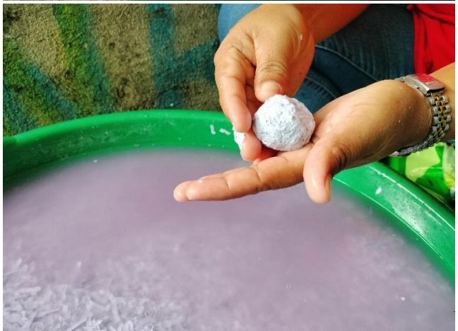
Production of Charcoal Briquettes