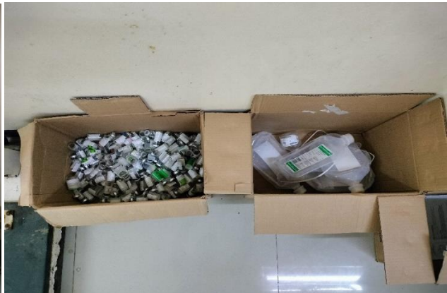
Monitoring of Healthcare Waste Management of Gov. Faustino N. Dy Sr. Memorial Hospital conducted on August 28, 2023