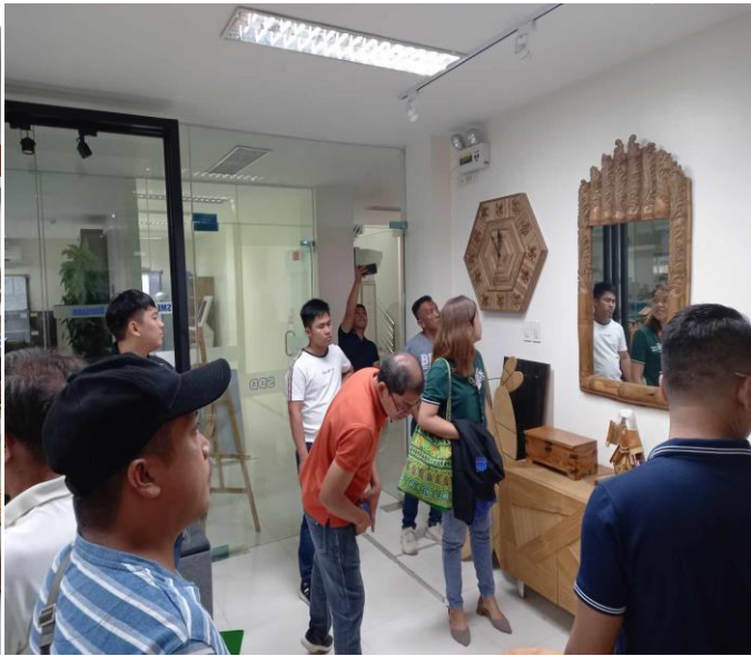
Benchmarking Activity of SSF Rattan Processing Center at San Fernando, Pampanga on August 30-September 1, 2023.