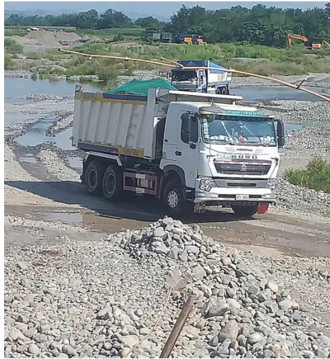
Some of the photos of monitoring activities conducted at Dinapigue, Isabela.