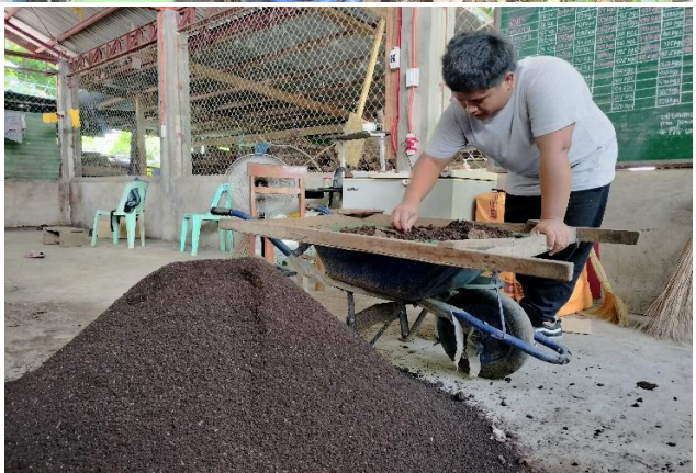
Production of Organic Fertilizer thru Vermicomposting for the month of August, 2023