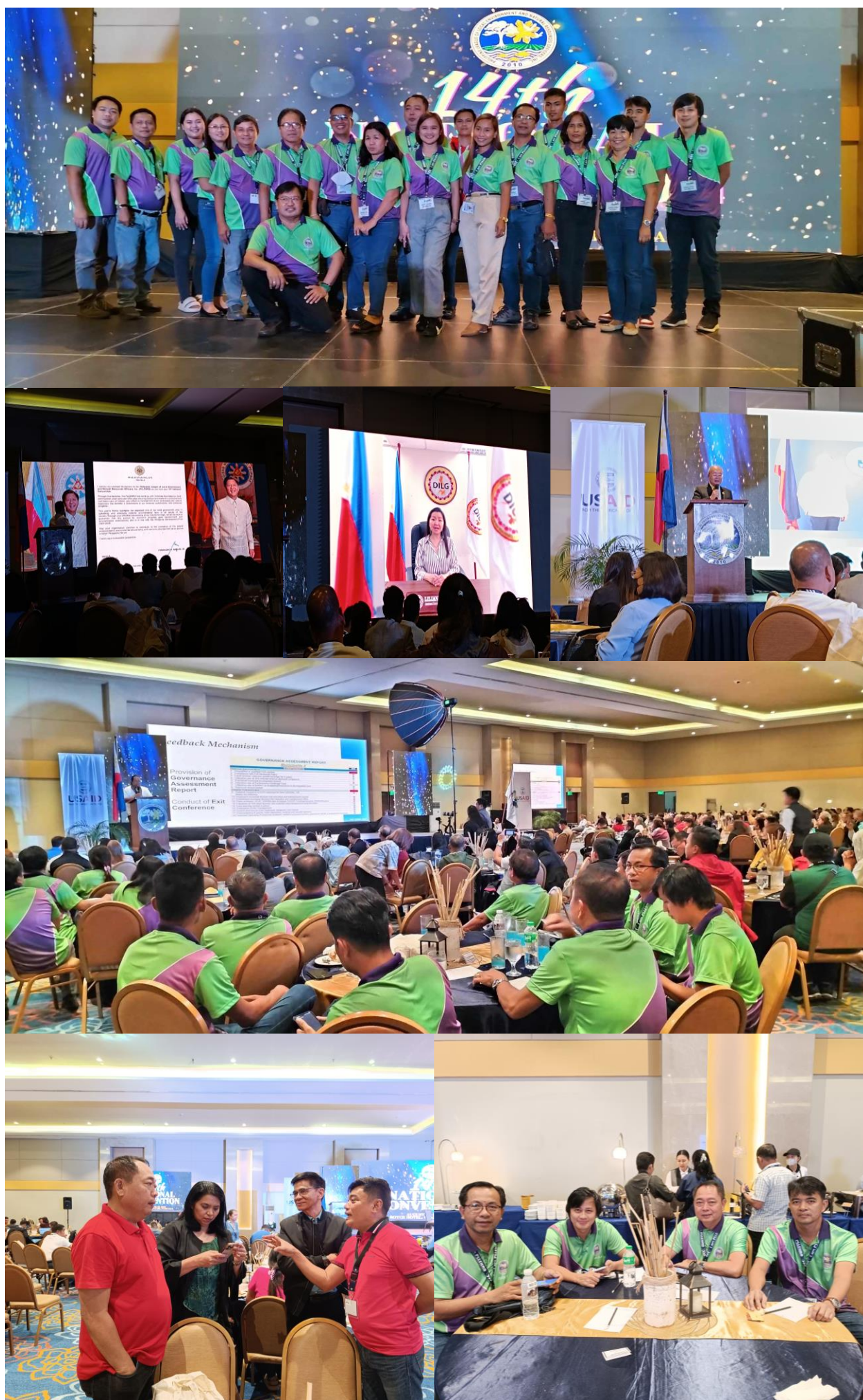
14th Philippine League of Local Environment and Natural Resources Officers (PLENRO) National Convention at Royce Hotel, Clark, Pampanga on August 16-18, 2023