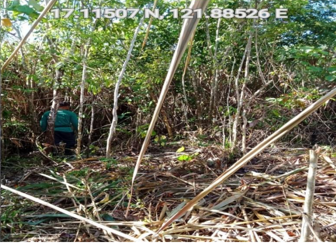
Some pictures taken during site preparation activities at IDRRIP, Disipon, City of Ilagan, Isabela on August 15-18, 2023.