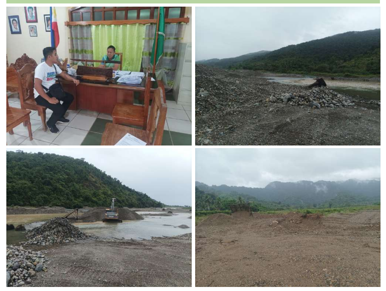
Some of the photos taken during the conduct of field inspection and investigation on the alleged quarrying activity at Barangays Planas and San Miguel, Ramon, Isabela.

Personnel of this Office also conducted site inspection of extraction areas at the Municipality of Dinapigue, where most of the extracted materials are utilized in the on-going infrastructure projects in the municipality implemented by various contractors.