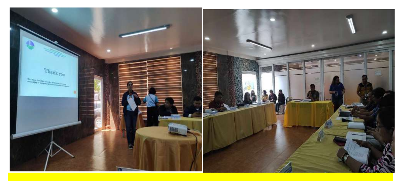
Water Quality Management Area (WQMA) Calao-Deliquente-Diadi (CDD) 1<sup>st</sup> Quarter Governing Board and Stakeholders Meeting on March 6, 2024 at Diositas Hotel, Santiago City, Isabela.