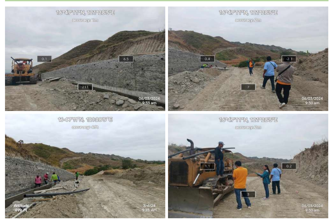
Area 1: The on-going construction of access road leading to the Rolling Hills, within Barangay Planas-San Miguel-Aguinaldo, Ramon, Isabela.