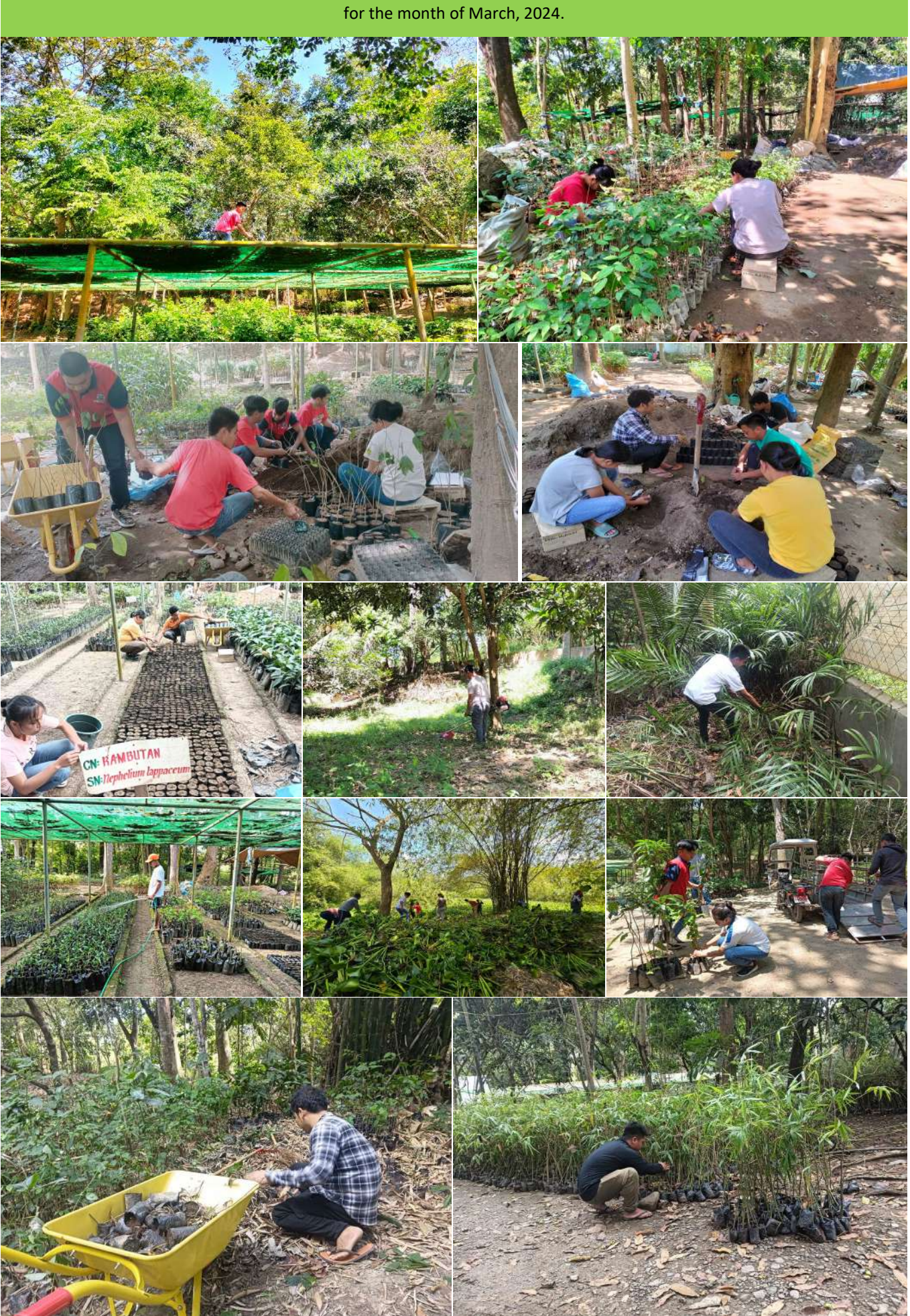
Pictures of Nursery Operation and Maintenance activities at the ENRO Provincial and Clonal Nursery