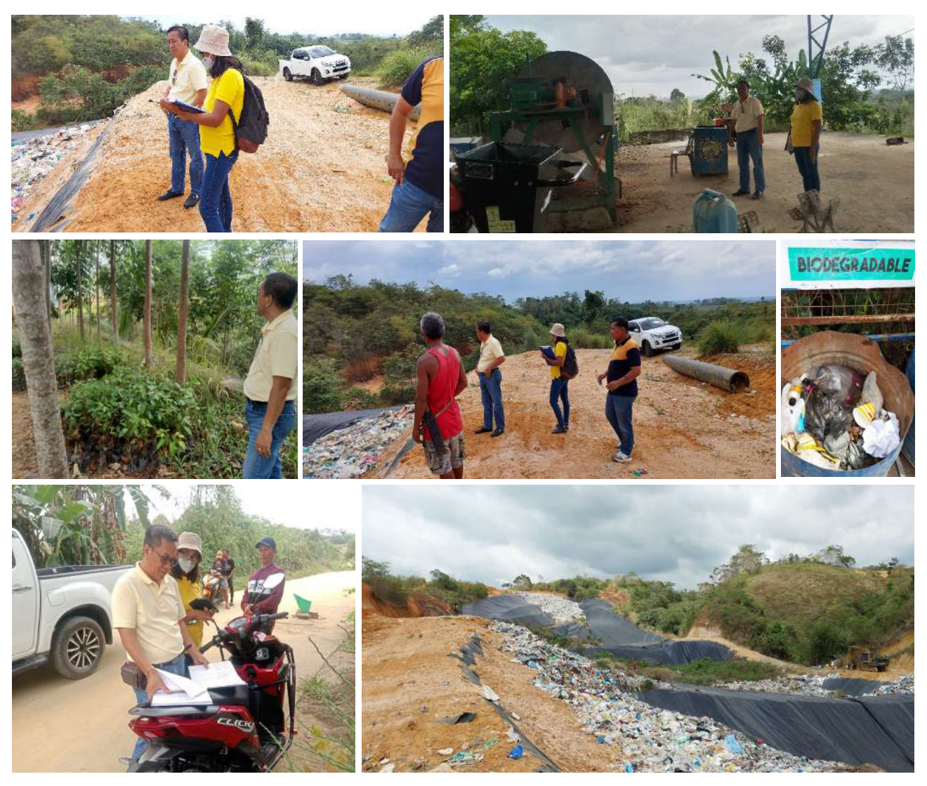
Sta. Catalina, City of Ilagan, Isabela Monitored and inspected on March 13, 2024