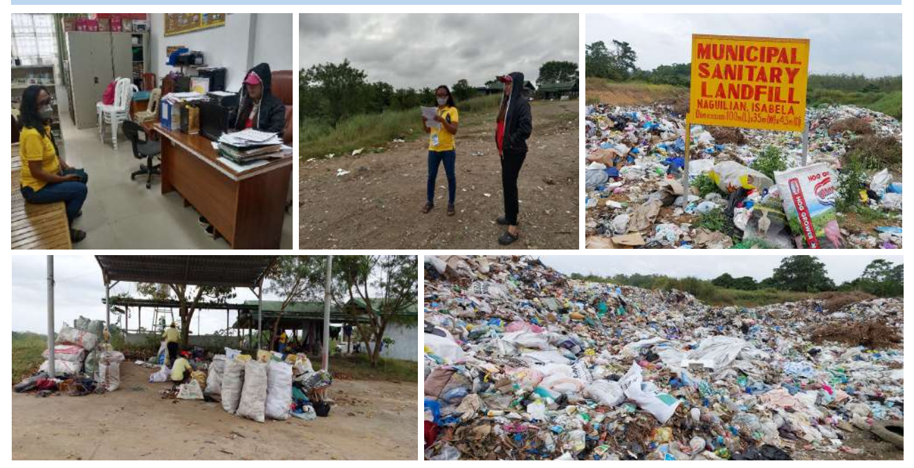
San Manuel, Naguilian, Isabela Monitored and inspected on March 13, 2024