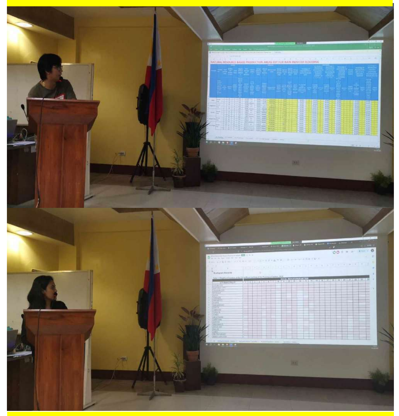
Training on Regional and Urban Physical Planning for the Updating of the Cagayan Valley Regional Physical Framework Plan at NEDA R02, Tuguegarao City, Cagayan on March 18-20, 2024