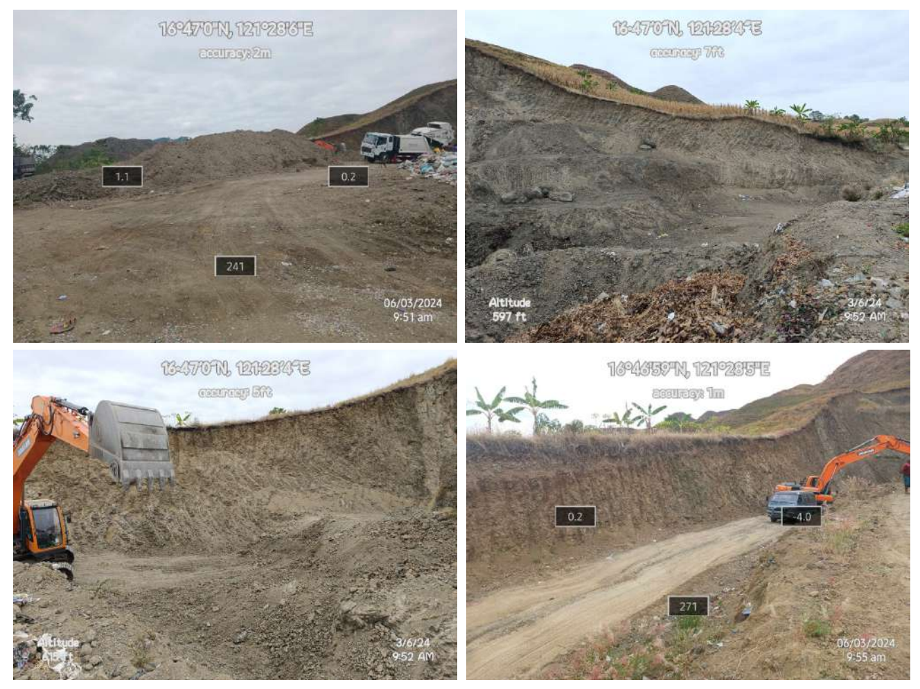
Area 2: Excavation of Cell 2 of the Sanitary Land Fill .