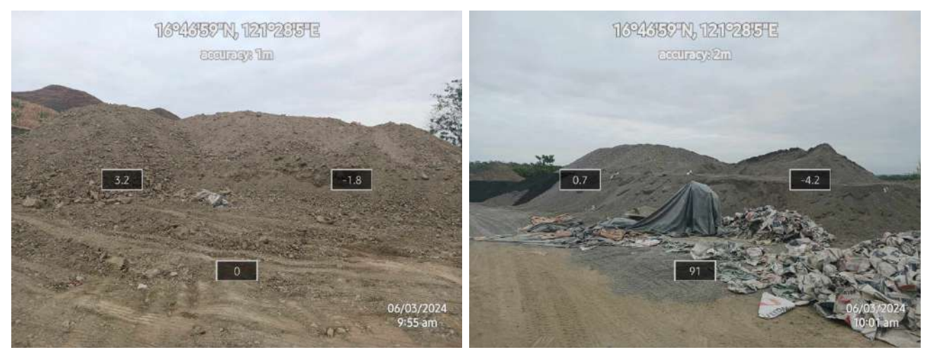
Area 3: First picture is the stockpile of earth extracted; second picture is the stockpile of DA Cadeliña Construction used in the road project.