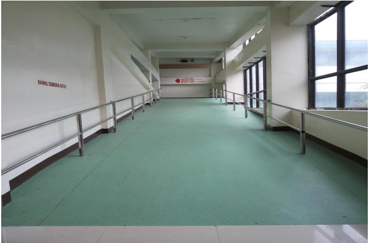
Installation of Anti-Bac Rubberize Ramp (Ground Floor – 4 th Floor)