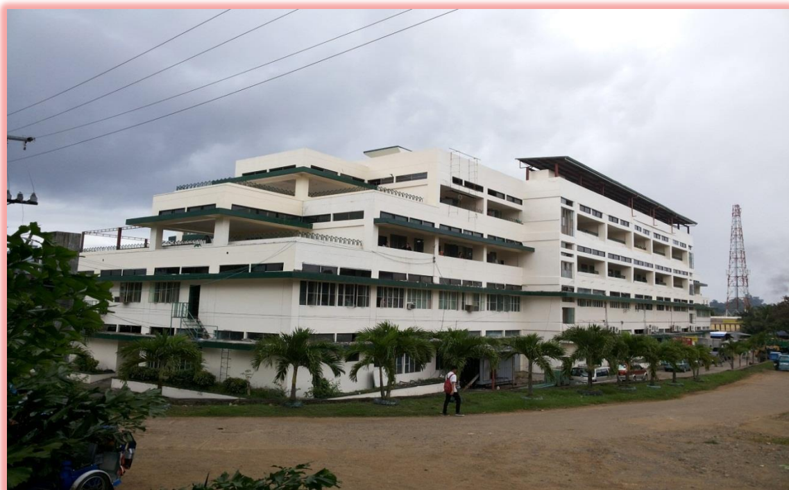
General repainting of Hospital building (inside and outside)