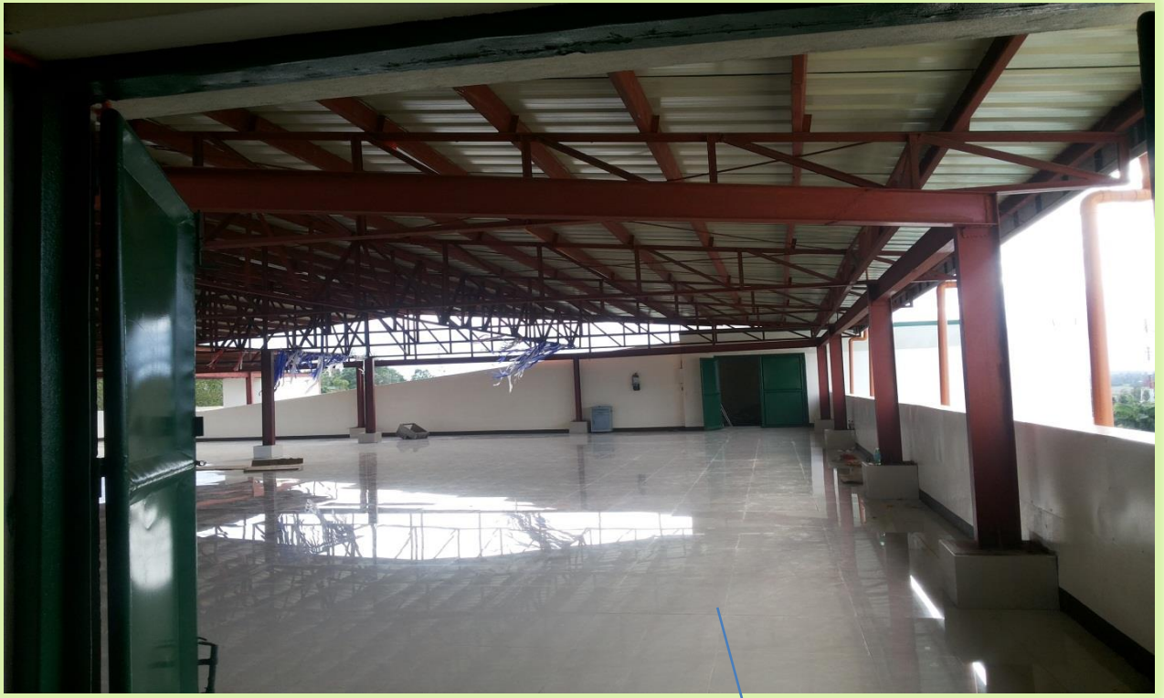
FUNCTION AREA (5 TH Floor)