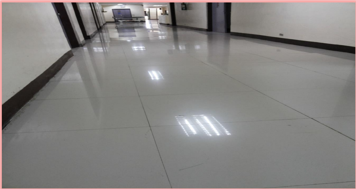
Retiling of wards and hallway (third and fourth)