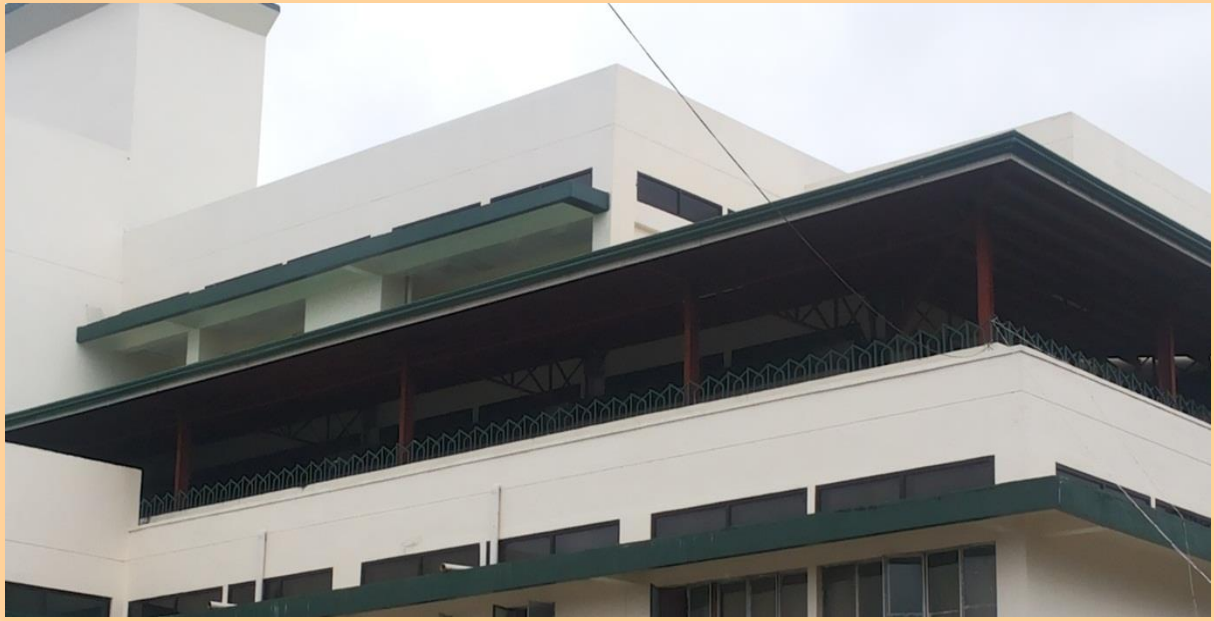
Construction of roof deck (3 RD Floor – Right wing)