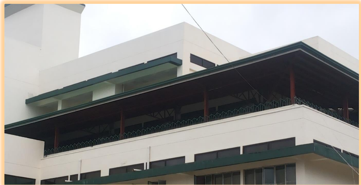
Construction of roof deck