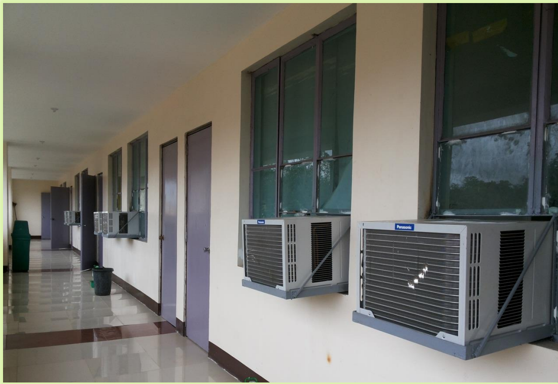
Installation of Airconditioning (3 rd Floor – Private Rooms)