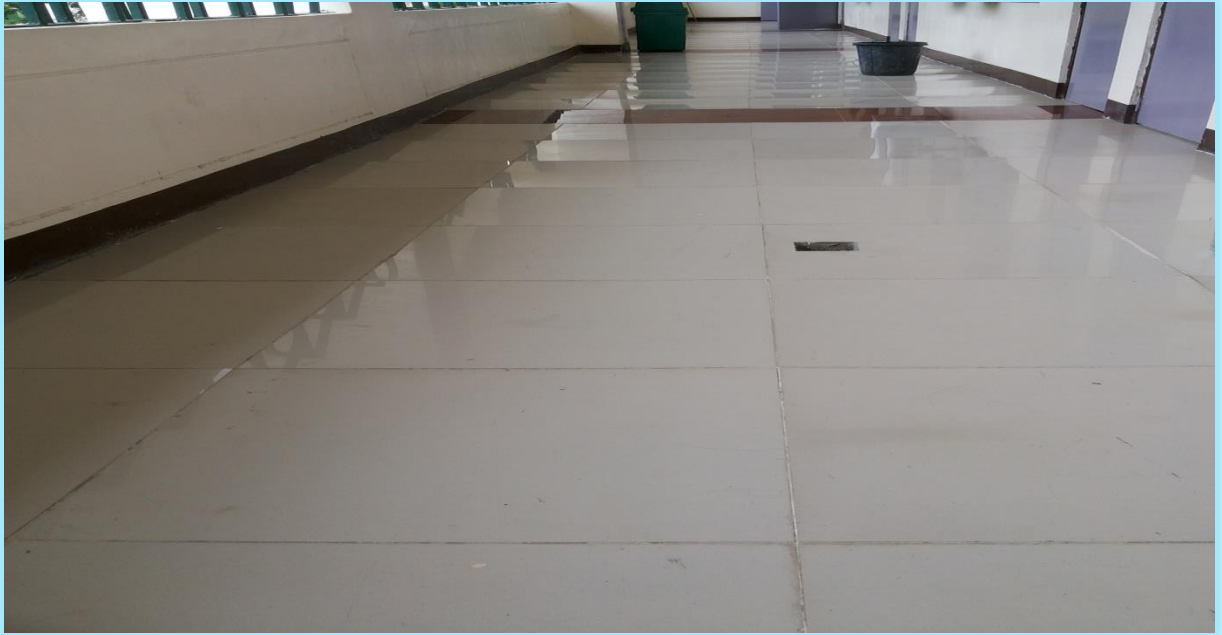
Retiling of wards and hallways (3 rd Floor)