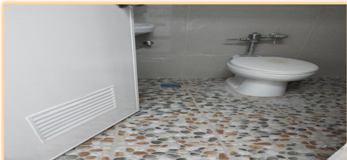
Repair of CR (third and fourth)