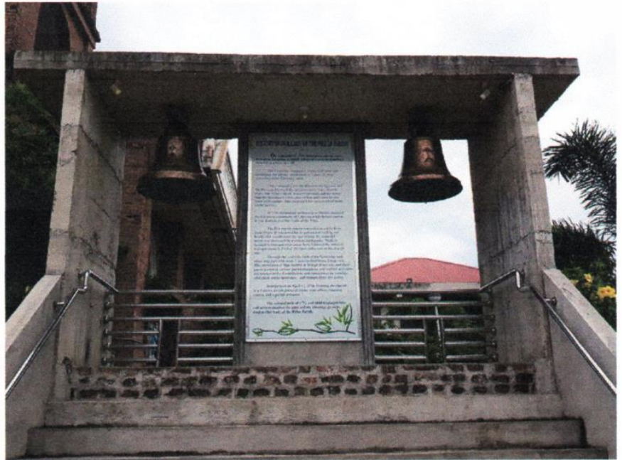
Isabela Tourism Office visited and documented the Spanish-era Roman Catholic Bells of the Nuestra Señora del Pilar Parish Church at Cauayan City, Isabela.