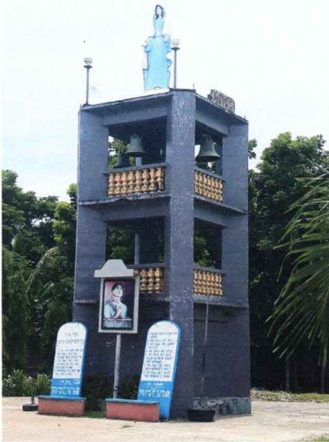
Isabela Tourism Office documented the Belfry of the Roman Catholic Church of Naguilian, Isabela.

isabelatourismoffice@gmail.com +63-906-166-4570 www.facebook.com/isabela.tourism