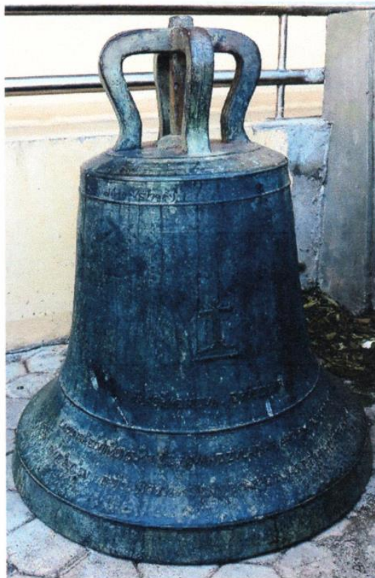
Isabela Tourism Office visited and documented the centuries-old Roman Catholic Bell of Santiago de Carig (c.1738) at Saint James the Apostle Parish, Santiago City.