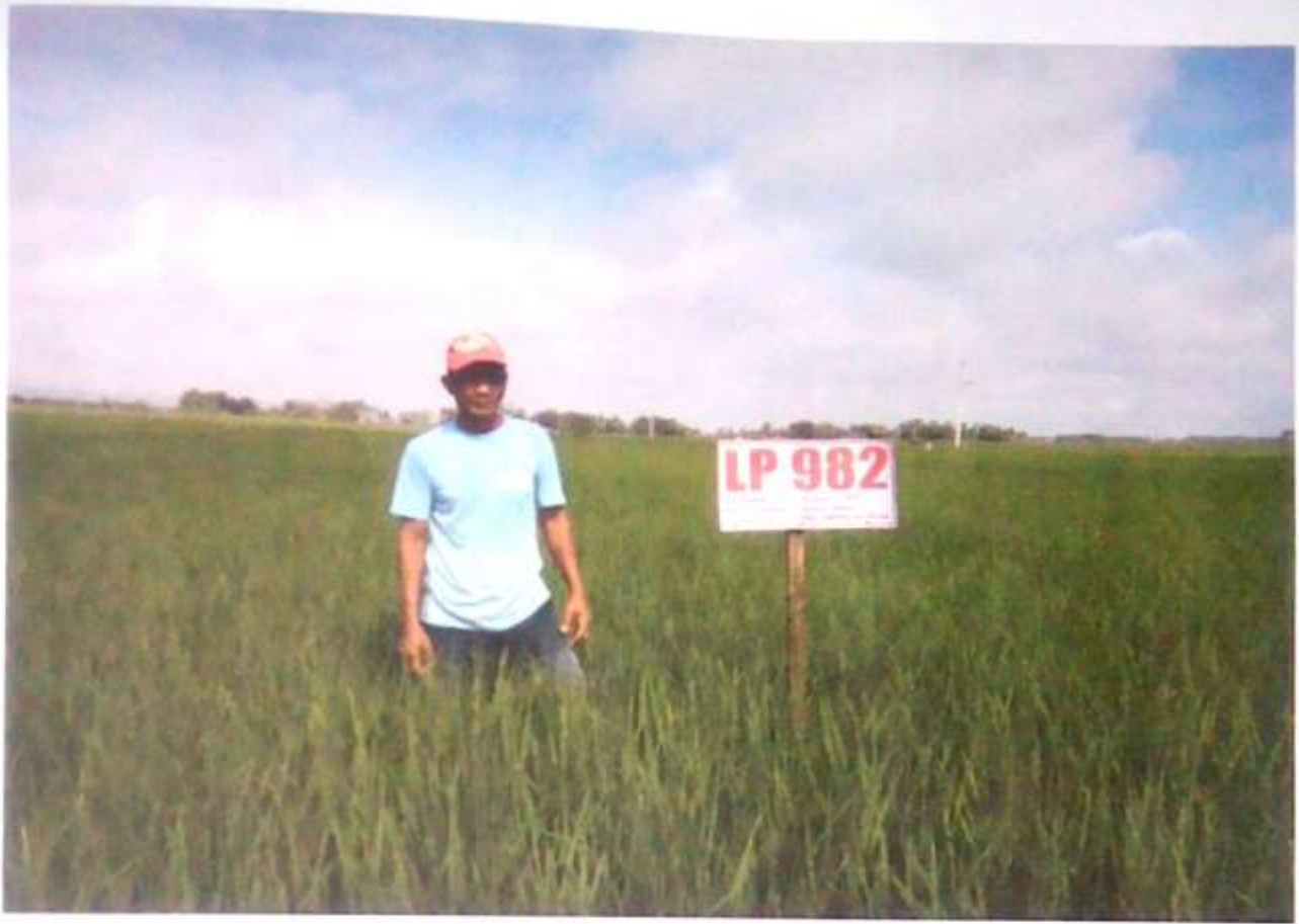
Chinese Hybrid Technology Demonstration Project established at Barangay Cabaritan, San Manuel, Isabela showing crop stand of different Chinese varieties