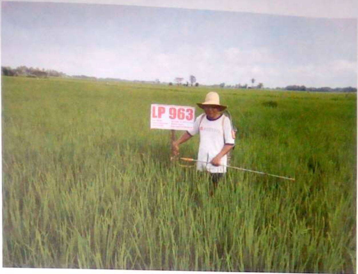
Chinese Hybrid Technology Demonstration Project established at Barangay Cabaritan, San Manuel, Isabela showing crop stand of different Chinese varieties