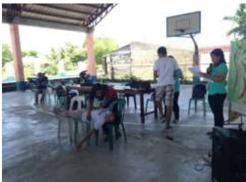
RHU staff presents a role-play on Safe Pregnancy and Delivery