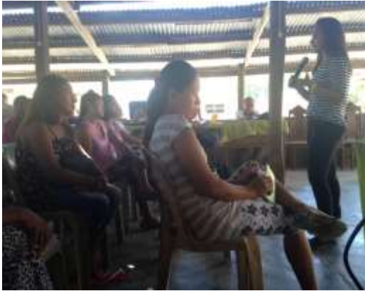
The Assistant MCH Coordinator of IPHO discusses the Maternal Health in Pregnancy