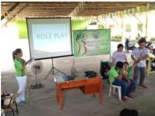
The health workers from RHU Tumauni during the role play on Safe Pregnancy and Facility-Based Delivery