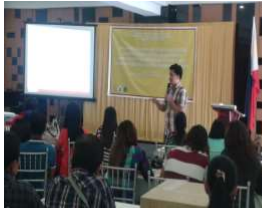
PSFI Logistic Officer asks the participants for their concern and expectation regarding Logistics Management Information System.