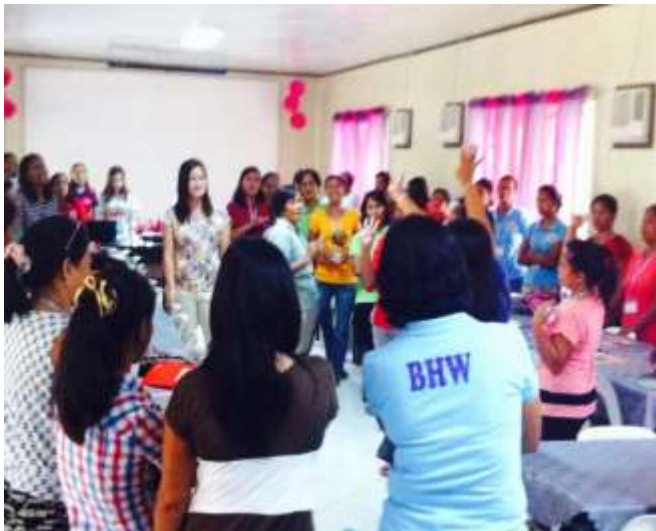
The Municipal Health Officer facilitates in the "getting to-know you" portion as some of the participants are newly hired.