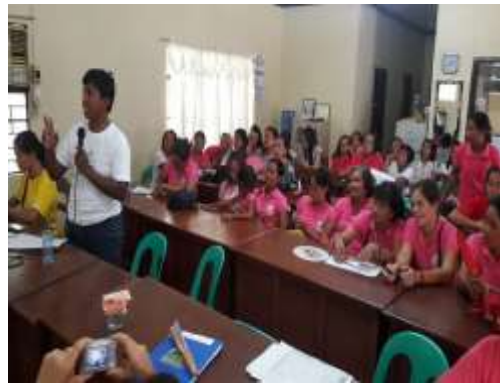
DOH RO2 DMO and Barangay Kagawad share their views on the identified problems of the barangay and the proposed solutions