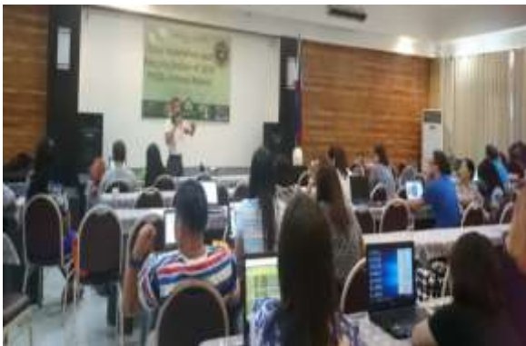
Senior Health Program Officer from EB discusses the new template of the Family Planning (FP)