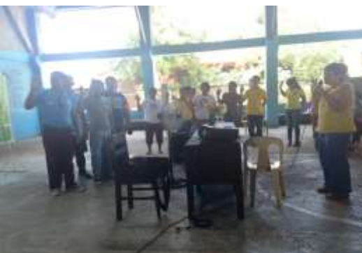
The Barangay Officials and Health Workers oath to protect for the welfare of pregnant women