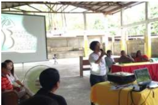
The MHO of RHU – Cabagan delivers her opening remarks to the participants