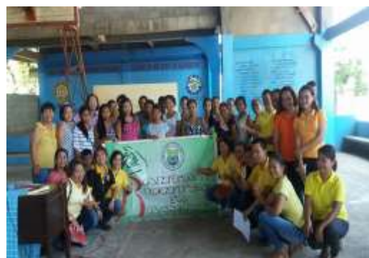
The Barangay leaders, together with the participants and Health workers from City Health Office Ilagan II and the team from the Provincial Health Office