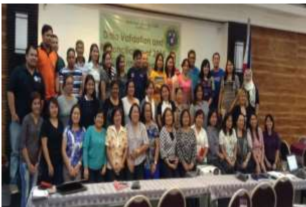
The participants pose cheerfully after completing the arduous validation and reconciliation activity.