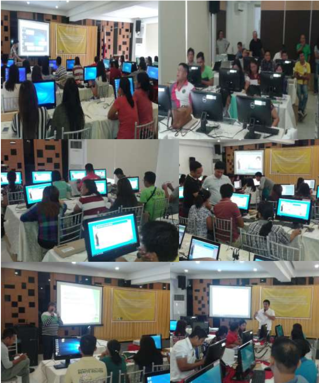
Participants practice on installed PhilMIS system on their computer units.