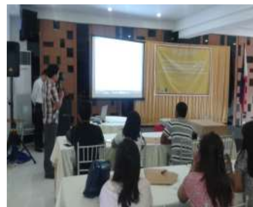
The malaria coordinator handles the preliminaries of the program