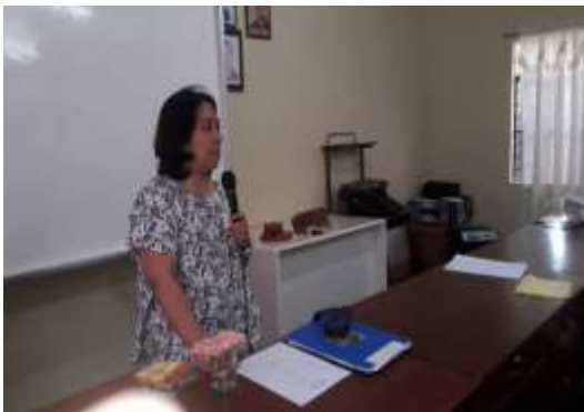
Municipal Officer of Gamu gives her inspirational message

The project's aims were to reduce maternal and newborn mortalities; to increase their involvement in the pregnancy tracking especially the teenagers; to emphasize the importance of early detection of danger signs among pregnant women; and to elicit commitment of LGU Officials including the Barangay Officials and Health Workers thru creation of policies, ordinances or resolutions.