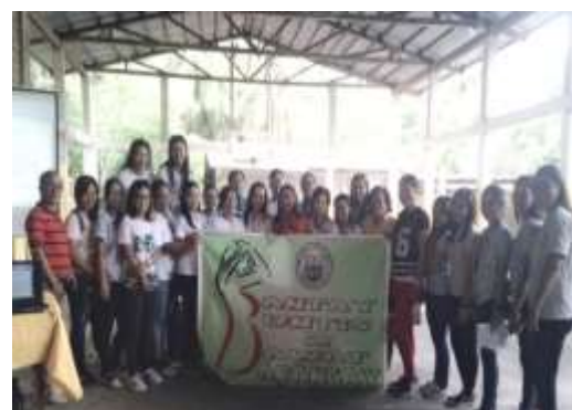
The Barangay leaders, RHU staff of Cabagan and the team from the Provincial Health Office