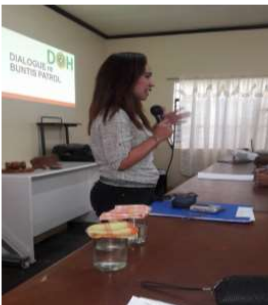
IPHO Alternate MNCHN Coordinator is one of the resource speakers on Buntis Patrol