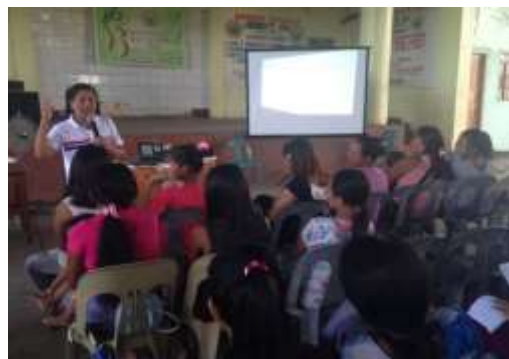
The Provincial AHYD coordinator discusses the rationale and objectives of the activity among the participants