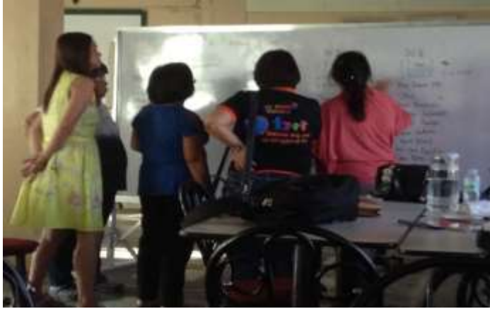
Creation of Provincial Technical Assistance LIPH Planning team per district