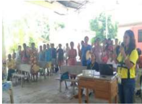
A representative from the DOH – RO2 takes the lead during the oath of barangay officials, barangay health workers and pregnant women at Barangay Holy Friday, Mallig, Isabela