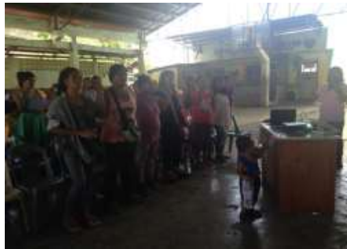
During the Oath for safe pregnancy and birth among the pregnant women and others who join the activity.