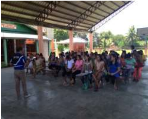
The Health Education & Promotion Officer (HEPO) discusses the rationale and objectives of the activity among the participants