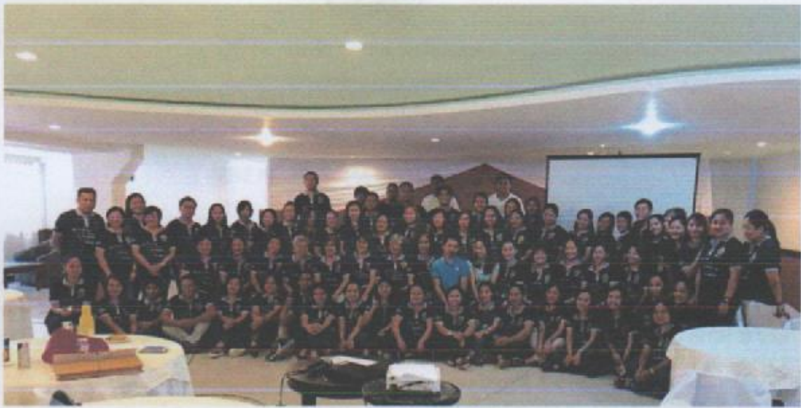
Isabela NTP Group

The group consisted of the TB Nurse Coordinator and Medical Technologist of the respective sites in the province of Isabela. Their records and reports were all assessed in terms of its completeness, accuracy and consistency whereas there were still minor discrepancies in terms of data collection, contrary to what is written in the NTP Manual of Procedures. In addition, the group was also updated on their status with regards to the implementation of Integrated Tuberculosis Information Management System (ITIMS) on recording and reporting were also given as well as clarification of some issues encountered by different sites in the management of their TB cases.