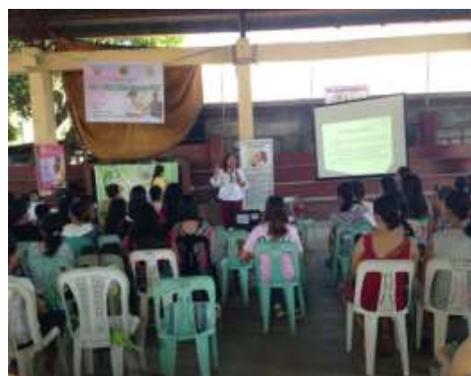
The Provincial MCH coordinator discusses the Maternal Health in pregnancy to the participants