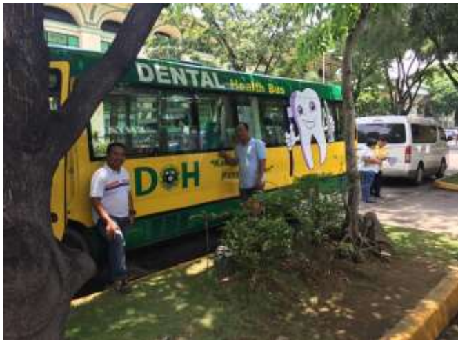
The assigned drivers pose behind the Provincial Dental Health Bus .