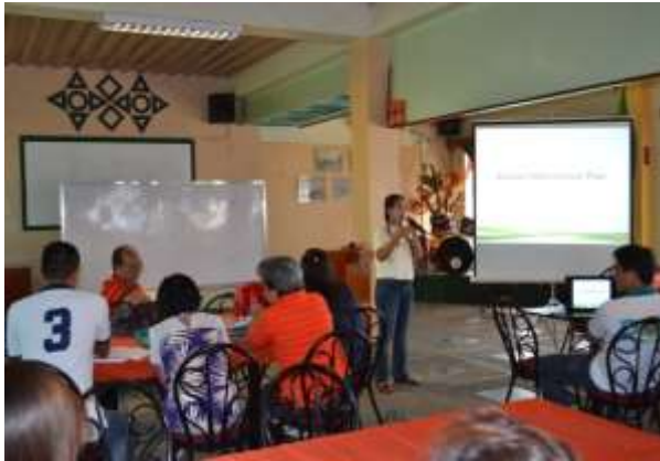
PDOH DMO presents the Annual Operational Plan to the hospital groups.