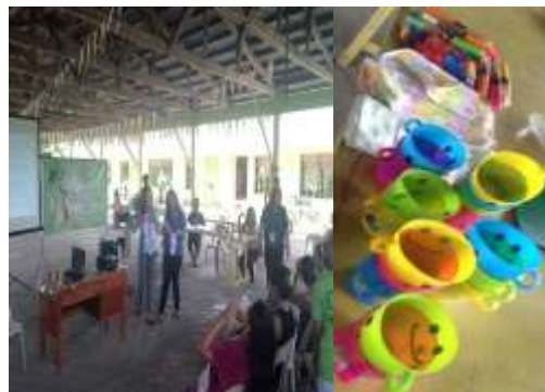
The Assistant MCH and FP Coordinators during the Q&A portion where prizes are given to the participants