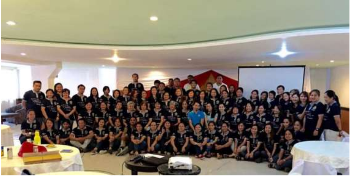
Isabela NTP Group