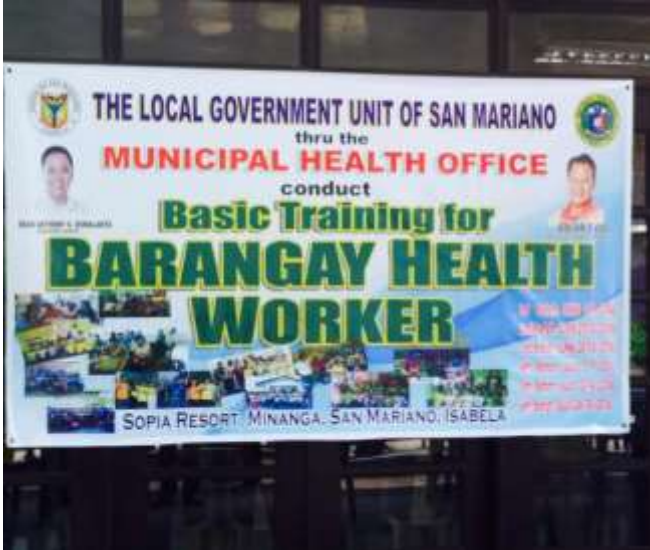
The tarpaulin of the training shows schedule for the next batches of BHW training.