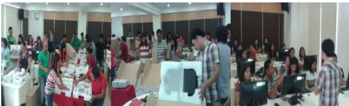
Synchronize opening and booting-up of work stations by All Rural Health Units (RHU) and City Health Offices (CHO).