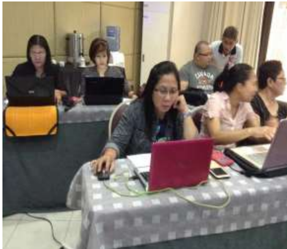
The FHSIS coordinators keenly verifies every details of the FHSIS annual report of the different regions and provinces