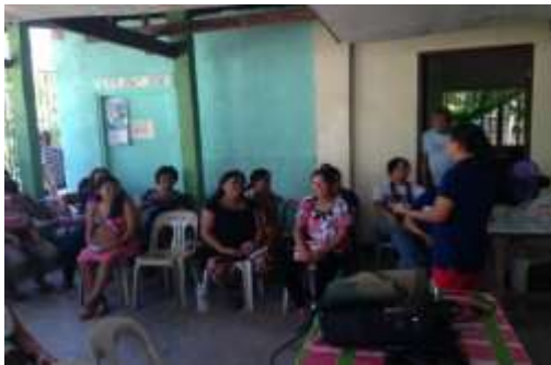
The participants actively listen to the lectures from the Provincial AHYD coordinator on the Rationale and Objectives among the participants