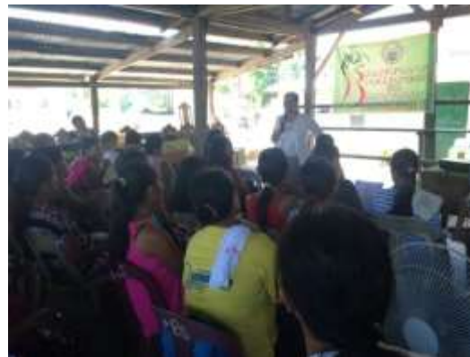
The Provincial AHYD coordinator discusses the rationale and objectives of the activity among the participants