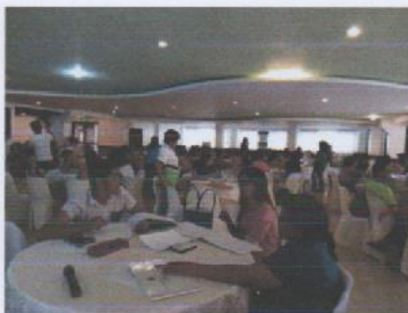
During the records and reports validation workshop