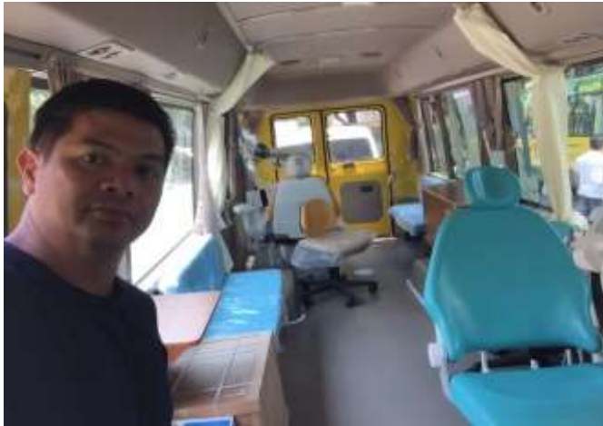
The interior of the Dental Health Bus shows its state-of-the-art dental equipments.