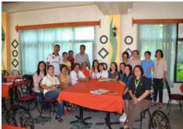
The provincially- maintained hospital administrative officers together with the PDOH and PHO Doctors ham it up for the camera after the LIPH Orientation.