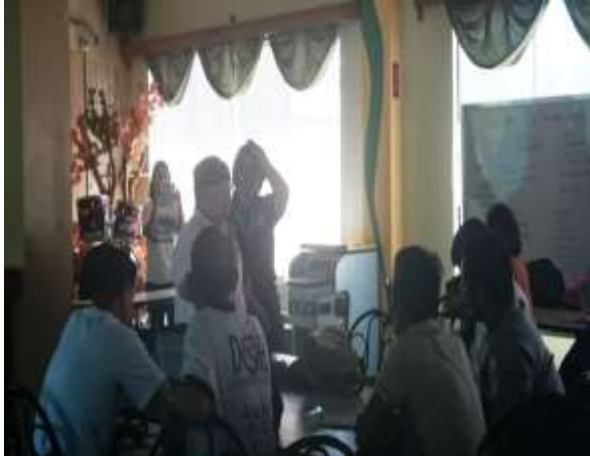
The Provincial Health Officer II delivers her inputs during the open forum