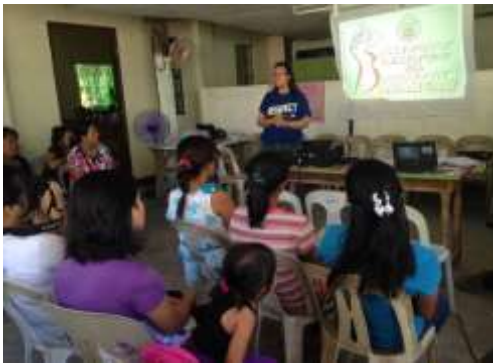
The MHO of RHU – Cordon delivers her opening remarks to the participants