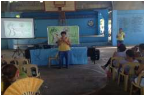
The CHO of RHU Ilagan II delivers her opening remarks to the participants