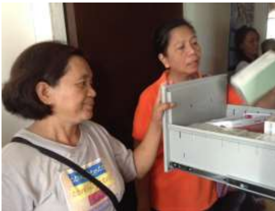
PHO staff inspects supplies and medicine storage.