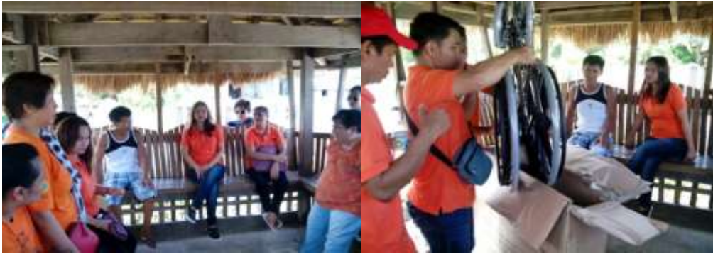
First stop is the courtesy call to the Vice Mayor of the Municipality with the Municipal Health Officer in the absence of the Municipal Mayor. The IPHO team gave 10 wheelchairs, 30 vials of Rabies Vaccine, emergency kits and chlorine.