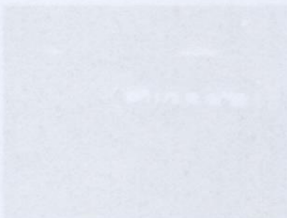
During the records and reports validation workshop