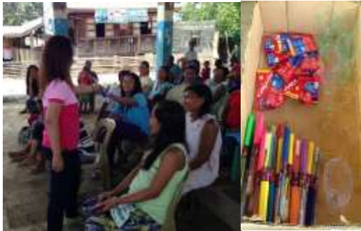
The Assistant MCH Coordinator during the Q&A portion where prizes are given to the participants