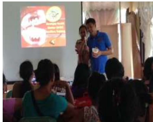
Dentist II for the Oral Health Program elicits laughter from the participants as he performs the proper way of tooth brushing, with the help of a Day Care worker.