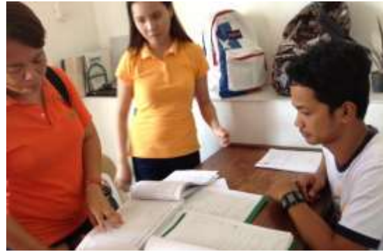
The MHO and staff accommodate the IPHO team for the validation of their records and reports, data quality checks and cold chain management.