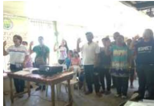
The BHW coordinator takes the lead during the oath of barangay officials, and health workers at Barangay Malapat, Cordon, Isabela