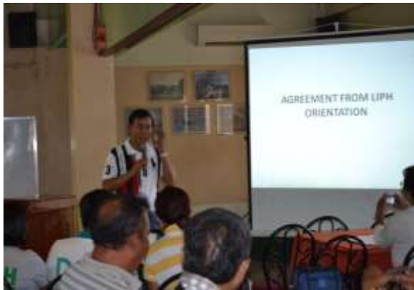
The Isabela Health Care chief discusses on agreements from the LIPH Orientation.