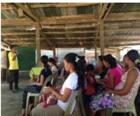
The Barangay Captain gives his opening message to everyone