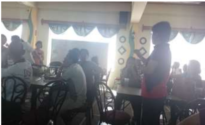
One of the PHO team of doctors clarifies her concerns in filling-up the LIPH templates