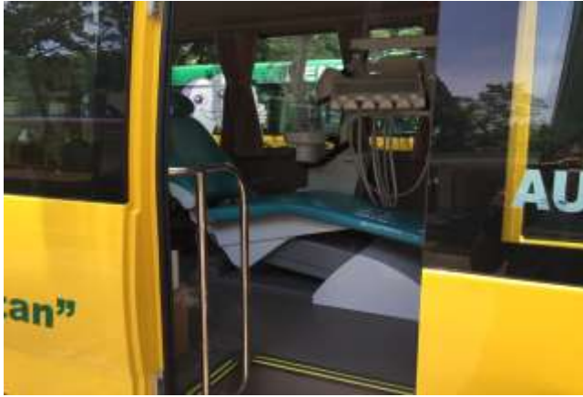
The air-conditioned Dental Health Bus opens automatically and is fully equipped.