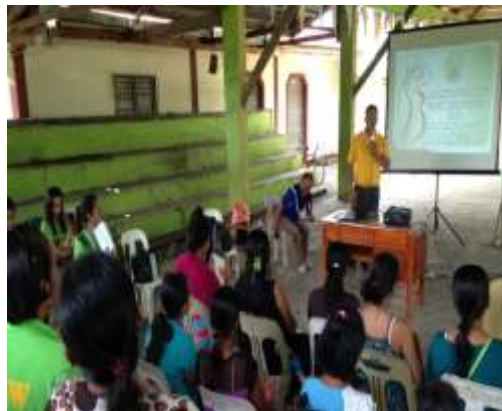
The Barangay Captain gives his opening message to everyone