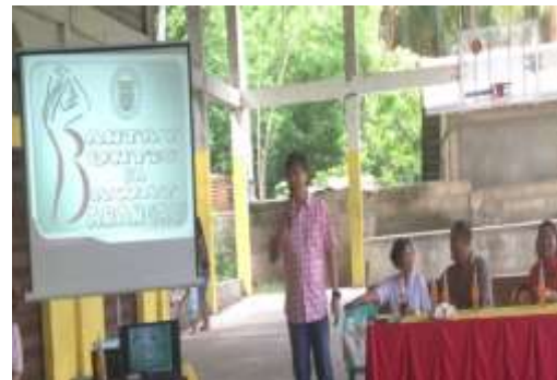
The Municipal Mayor of Cabagan gives his opening message to everyone