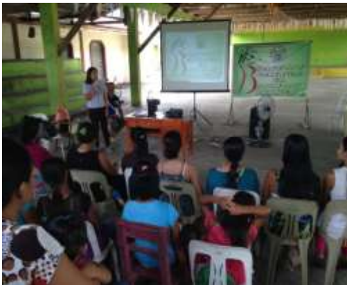
The Doctor to the Barrio (DTTB) gives her opening remarks to the participants