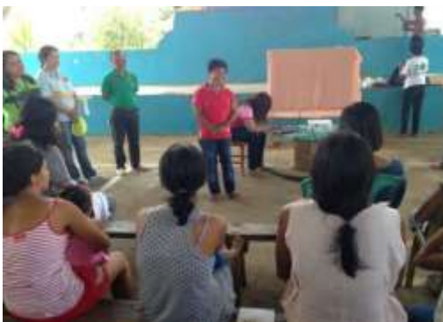
The Barangay Captain of Minanga, San Pablo gives her opening message to everyone