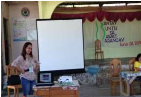
The Assistant MCH Coordinator of IPHO discusses the Maternal Health in Pregnancy