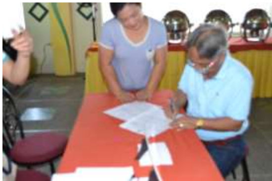
One of the Chief of Hospitals registers on the LIPH orientation for the hospital group.