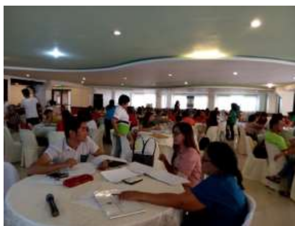
During the records and reports validation workshop