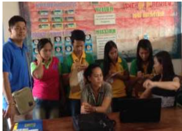
PHO 1 teaches the RHU staff on the proper management and administration of Rabies Vaccine.