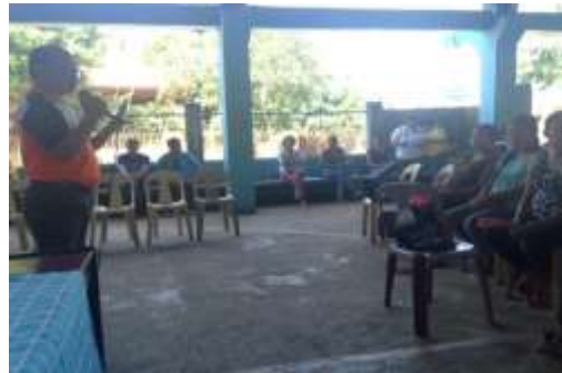
The Health Education & Promotion Officer (HEPO) discusses the rationale and objectives of the activity among the participants