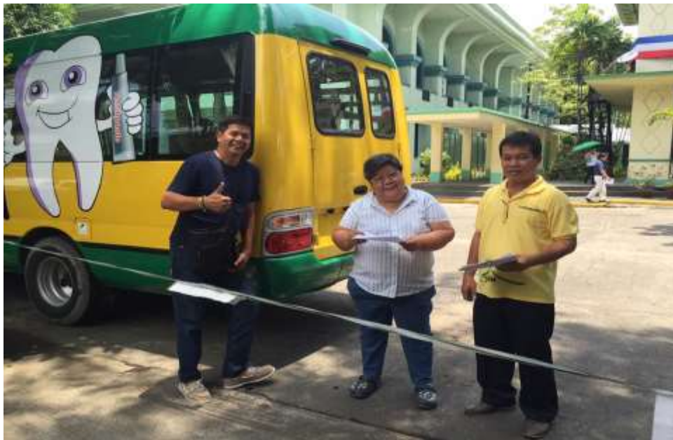
The Provincial Health Officer II and the Dentist II show to the world the Dental Health Bus for Isabela after the awarding.

The bus will be managed by the Provincial Health Office and will greatly augment the services to be delivered by the Isabela provincial government’s dental outreach program.