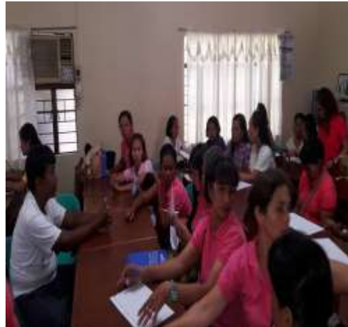
IPHO coordinator gives technical assistance to the barangay officials and barangay health workers in accomplishing their action plans