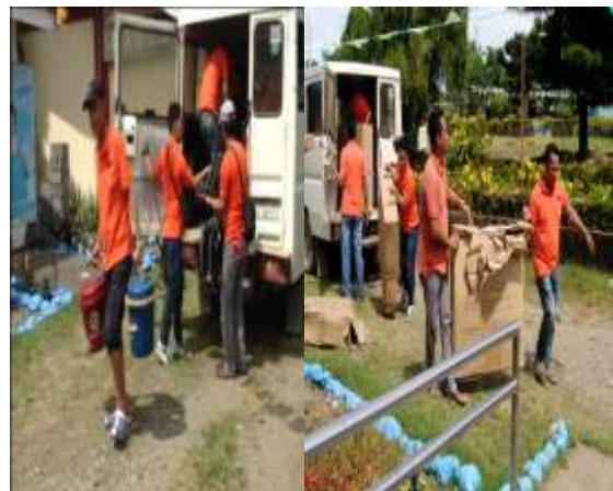
The IPHO team visits the RHU of Dinapigue and delivers the wheelchairs, Rabies vaccine, emergency kits and Chlorine coming from the national and provincial government.