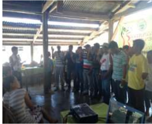
The Barangay Officials and Health Workers oath to protect for the welfare of pregnant women