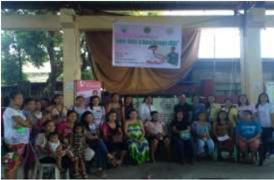
The Barangay leaders, together with the participants and health workers from City Health Office of Cauayan 1 and the team from the Provincial Health Office