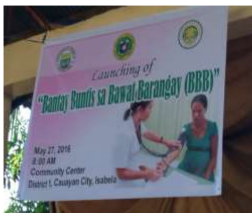
Launching of Barangay Buntis sa Bawat Barangay at District 1, Cauayan City, Isabela