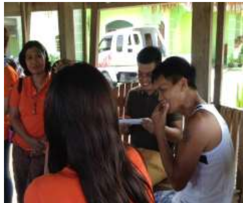
PHO staff gives the health commodities from DOH and PGI to Dinapigui Vice- Mayor and MHO