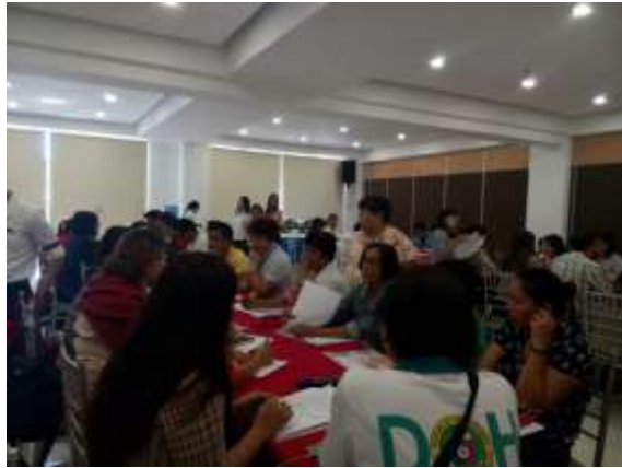
Workshop on the formulation of 1 year operational plan