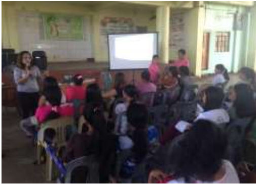
The Assistant MCH Coordinator of IPHO discusses the Maternal Health in Pregnancy.