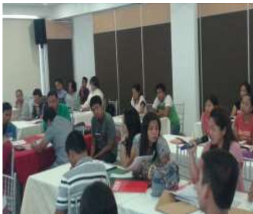
Open forum ensues after the PhilMIS orientation