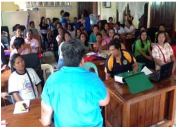
PHO II extends her warmest message to all the participants.