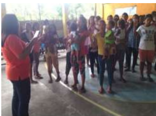
The MCH coordinator takes the lead during the Oath for safe pregnancy and birth among the pregnant women at Cabagan, Isabela