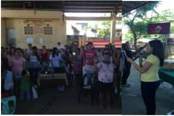
The Assistant FP coordinator takes the lead during the Oath for safe pregnancy and birth among the pregnant women and others who participates for the said activity.