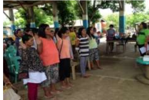
During the oath of pregnant women on safe pregnancy and birth lead by MCH coordinator