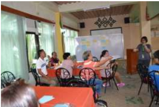
The administrative officers of the provincially maintained hospital asks question on the LIPH process