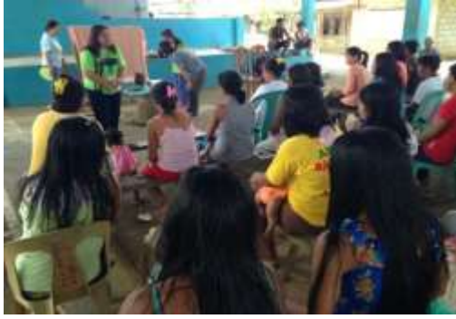
The Provincial MCH coordinator discusses the situationer on Maternal Death of the Province of Isabela