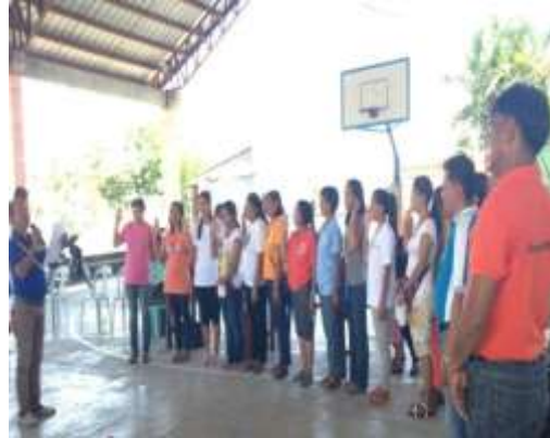
The Barangay Officials and Health Workers oath to protect the welfare of pregnant women