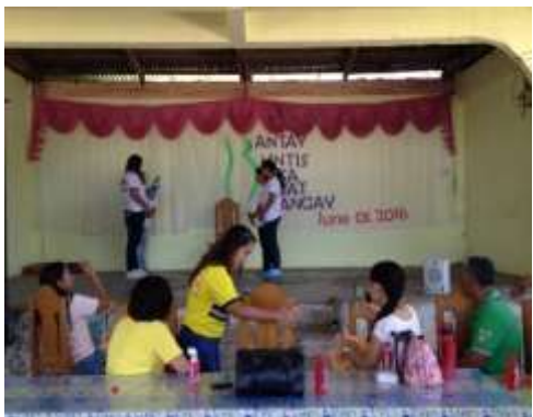
The health workers from RHU Mallig during the role play on Safe Pregnancy and Facility-Based Delivery