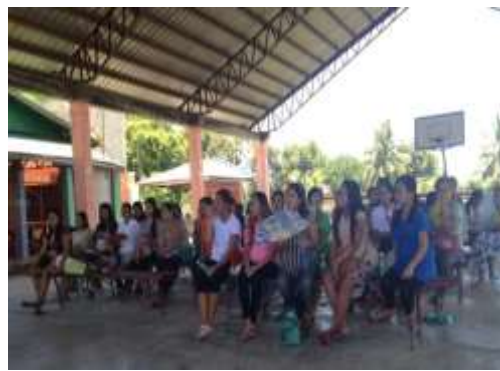
The participants actively listen to the lectures from the Assistant MCH coordinator on Maternal Health in Pregnancy