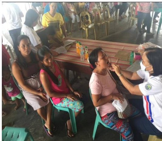
The Provincial Dentist performs oral examination as part of quality Maternal Care