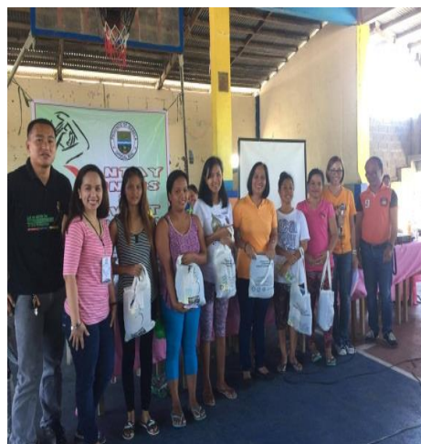
The participants receive BUNTIS PACKAGE from the Movement Against Malaria (MAM)