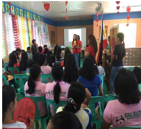
During the Q&A portion where prizes were given to the participants