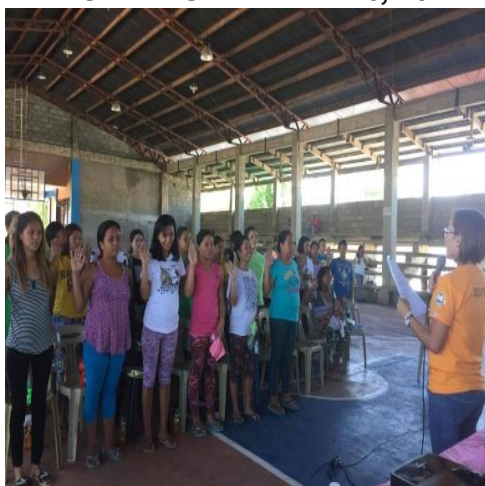
The Municipal Health Officer takes the lead during the Oath for Safe Motherhood among Pregnant Women in La Paz, Cabatuan, Isabela