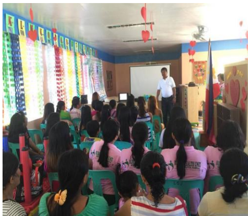
The Municipal Mayor delivers his opening message to everyone