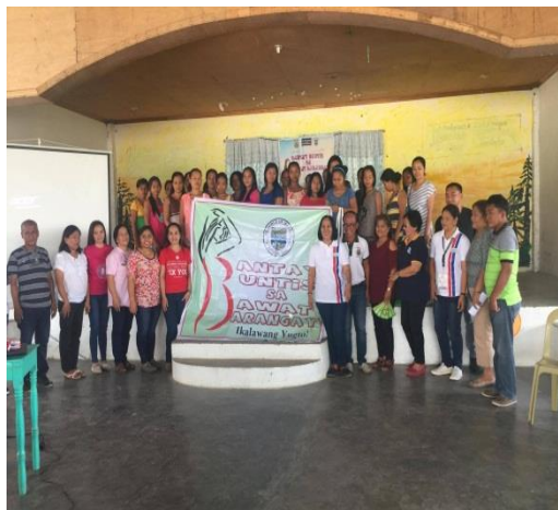
Group picture of the Barangay leaders, together with the participants and Health workers from RHU Quirino and the team from the Provincial Health Office