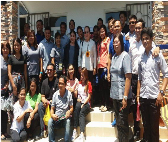
Doing the “DUTERTE” move and a snapshot with the whole workforce of the Treatment and Rehabilitation Center.