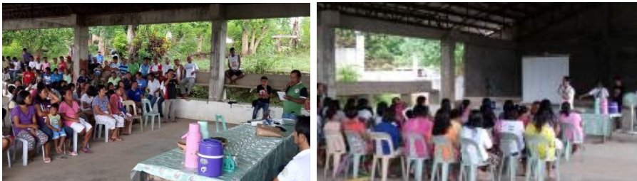
The Barangay Captain acknowledges the participants visitors coming from the provincial government and gives his inspirational message.