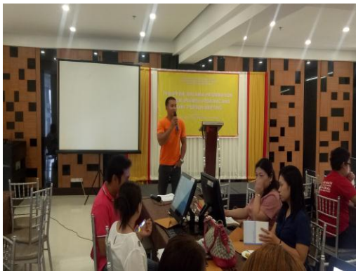
The Malaria Project Officer discusses about the status of malaria in the Province.