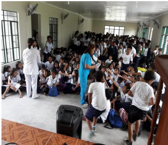
Health workers from San Manuel RHU lead in the dissemination of information about dengue fever among high school students