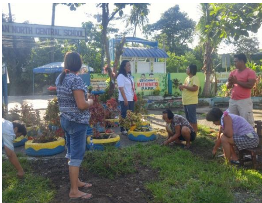
Ilagan North Central School- “Operation Linis” by parents and teachers

As to logistics, different methods were employed in preventing mosquitoes that might carry dengue virus such as the use of Sumilarv, K-O Tab, Victor/Abate while proper use of such were demonstrated among teachers prior to distribution. Aside from monitoring, the group was also invited to have information dissemination and advocacy among the parents and teachers and community Associations during one of the schools’ first PTCA meeting.