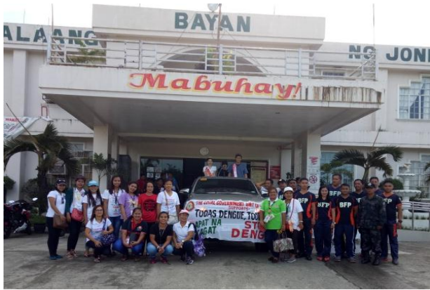
The Municipality of Jones conducts inter-agency motorcade as one of their advocacies on how to prevent Dengue.