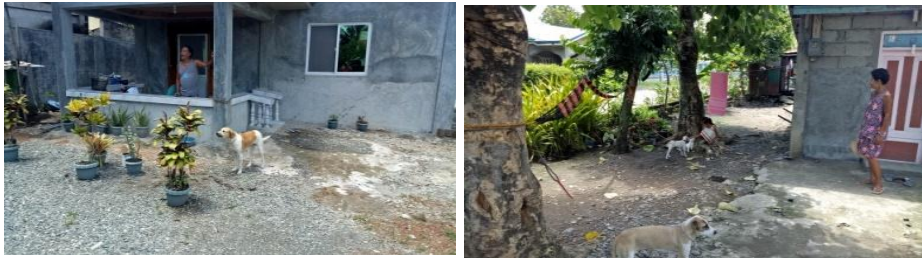
Some residents of Brgy. Buneg, Echague show their willingness to tie their dogs in support to the “Responsible Pet Ownership” embodied in EO # 2.