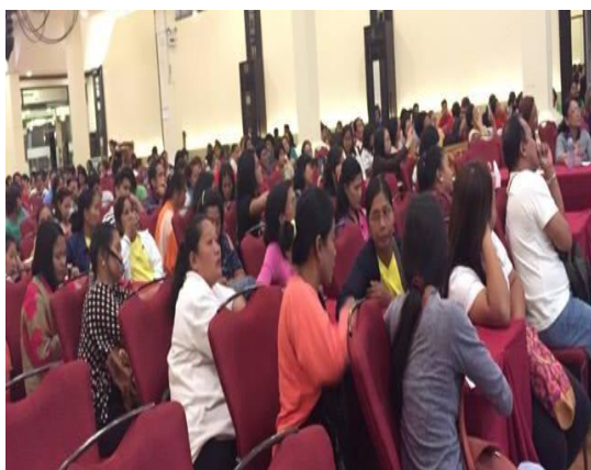
Delegates from the 4 provinces and cities actively listen to all the speakers for the best practices of the different provinces present.