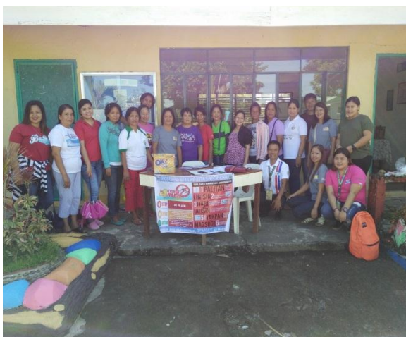
RHU staff before their kick off activities on Dengue Monitoring at Delfin Albano.