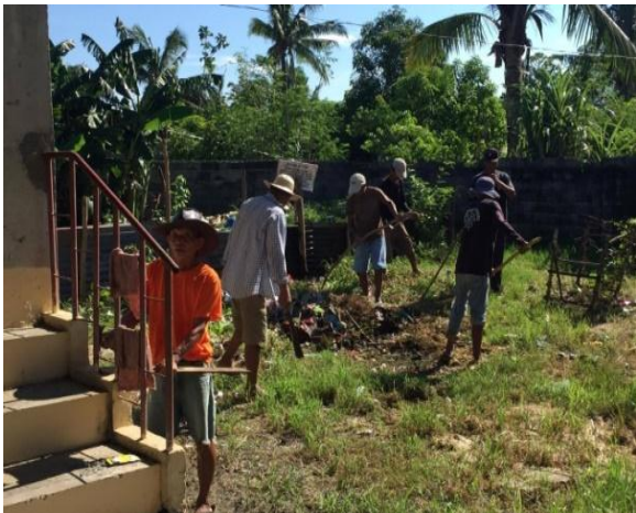
The barangay captain of Barangay Furao, Gamu, Isabela together with his constituents joins the “TODAS DENGUE TODO NA TO, IKAAPAT NA KAGAT”