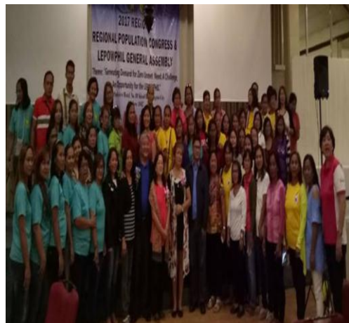
The Isabela LEPOWPhil delegates pose with POPCOM Officers of Region 2