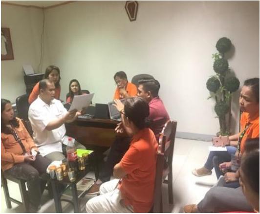
The External Auditors share their findings and recommendations during the Exit Meeting with all personnel.