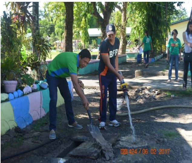
The Bureau of Fire Protection flushes out school drainages with the supervision of their Municipal Mayor.