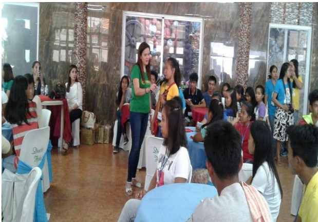
A participant shares her view on a Situationer on teenage pregnancy/young adult fertility and sexuality.