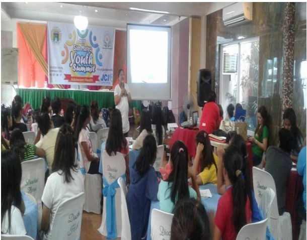
The provincial program coordinator provides session on STI -HIV AIDS to San Mateo high school students