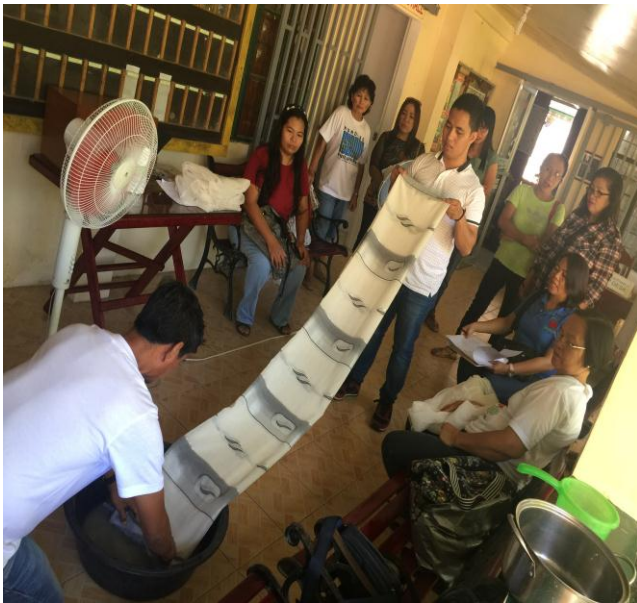
Teachers of San Mateo South Central School observes the soaking of curtains with K-O tab by the IPHO Dengue monitoring team members