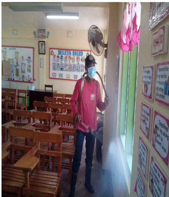
The Sanitation Inspector of Alicia performs indoor and outdoor spraying of classrooms in Alicia.