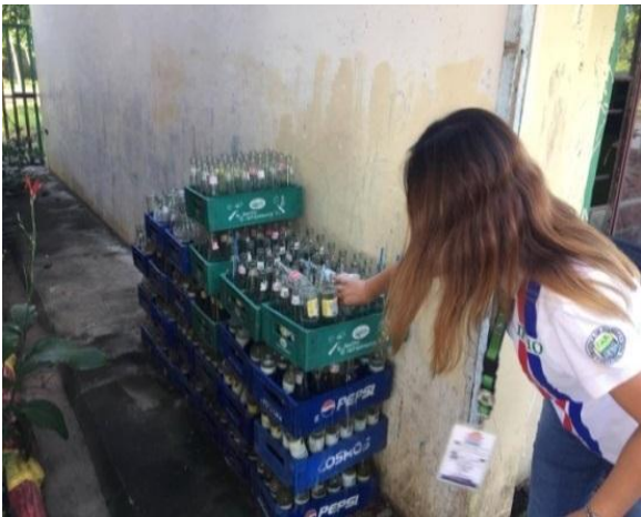
The Provincial Health Officer I demonstrates the proper way to store empty bottles.