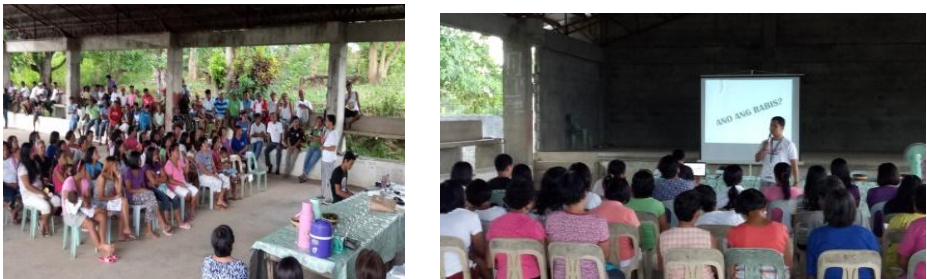
The Assistant Provincial Rabies Coordinator shares about rabies disease affecting the human body and its immediate management .