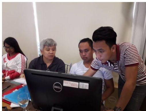
Provincial PhilMIS Point Person updates workstation of encoders from RHU Alicia.