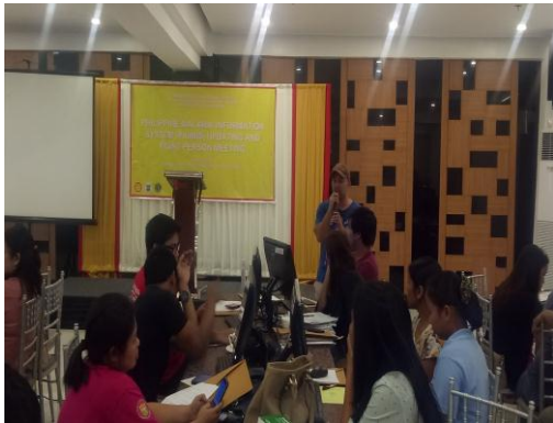
LMIS coordinator from DOH-Central Office discusses updates on system.