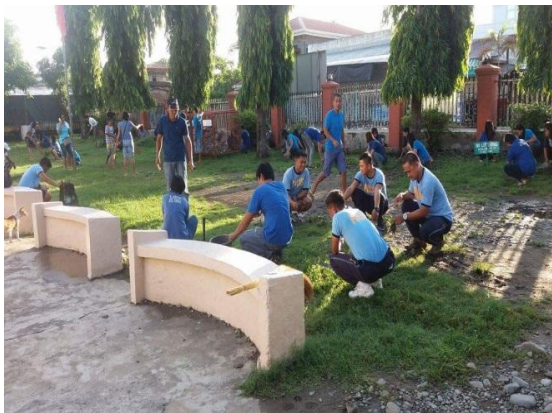
The Municipal Administrator, Municipal Employees together with the PNP and BFP of Sto. Tomas, Isabela participate in the" Operation Linis" during the implementation of Todas Dengue Todo Na 'to Ika-apat na Kagat.