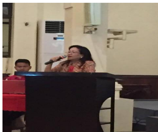
The POPCOM III Regional Director talks about the involvement of special population groups( older persons, Indigenous people in the Philippine population Management program)