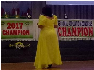
LEPOWPHIL Got talent: Singing sensation, Dancing Duo, cheers and yells draw a big Wow among entertained delegates