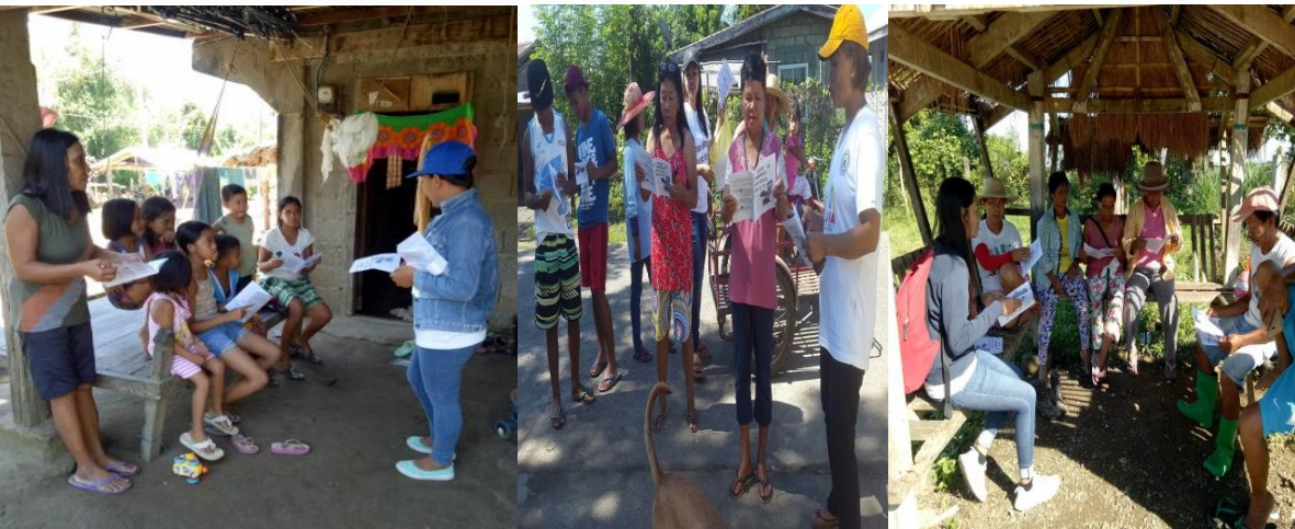
RHU Staff leads in the dissemination of information about dengue fever in the different barangays of Quirino and San Mariano.