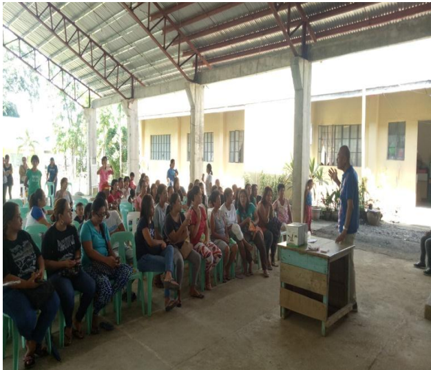
A technical staff from IPHO discusses Information Dissemination regarding Dengue awareness on parents and teachers.