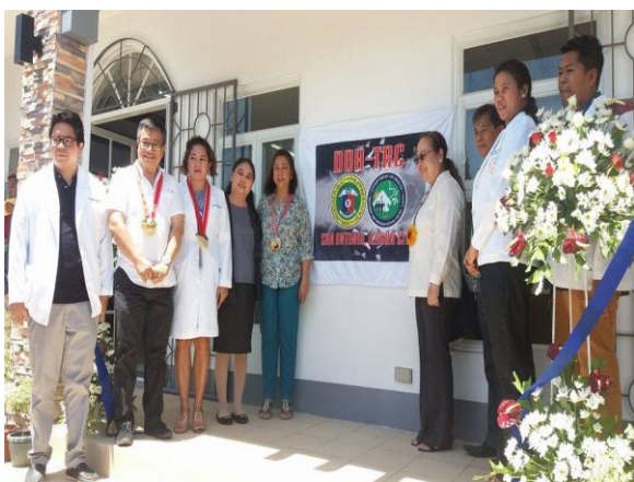
A souvenir shot of the Bigwigs after the ribbon-cutting ceremony