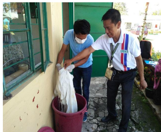
IPHO Dengue Coordinator demonstrates soaking of curtain with Larvicide.