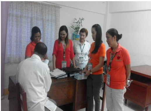
The persons in charge answer the External Auditor regarding Warehouse & Stock Management Process