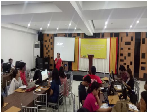
PESU Coordinator from IPHO gives her warm welcome to the participants

The 2-day meeting was conducted to refresh and update PhilMIS encoders on the new trends of entering reports in their workstation and also to conduct a one-on-one hands on orientation on the new PhilMIS system.