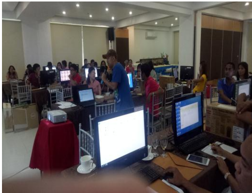
Actual installation of updated PhilMIS software in the workstation of participants.