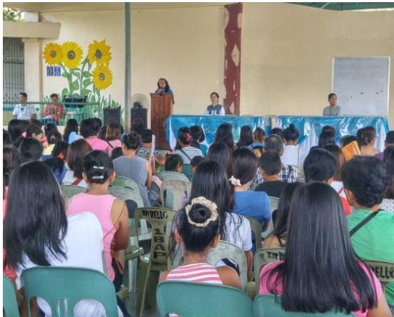
Ilagan South Central School- Rural Health Physician from IPHO gives information dissemination Dengue during PTCA meeting