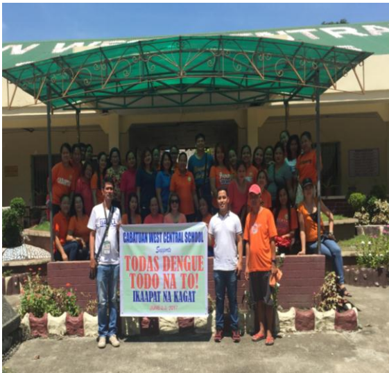
After the installation of treated mosquito nets and information dissemination on Dengue to PTCA's, the Dengue Monitoring team of District 3, together with the teaching staff of Cabatuan West Central School and some RHU staff hams it up for the camera.