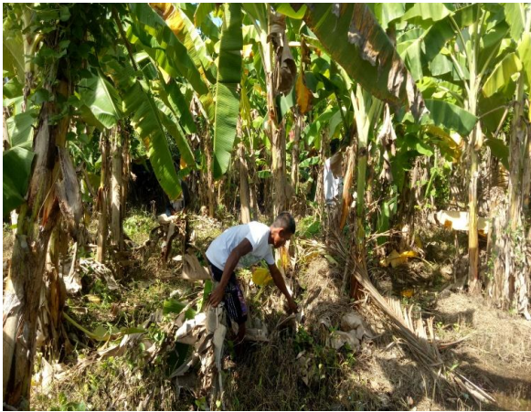
Destroying of possible breeding site of Dengue carrying mosquitoes in San Isidro