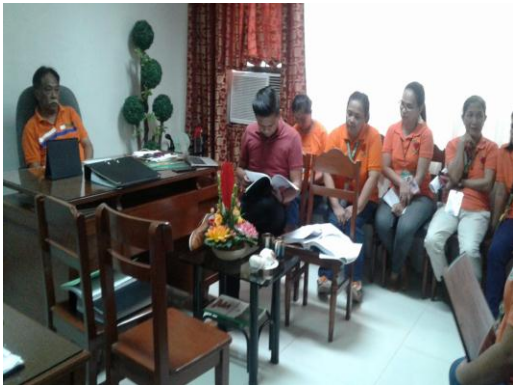
OIC-PHOII and all program coordinators look on as the External Auditor scrutinize documents from the Dengue program.