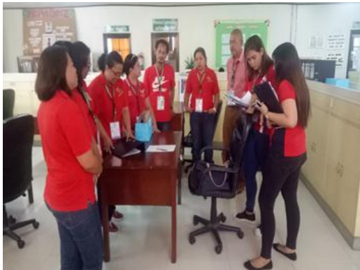
All program coordinators listen as findings and recommendations were given by the internal auditors on the Conduct of Training.