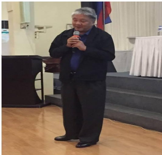
Oathtaking of New Set of Officers and Turn-over ceremonies of Region 2 LEPOWPhil.