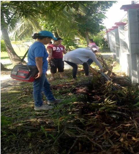
A staff from Echague Rural Health Unit together with the IPHO staff direct Stream Clearing operation and application of Larvicide on clogged canals along their office premises