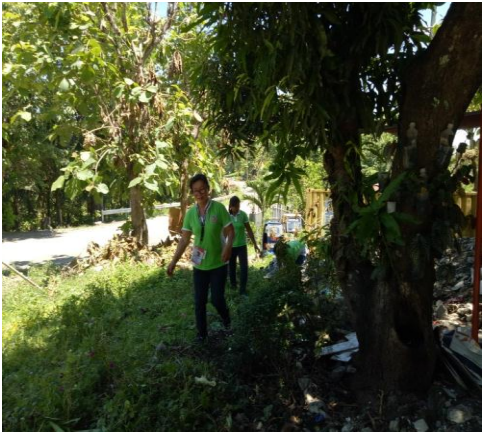
Taken at Prospero G. Bello Integrated Community Hospital where as staff conducts Search and Destroy of possible breeding sites in their premises.