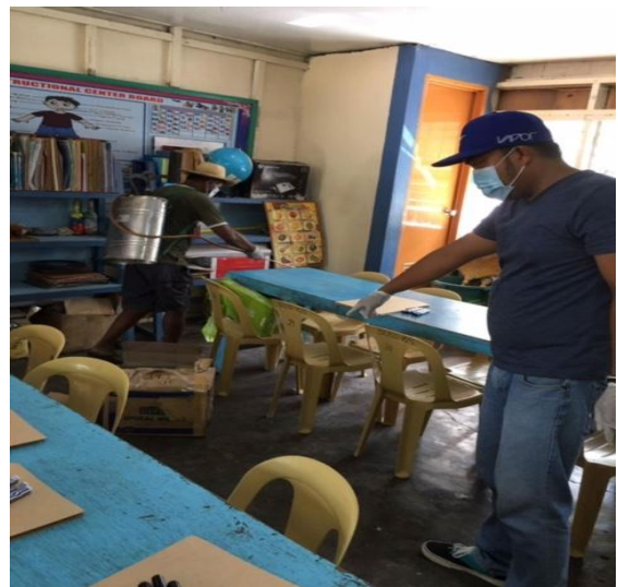
Actual Indoor and outdoor spraying in classrooms of the different schools in Reina Mercedes