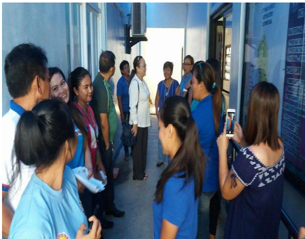
The DOH sec. and entourage pays a quick visit to the CHO2 of the City of Ilagan.