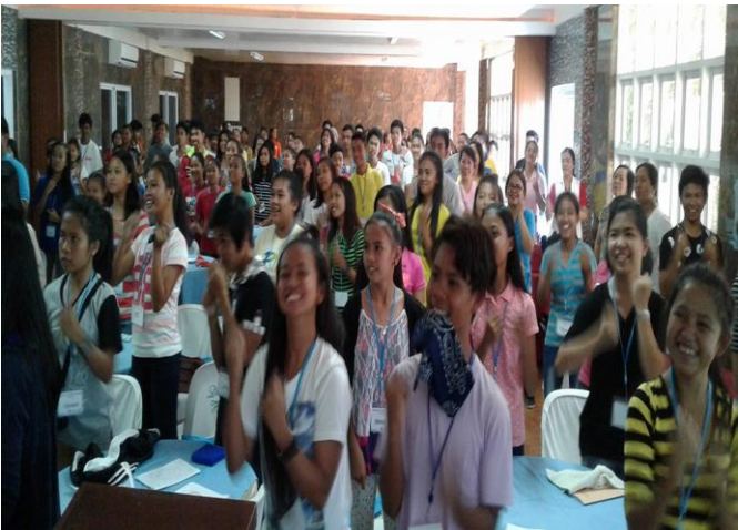
The students wholeheartedly participate in the spiritual enrichment session and icebreaker.