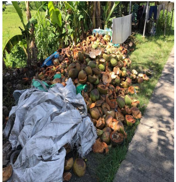
The Dengue monitoring team reminds the Buko juice selling establishments along Cabatuan to turn over used coconut shells to prevent breeding places for mosquitoes