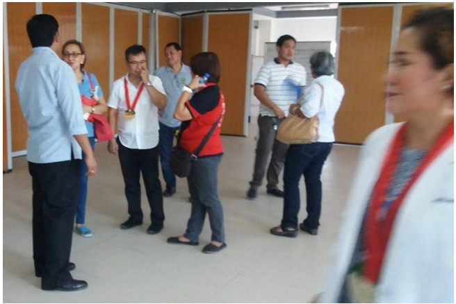
The RHO2 PDOH personnel converses with the DOH bigwigs at the lobby of the facility.