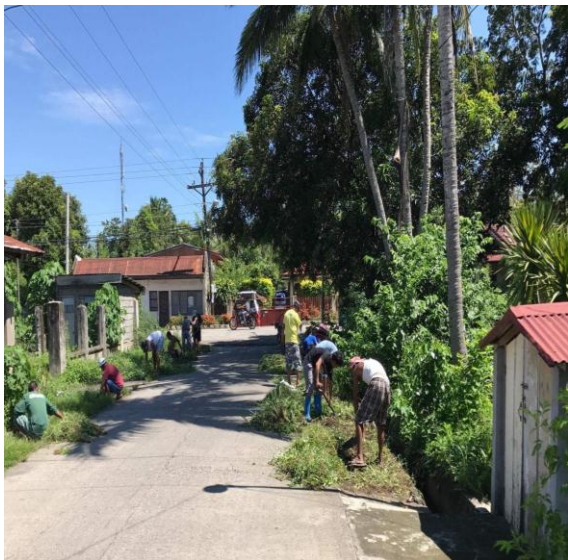
The community actively perform clearing operations in major canals in the streets of Angadanan.