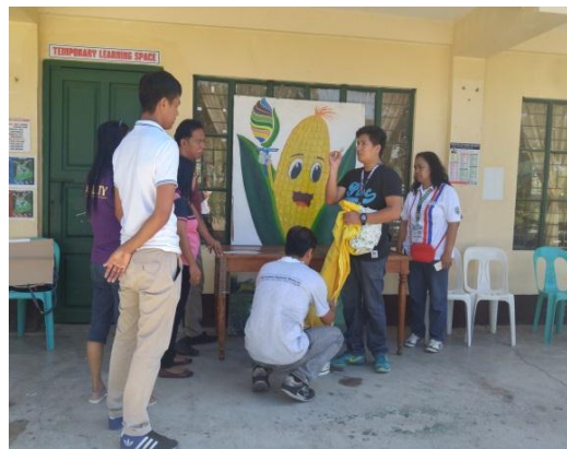
Ilagan West Central School- CHO I of the City of Ilagan staff lectures on curtain soaking with K-O tab.