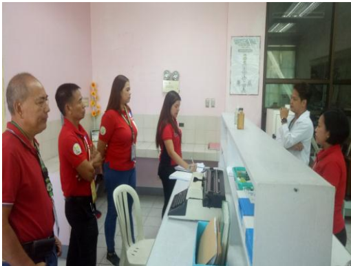
The auditors pay a quick yet intensive visit to the Water Laboratory to evaluate conformity of its processes.