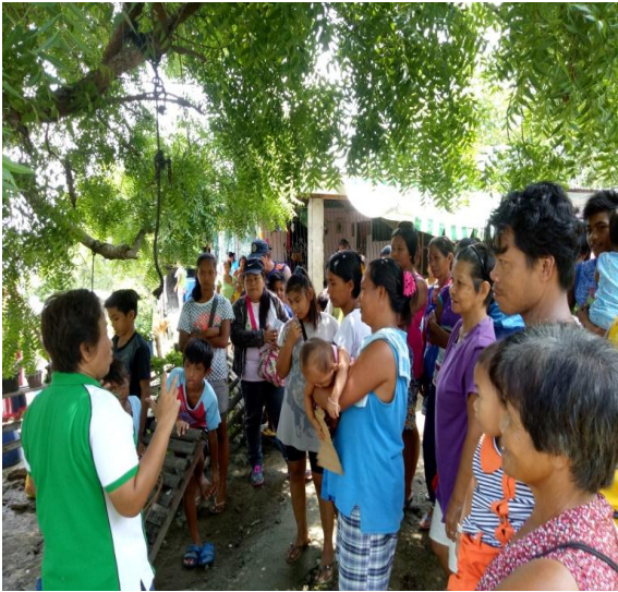
The Sanitation Inspector from Ramon, Isabela conducts Information Dissemination regarding Dengue Awareness on group of parents and teachers