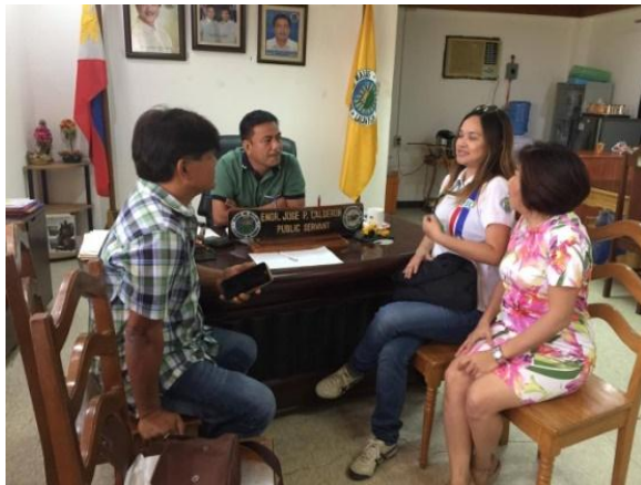
Courtesy call to the Municipal Mayor of Mallig, Isabela together with the Municipal Health Officer