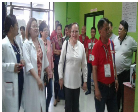
Tour to the GFNDSMH-Emergency Room with some Resident Doctors