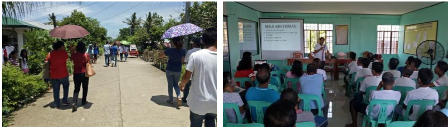
Close monitoring thru house to house on Responsible Pet Ownership.