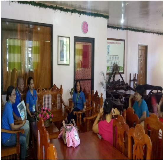
Courtesy call to the Municipal Mayor of San Agustin, Isabela