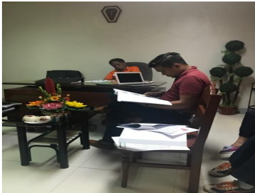
The external auditor poses questions regarding the health program, HIV/AIDS.