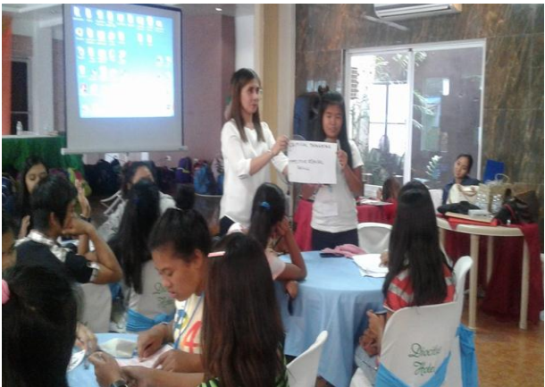
The POPCOM officer of Santiago City facilitates the group activity on “Harnessing my adolescent with life skills”.