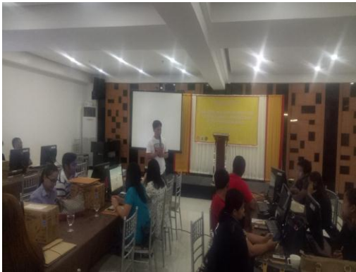
PhilMIS coordinator from DOH-Central Office emphasizes the importance of punctual report submission.