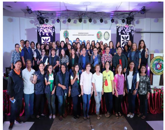
Guests and participants from the Province of Isabela during the DRRM-H Summit