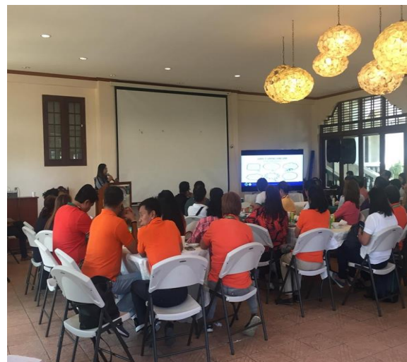
Regional representatives of UHC – draft IRR from DOH and PhilHealth shed light on some issues presented by the participants