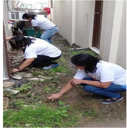
Removal of stocked old cans and stone-paving