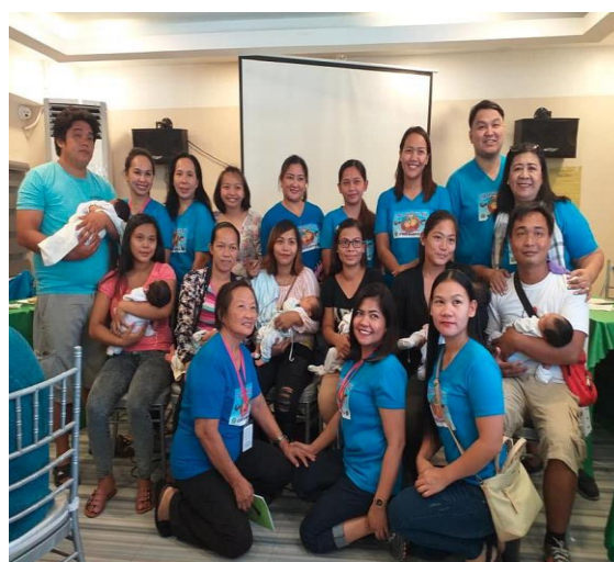
Newborn successfully bled for Newborn Screening.