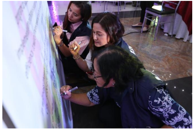
Isabela Municipal Health Officers and Doctors to the Barrio pledging their commitment to DRRM-H Institutionalization