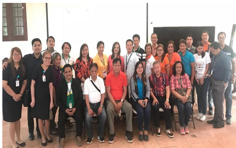
Isabela's Health Workforce in unison for Universal Health Care!