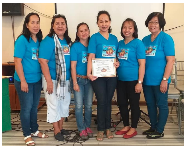
The Provincial MCH/NBS Coordinator receives her Certificate of Completion of Training.

Once fully implemented in all health facilities in the province, optimal growth and development of newborns shall be guaranteed and eventually contribute to the continued progress of all Isabelenos!