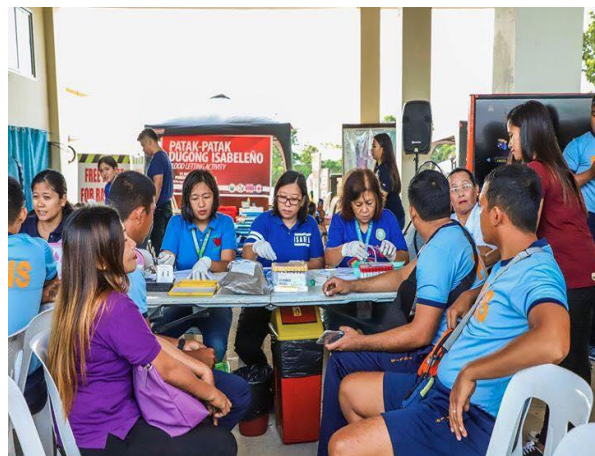
IPHO-FHS Medtechs give a helping hand during the screening of potential Blood Donors