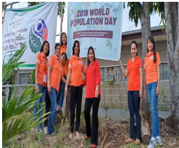
The Population Officers joined by MNCHN, STI/HIV Coordinators and other health workers of Isabela

With positive impacts of these demand –generation activities, Population Program will definitely continue to contribute towards sustainable development of the province!