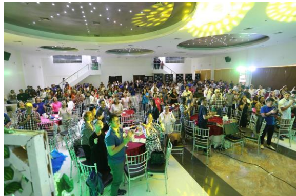
The activity was made fruitful through the timely and essential discussions of the guest speakers.