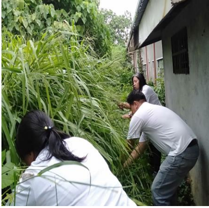
Clearing of tall grasses and plants that trap rain water