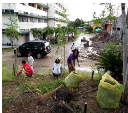
Some IPHO staff gathers dried leaves in front of the office.