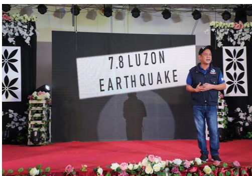
CV-CHD Regional Director on his keynote speech opening the DRRM-H Summit