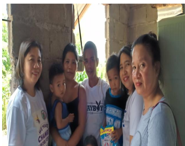
Taken at their house at Barangay Massipi, Cabagan with his family