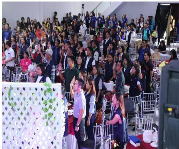
Participants and guests in their pledge of commitment towards DRRM-H Institutionalization.