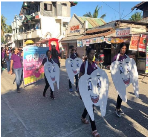
A creative parade in the municipality of Alicia supported by different daycare