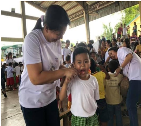
A well-attended activity supported by the municipal mayor and his councilors.