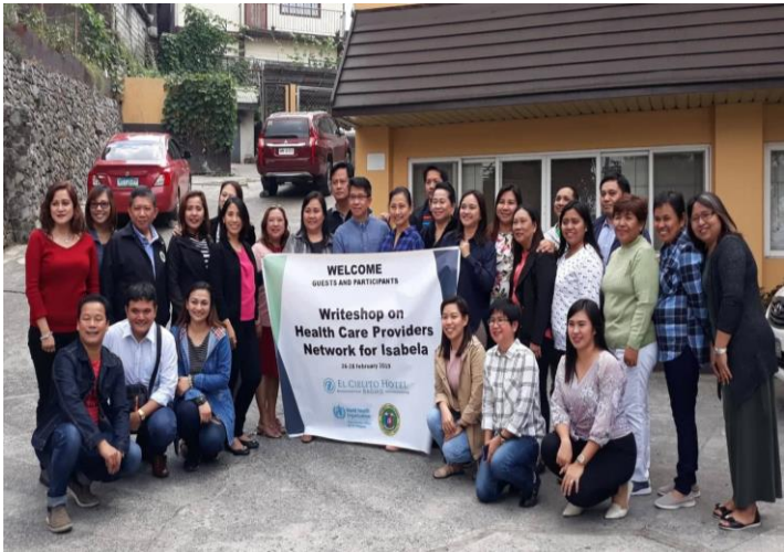
Group picture of all health stewards