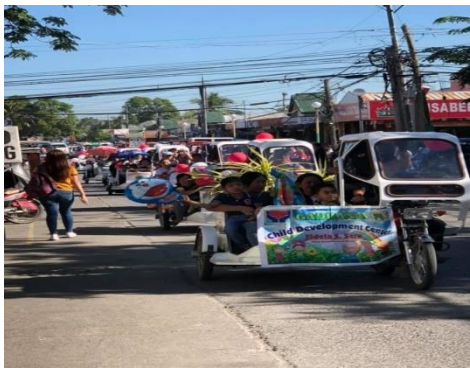
A motorcade participated by the different barangays followed by a song rendition from daycare pupils take place at San Mateo Isabela.