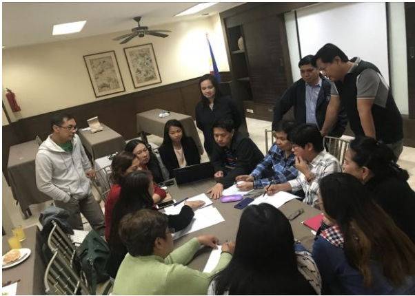
TMU-Isabela North members share their views based on their selected topics