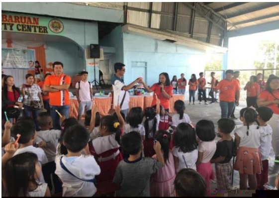
In the City of Cauayan, 500 pupils were given free toothbrushes, toothpastes and fluoride