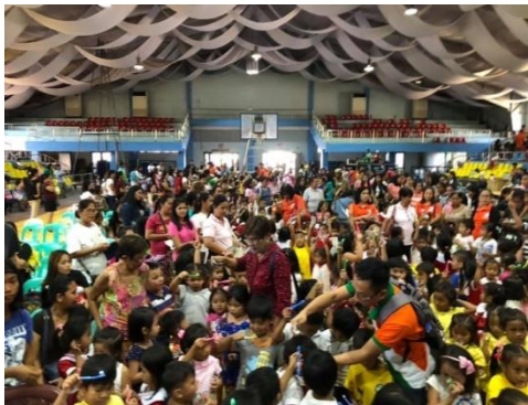
Launching of National Oral Health Month Celebration held in Ilagan City .