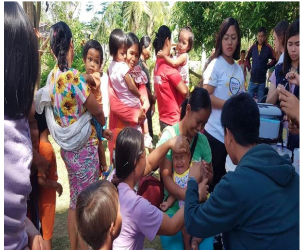
Team 1 during the on-site immunization