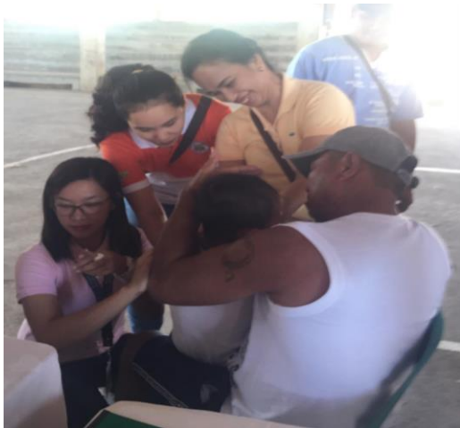
A screaming child receives a shot of Measles and Rubella Vaccine at Quezon, Isabela.