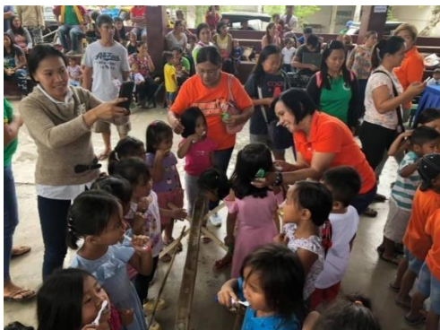
In Angadanan, Isabela with the Honorable Mayor taking shots of the tooth-brushing drill