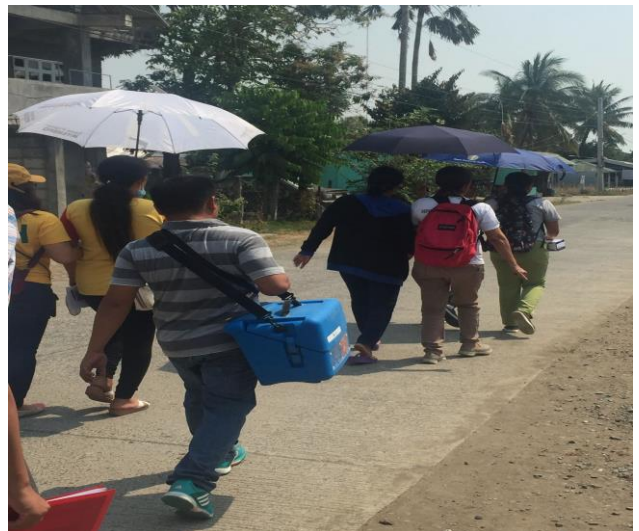
On the way to the house-to-house immunization strategy