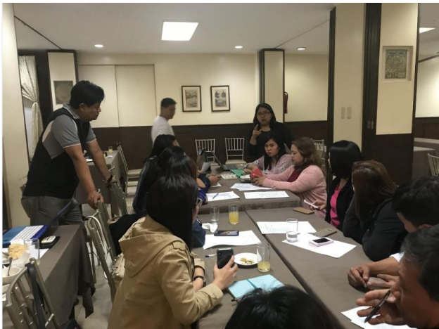
Members of Technical Management Unit (TMU)-Isabela South work together on their selected topics