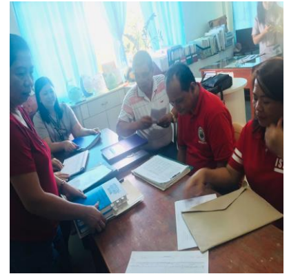
The Provincial Purple ribbon awards Comittee feedbacks to the Municipal Health officers of Cabagan, Quirino and Luna