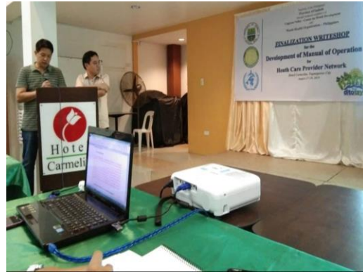
An open forum was facilitated wherein the CV-CHD and WHO provided technical assistance.