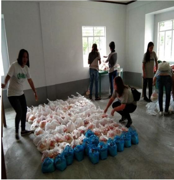
145 patients were given free medical services, medicines and relief goods.