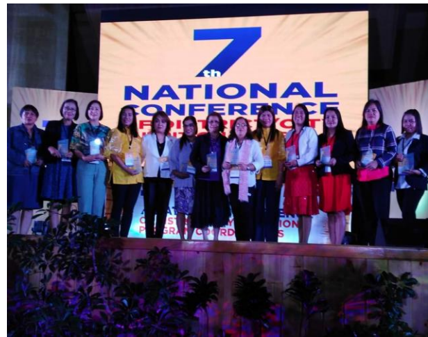
D/CNPC Board Of Directors strike a pose after the conference