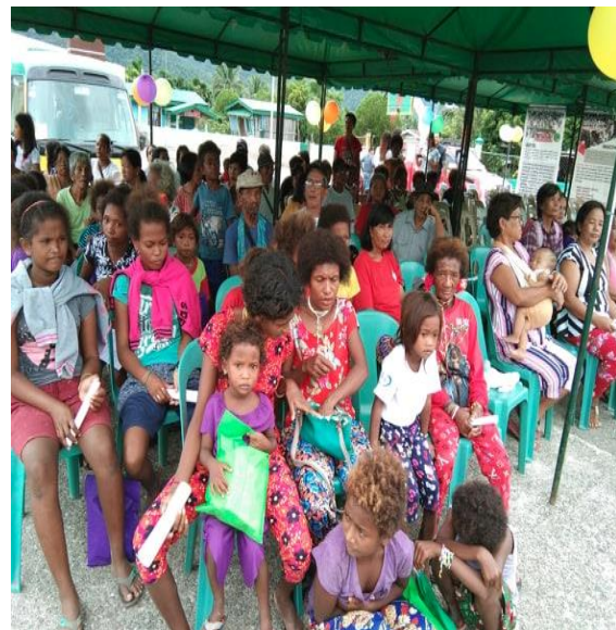
Constituents of Barangay Ayod as they remain eager for the services from the health workers