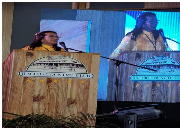
Our very own Nutritionist-Dietician III receives her 31 years in service as District Nutrition Program Coordinator