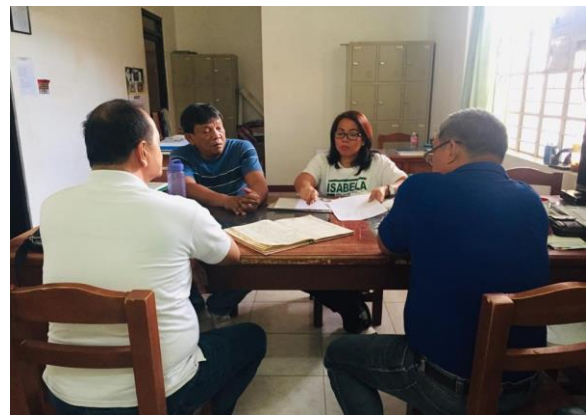
Day 4-the Provincial Purple Ribbon Awards committee shares insight on the improvement of documents in Naguilian and Gamu