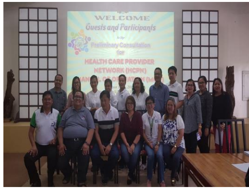
Group picture to signify inter LGU cooperation and partnership