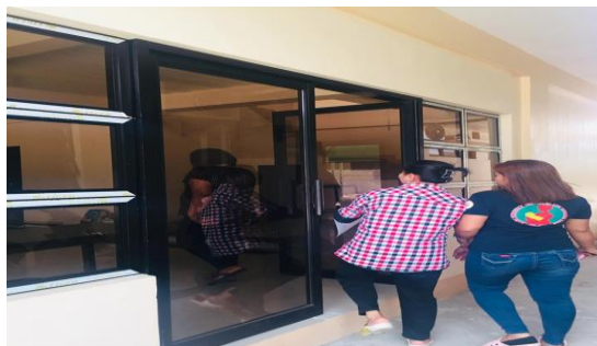
The Adolescent-friendly facilities of San Mariano, Benito Soliven and Angadanan validated by the Provincial Purple Ribbon Committee