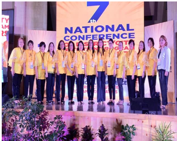
The Regional Presidents receive their individual service awards.

The conference aims to 1.) Update district/city municipal nutrition program coordinators (D/C/MNPCs) on the Philippine Plan of Action for Nutrition (PPAN) 2017-2022 and other policies and programs as basis for developing and coordinating local nutrition plans of action; 2.) enhance the skills of participants on self-development techniques related to improving their performances as D/C/MNPCs; 3.) provide a venue for the conduct of D/C/MNPCs general assembly to discuss various concerns of the association; and 4.) build and strengthen camaraderie among the delegates through participation and fellowship opportunities.