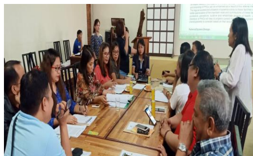
Small group discussion (Technical Management Unit North and South), scrutinizing the assigned chapters during Preliminary Consultation on Health Care Provider Network (HCPN) on Manual of Operations (MOP) at Piazza Zicarelli.