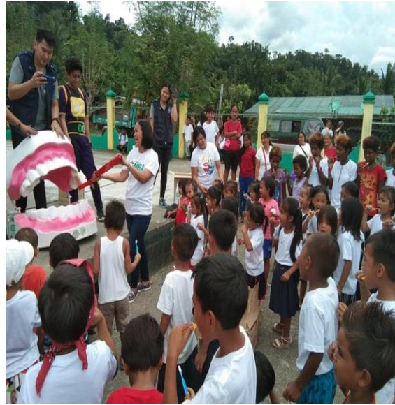
Toothbrush drill and demonstration on proper toothbrushing to children of Ayod.