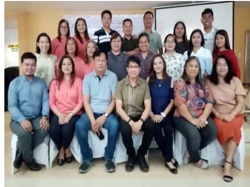
Group picture of the stakeholders of HCPN with WHO officer