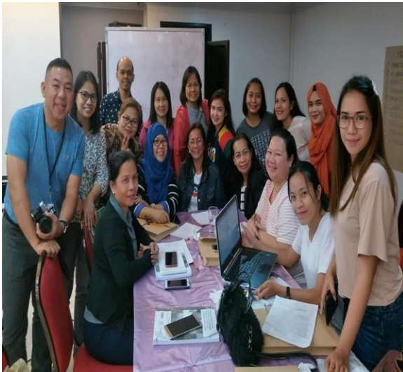
The pool of Trainers from the different parts of the country

As part of the Plan, a TOT on the complete package of PIMAM was conducted to capacitate the pool of trainers who will eventually be the resource persons and facilitators for the succeeding roll-out trainings. Conducted last August 5-9, 2019 at Richville, Mandaluyong City.