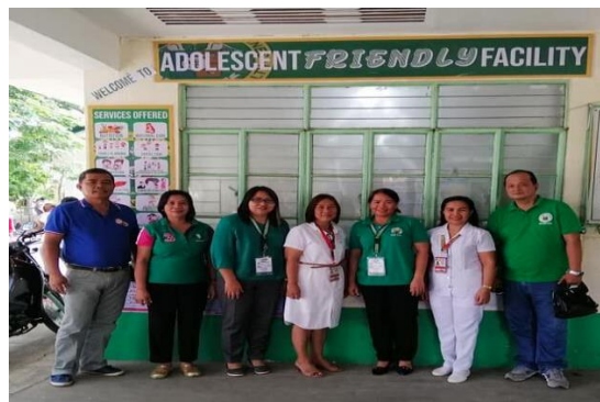
The facilities of San Isidro, Ramon, Cabagan and Gamu.