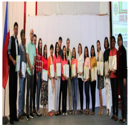
Our Hon. Governor signs a Memorandum of Agreement (MOA ) from DOH related to Granting of Medical Assistance to San Mariano Community Hospital and Medical Specialists . Adding glitter to the event is an Awarding for the Provincial Purple Ribbon Winners and Adolescent-friendly Health Facility to municipalities.