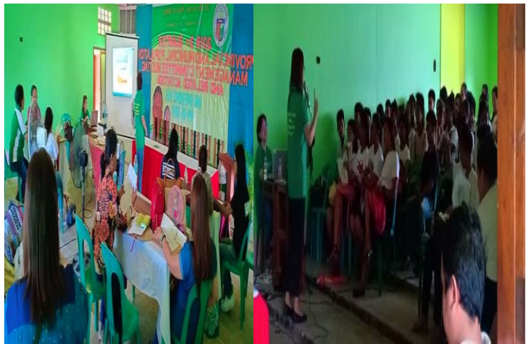
PopCom RO2 staff lectures the youth of Dinapigue on issues on Adolescent Reproductive Health.