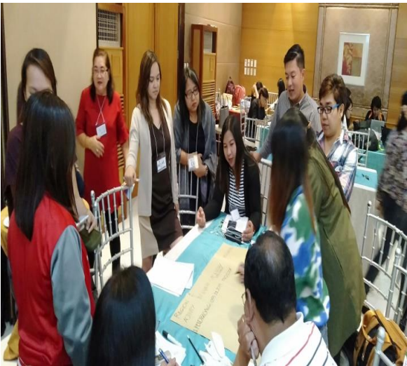
The three UHC Integration Sites (Isabela, Quirino, Nueva Vizcaya) with PHIC Regional VP discuss the group workshop on Expectation Setting