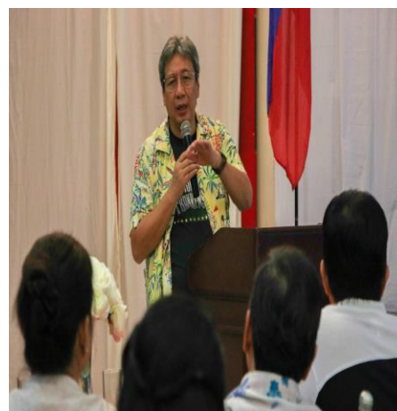
Honorable Governor Rodolfo T Albano III warmly delivers an inspirational message to the participants.