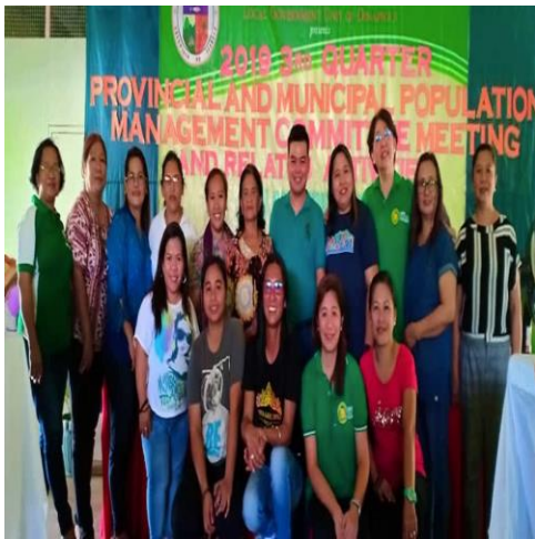
A snapshot of the Regional, Provincial & Municipal Population Officers with the MHO of Dinapigue.