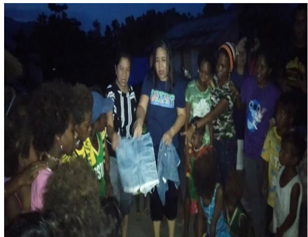
Exciting faces from the Dumagatan Villagers were evident during Gift-giving activity