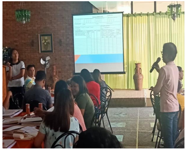
Public Health Nurses from Benito Soliven and Palanan clarify issues on the updated FHSIS report