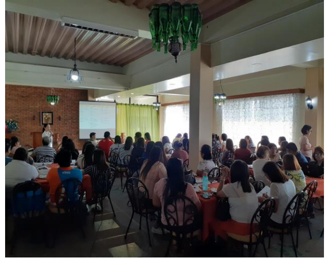
Respective program coordinators provide updates based on the FHSIS MOP Version 2018