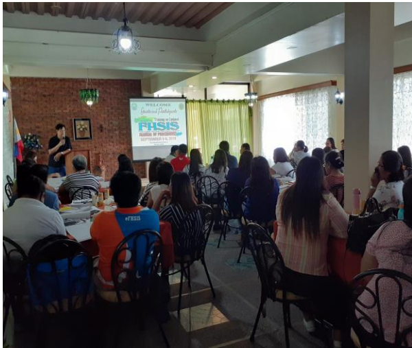
PHO II warmly welcomes all the participants

With the new knowledge, skills and attitude gained, the provincial government can be assured of quality data which critically contribute as primary basis for health better planning!