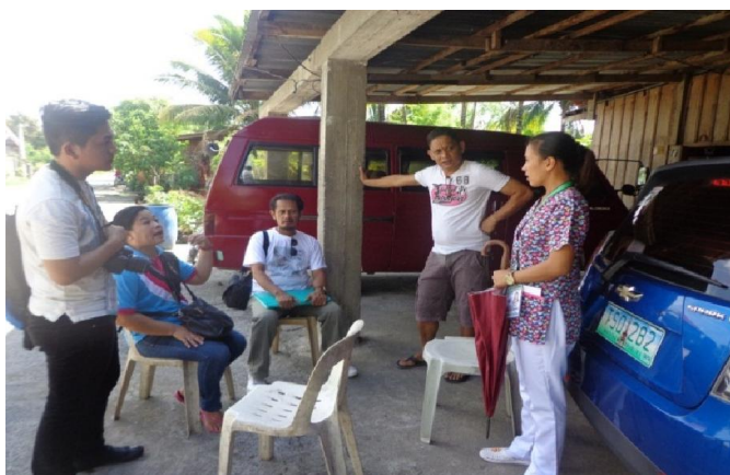
Courtesy call to Barangay Captain of District 3 Gamu, Isabela.

Health teaching was done such as; the start of symptoms will usually be one to three months; however it can vary from less than one week to more than one year. Rabies is a viral disease that causes acute inflammation of the brain in humans and other warm-blooded animals. The duration of time and the bite site must be well-thought-out before the virus reaches the central nervous system. Emphasis was given about the early symptoms which include fever and tingling sensation at the site of exposure. If rabies is left untreated it may result to intensification of the virus in the clients body and is manifested by violent movements, uncontrolled excitement, fear of water (Hydrophobia) and Air (Aerophobia), and soon after, the victim will experience confusion and loss of consciousness. When these symptoms appear it will gradually progress and eventually result to death.