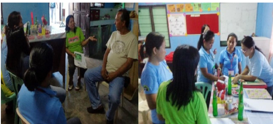
Taken during the Monitoring and Evaluation at Brgy. Malalam, City of Ilagan, Isabela in the presence of the Brgy. Captain where he discusses with the team the prevalence of malnutrition in the area. The team also evaluates the performance of the Barangay Nutrition Scholar (BNS) who is tasked to coordinate the delivery of basic nutrition services in the area.