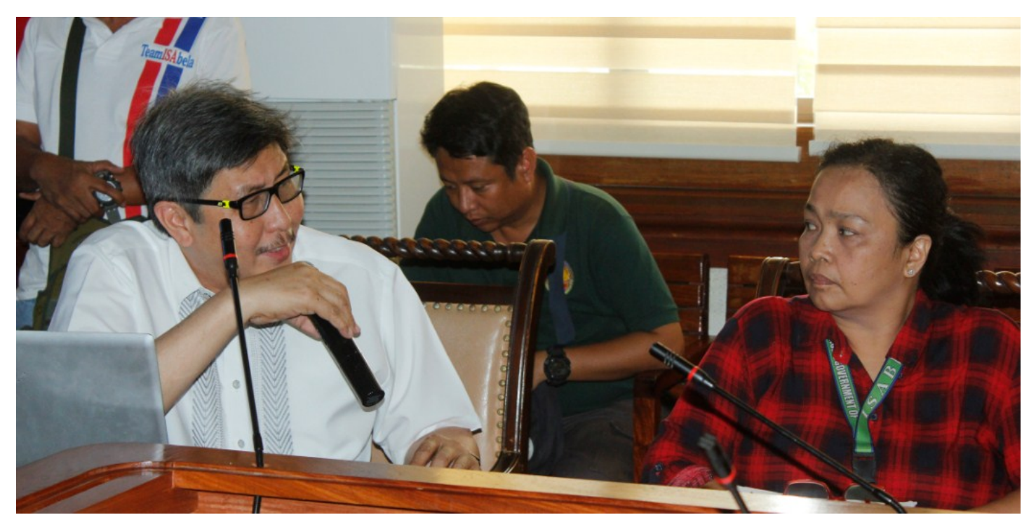
I-PADAC MEMBERS AND STAKEHOLDERS DISCUSS OPERATIONAL PLANS AND ACTIVITIES DURING THE I-PADAC MEETING