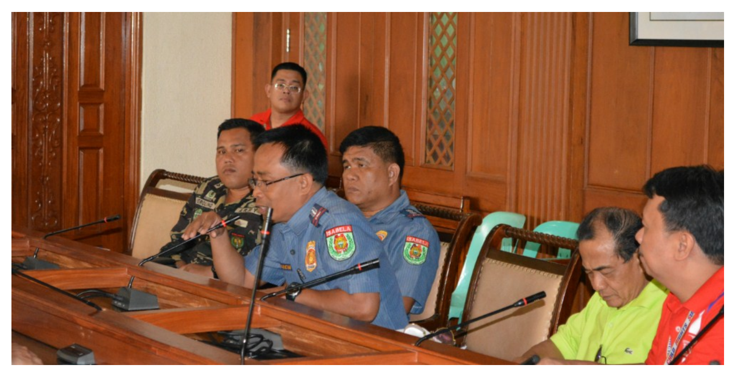
I-PADAC MEMBERS AND STAKEHOLDERS DISCUSS OPERATIONAL PLANS AND ACTIVITIES DURING THE I-PADAC MEETING