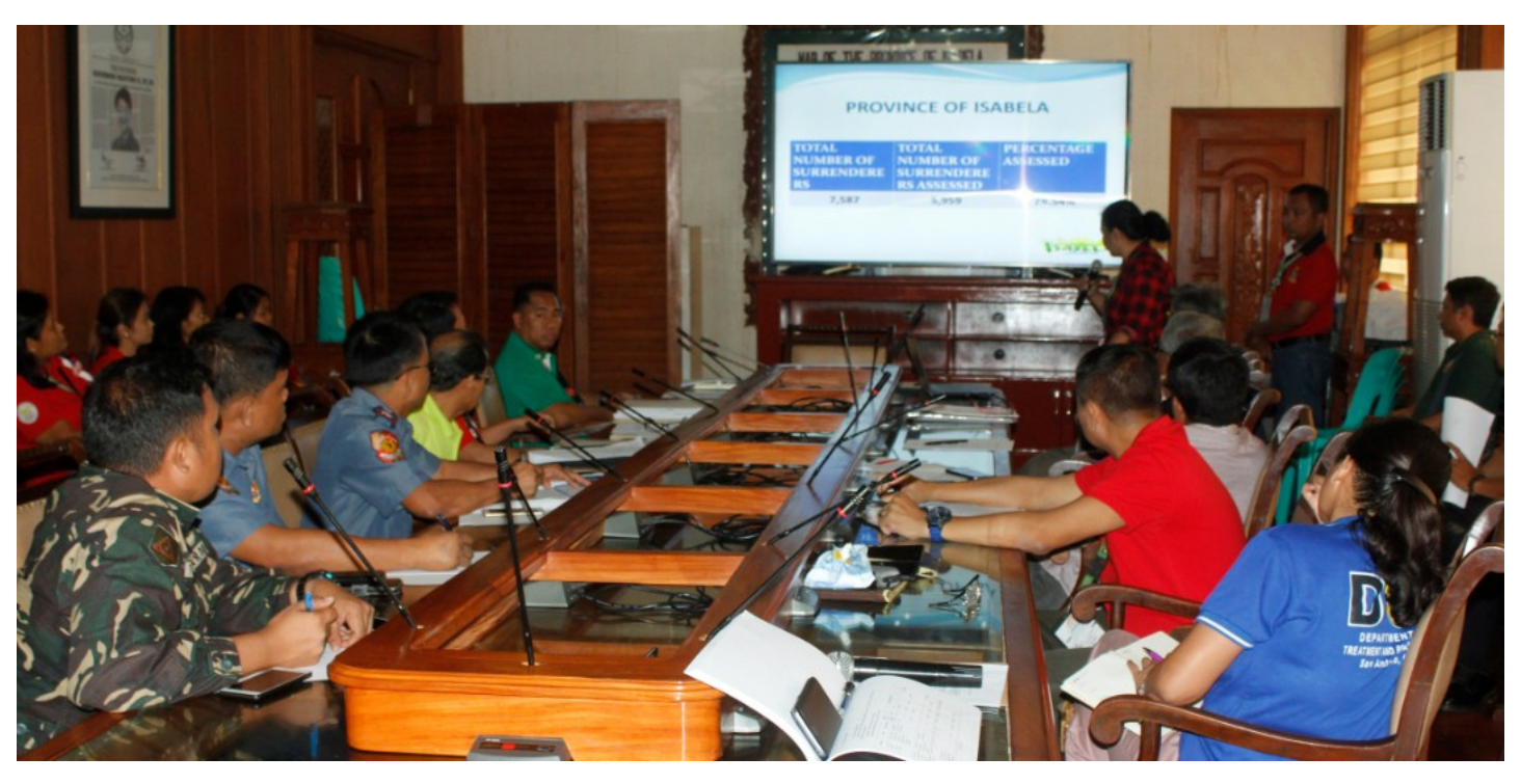
DOH-ISABELA PROVINCIAL HEALTH OFFICE PRESENTS STATUS REPORT OF CURRENT DRUG DEPENDENTS UNDER THEIR CARE AND SUPERVISION