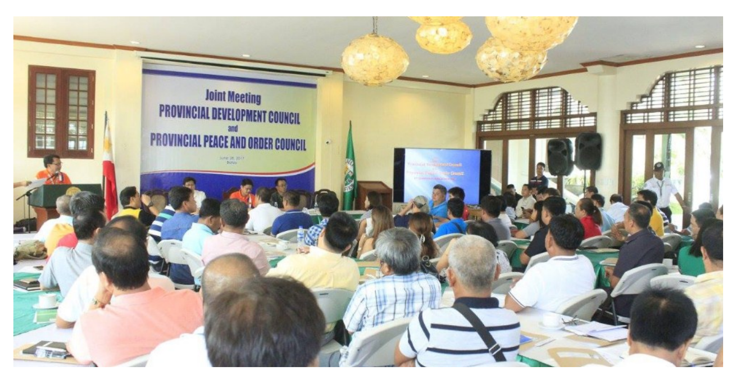
GOVERNOR FAUSTINO "BOJIE" G. DY III LEADS THE PDC AND PPOC 2ND QUARTER JOINT MEETING HELD AT BALAI CONFERENCE HALL, ISABELA PROVINCIAL CAPITOL GROUNDS, CITY OF ILAGAN, ISABELA