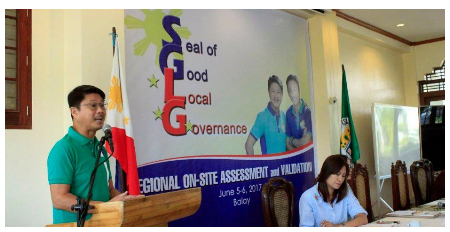
GOVERNOR FAUSTINO "BOGIE" G. DY III DELIVERS HIS MESSAGE DURING THE SEAL OF GOOD LOCAL GOVERNANCE REGIONAL ON-SITE ASSESSMENT AND VALIDATION MEETING