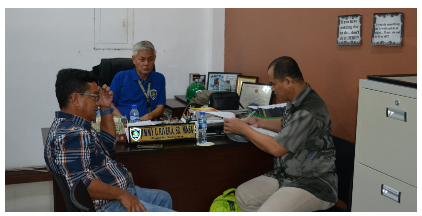
INDEPENDENT CONSULTANCY SERVICE MACROVISION INCORPORATED CONDUCTED A DRY RUN AND AUDITED THE PUBLIC SAFETY OFFICE ON ITS CONFORMANCE WITH THE ISO 9001:2008 QUALITY STANDARDS