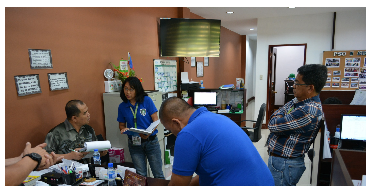
INDEPENDENT CONSULTANCY SERVICE MACROVISION INCORPORATED CONDUCTED A DRY RUN AND AUDITED THE PUBLIC SAFETY OFFICE ON ITS CONFORMANCE WITH THE ISO 9001:2008 QUALITY STANDARDS