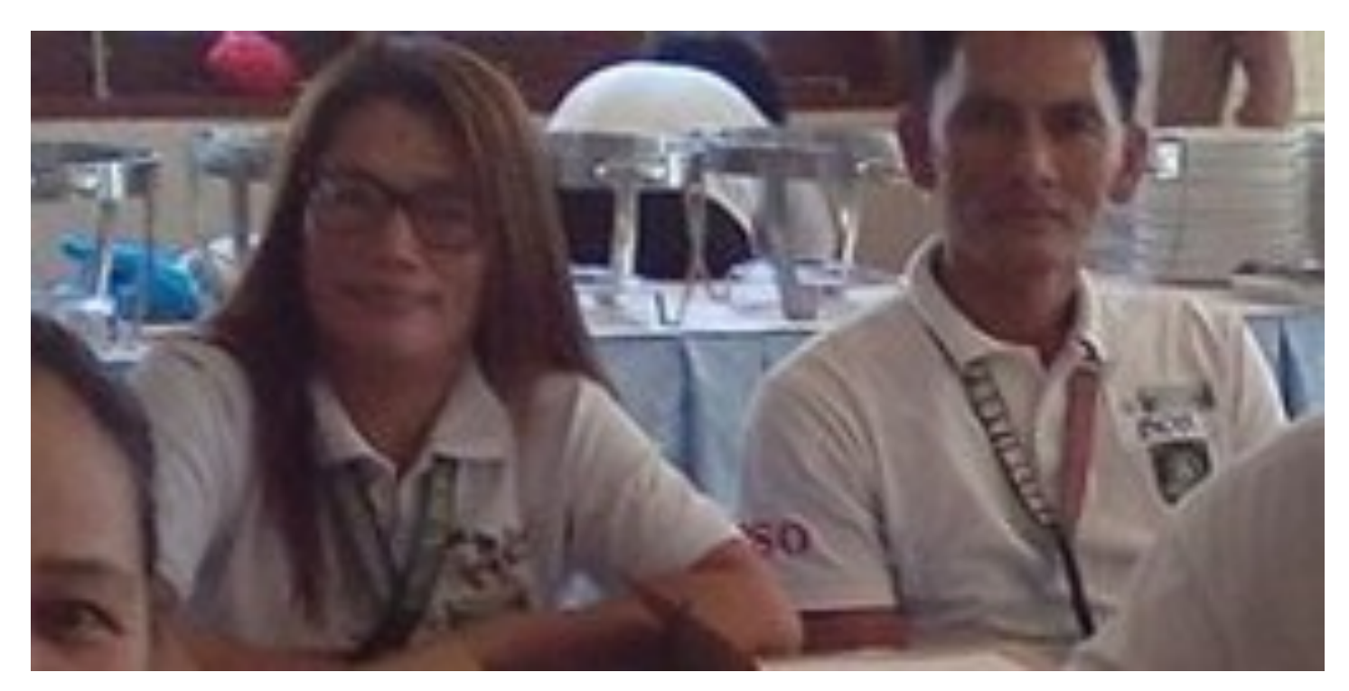
PSO PERSONNEL ATTENDS PGI INITIATED TRAINING FOR PROVINCIAL EMPLOYEES