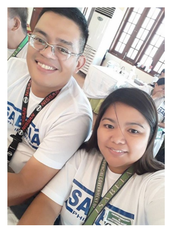
PSO PERSONNEL ATTENDS PGI INITIATED TRAINING FOR PROVINCIAL EMPLOYEES