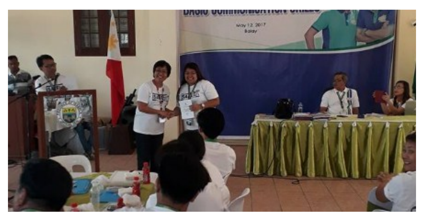
PSO PERSONNEL ATTENDS PGI INITIATED TRAINING FOR PROVINCIAL EMPLOYEES