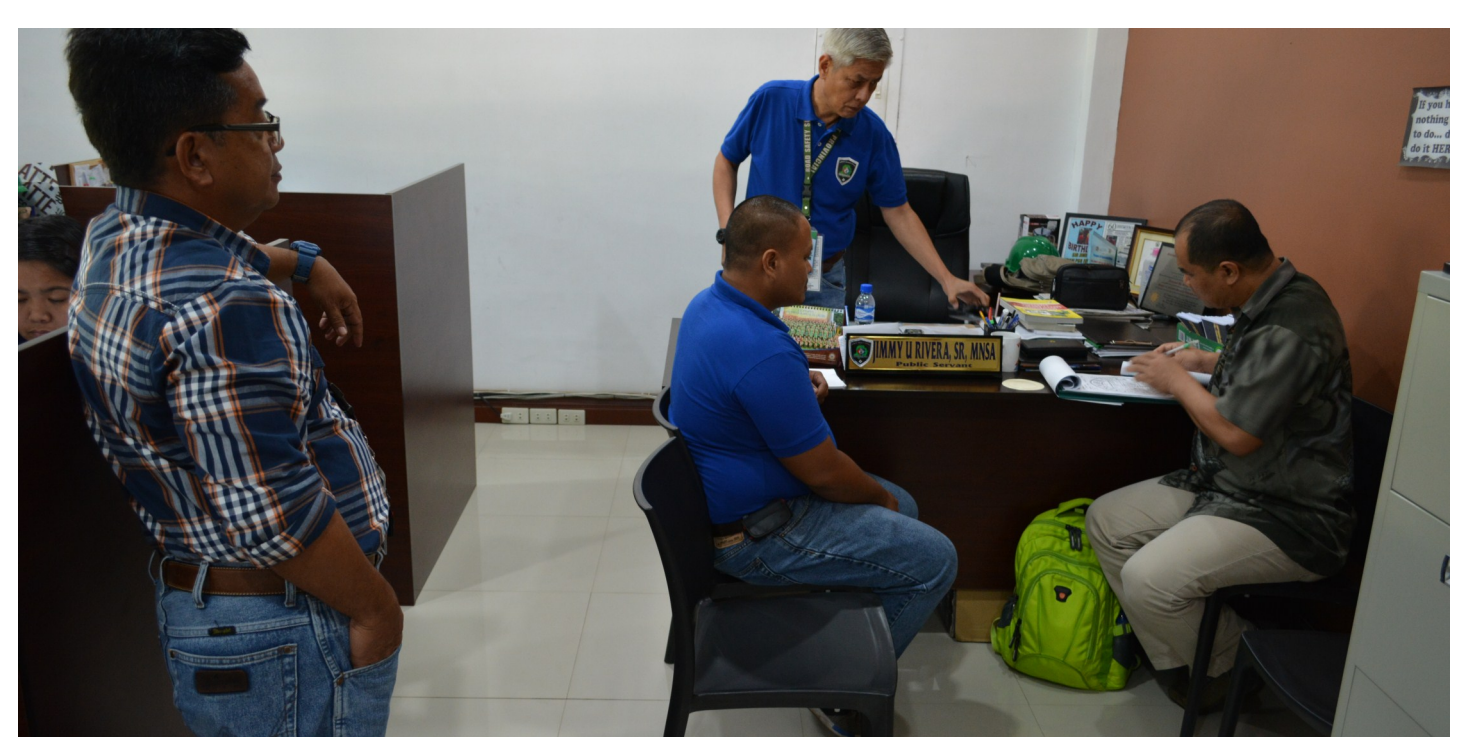
INDEPENDENT CONSULTANCY SERVICE MACROVISION INCORPORATED CONDUCTED A DRY RUN AND AUDITED THE PUBLIC SAFETY OFFICE ON ITS CONFORMANCE WITH THE ISO 9001:2008 QUALITY STANDARDS