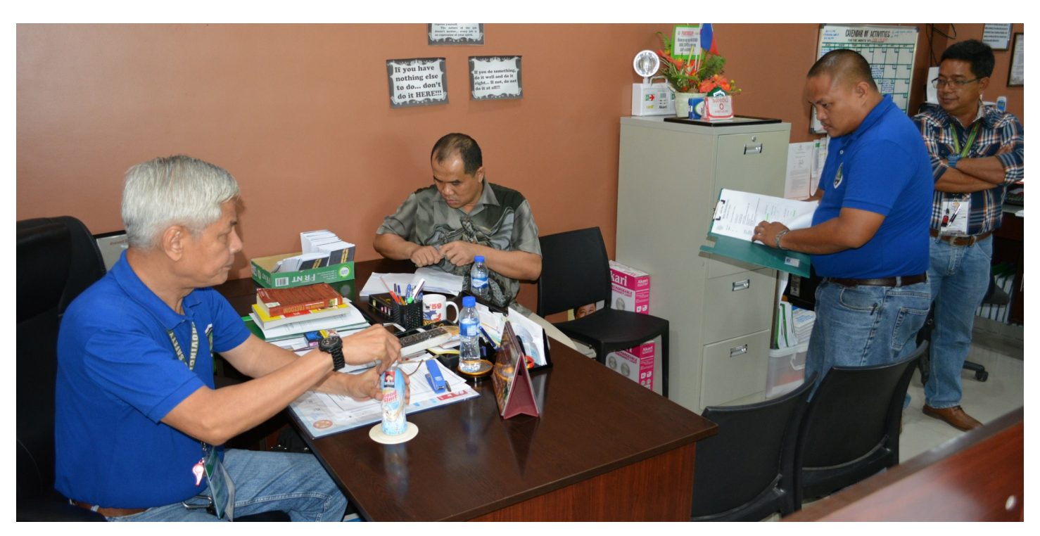
INDEPENDENT CONSULTANCY SERVICE MACROVISION INCORPORATED CONDUCTED A DRY RUN AND AUDITED THE PUBLIC SAFETY OFFICE ON ITS CONFORMANCE WITH THE ISO 9001:2008 QUALITY STANDARDS