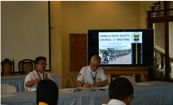
ROAD SAFETY COUNCIL 1ST MEETING FOR 2018

Main agenda for the meeting was the upcoming Road Safety Summit being planned to further broaden the reach of the Council on matters and current state of Road Safety within the Province.