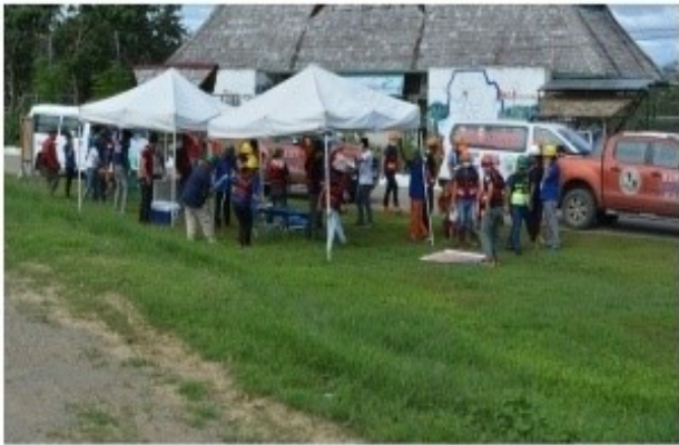
ISABELA PROVINCIAL CAPITOL JOINS 1ST QUARTER NSED

Various scenarios were prepared by the Dart 831 Emergency Medical Technicians to make the Drill as close as possible to the real thing, even adding a breakout fire scenario wherein BFP personnel from the Isabela Provincial station provided a fire-fighting simulation