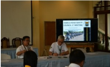
ROAD SAFETY COUNCIL 1ST MEETING FOR 2018

Main agenda for the meeting was the upcoming Road Safety Summit being planned to further broaden the reach of the Council on matters and current state of Road Safety within the Province.