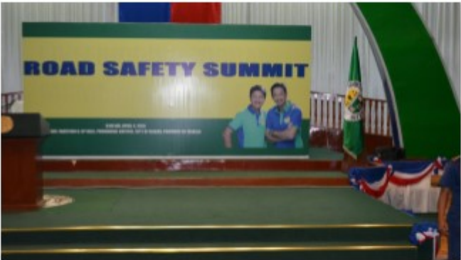
2nd PROVINCIAL ROAD SAFETY SUMMIT

The summit was held at the GFNDY Hall and Ampitheatre last April 4, 2018. Main agenda for the Summit was to discuss existing Road Safety Laws, ordinances and issuances as well as the matter of it's implementation throughout the Province. Discussion with LGU leaders was also in the Agenda to further broaden the reach of the Council on mat-