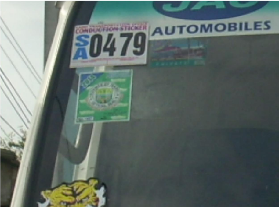
The assigned PSG posts the DELIVERY VAN TAX Sticker as proof of payment