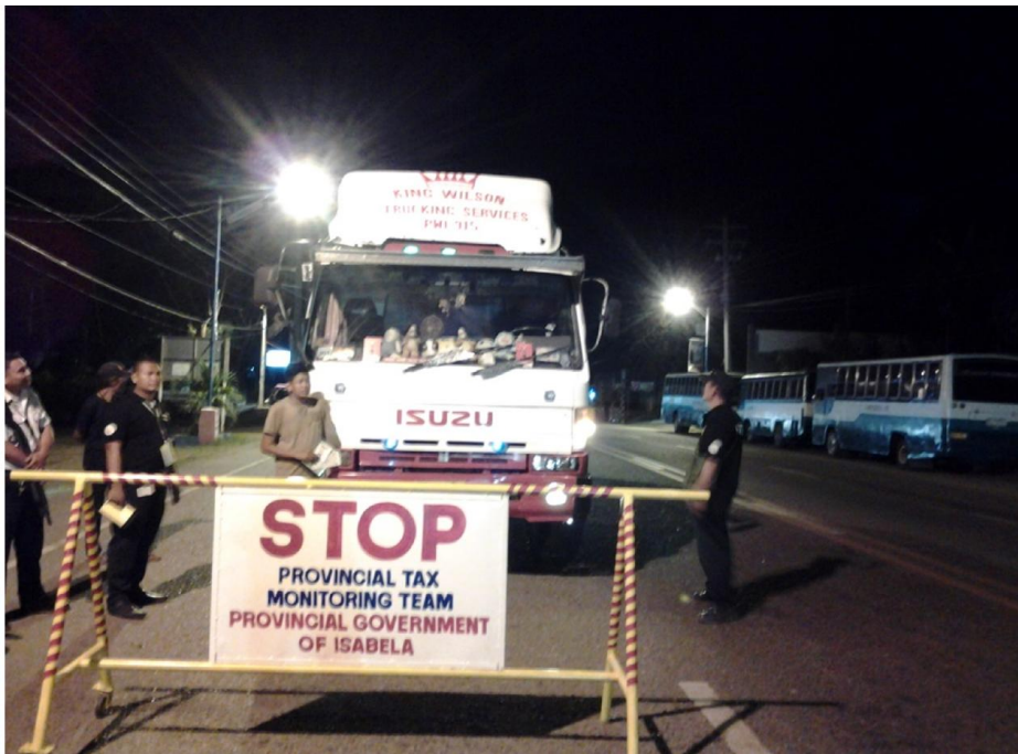
Field Collector and the assigned PSG, still at their post even at nighttime