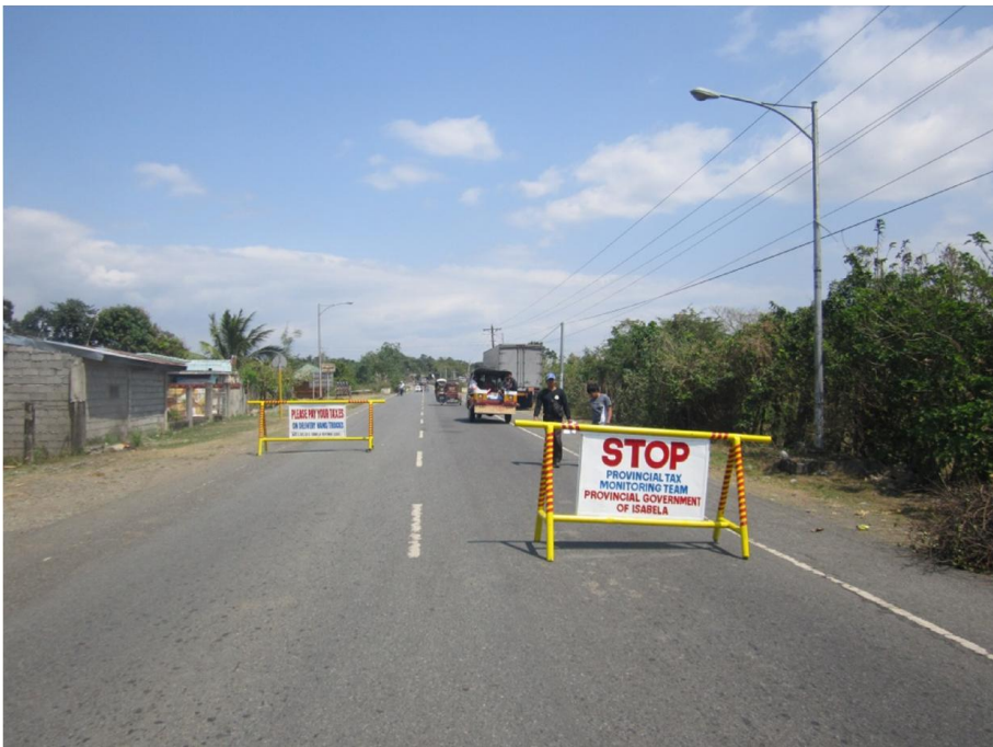
Road barricades along the road of San Pablo, in front of the checkpoint