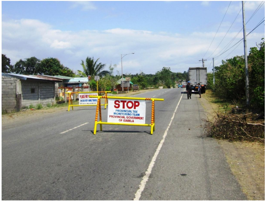
Road barricades along the road of San Pablo, infront of the checkpoint