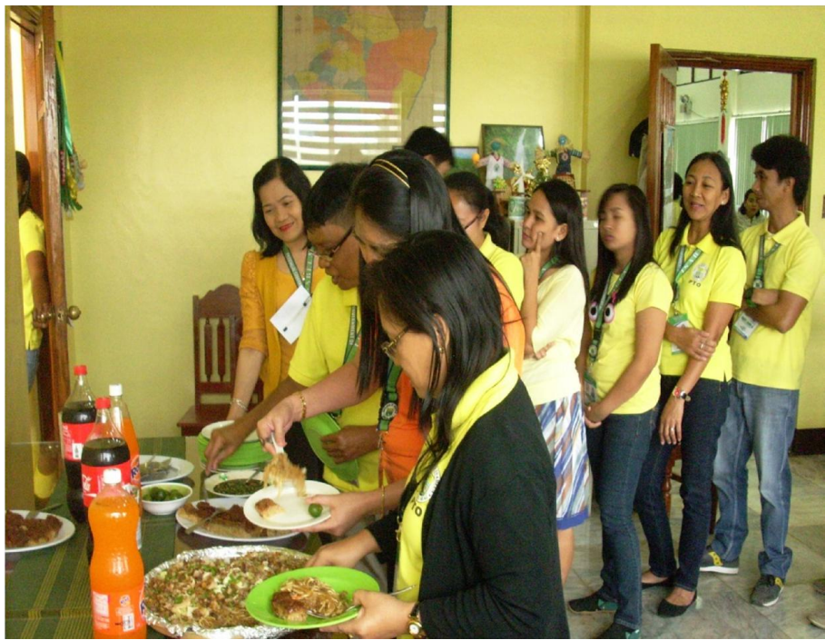
This also fosters camaraderie among the PTO FAMILY...