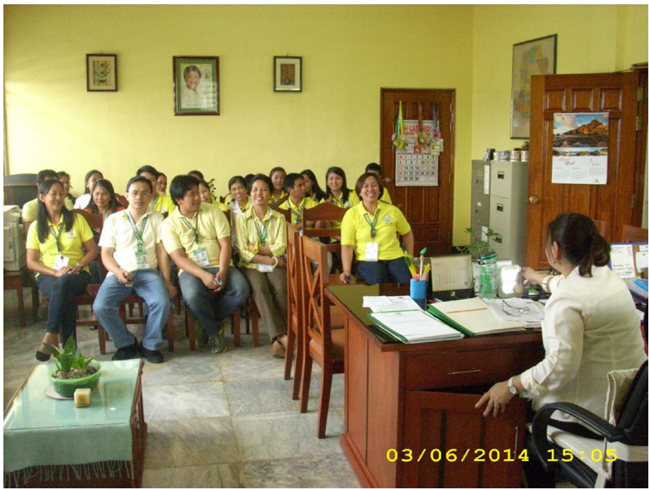
Interaction results to good rapport within the PTO family