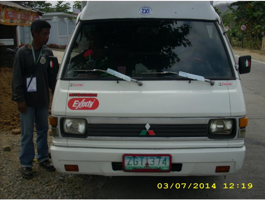
Assigned PSG flagged down Delivery Trucks to check on the payment of Delivery Van Tax