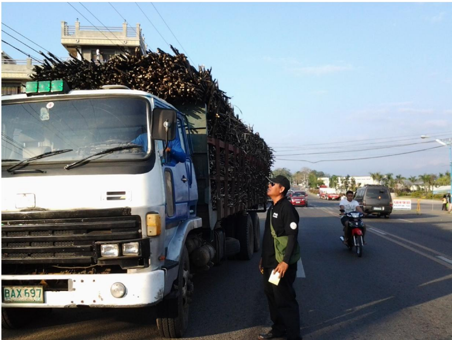
Assigned PSG flagged down a Delivery Truck of ECOFUEL Land Development Inc., loaded with sugarcane to check on the payment of Delivery Van Tax