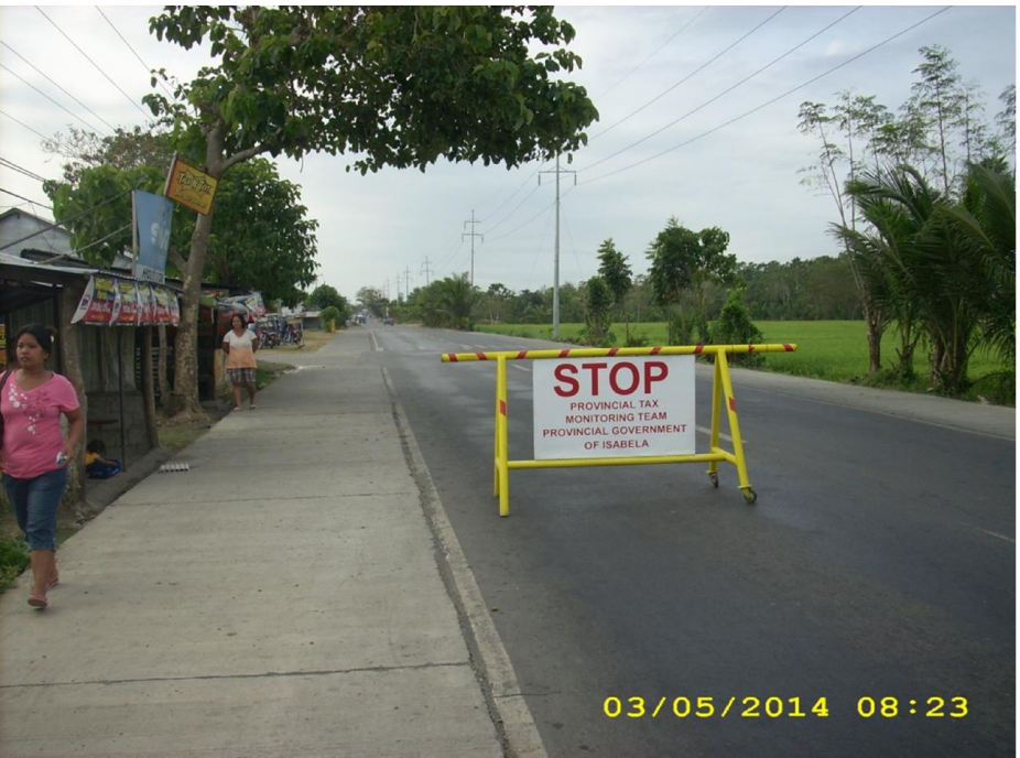
Barricades were already positioned on both lanes of the road