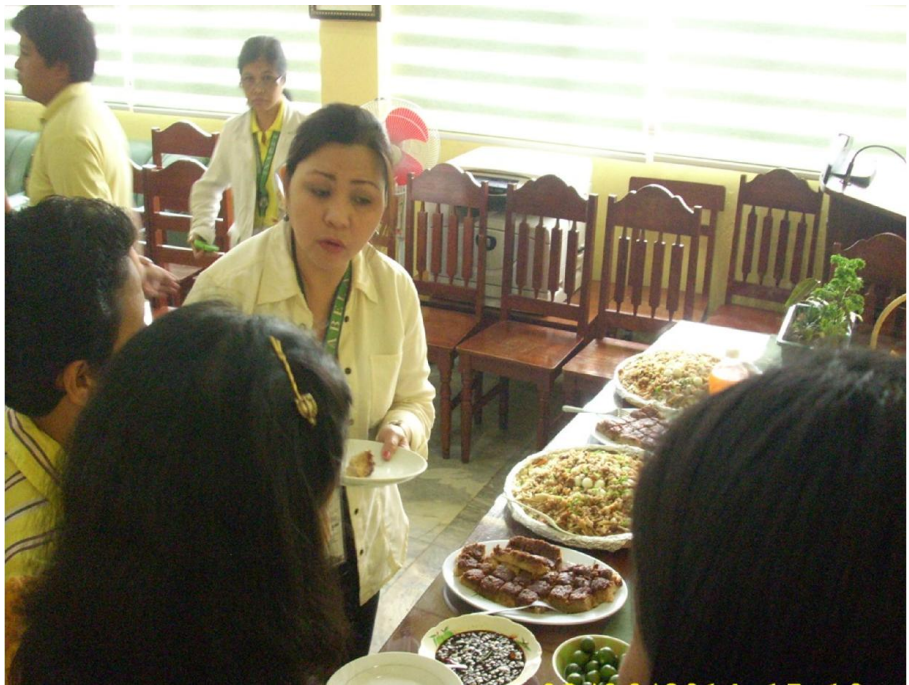
The meeting concluded with a simple “salo-salo”...