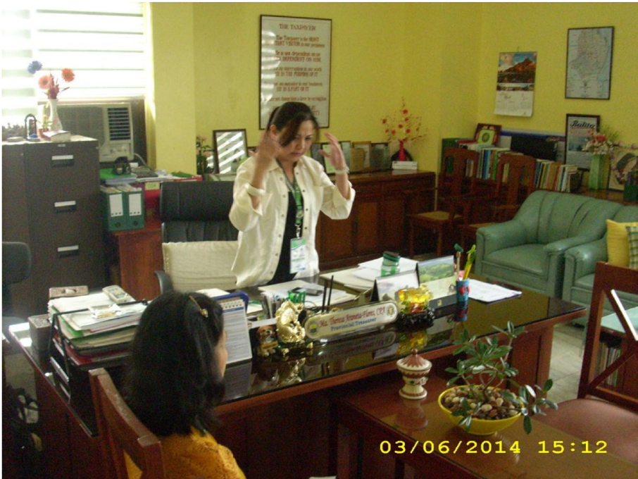
Initiative, versatility and punctuality are always emphasized ....