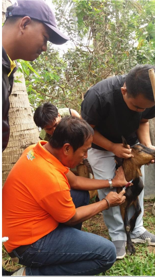
The Technical Staff of the NVSU and PVET Office collect blood and fecal samples in the selected municipalities of the province.