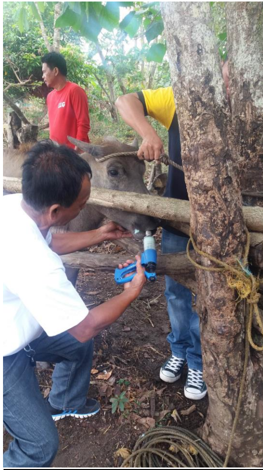
The Technical Staff of the NVSU and PVET Office collect blood and fecal samples in the selected municipalities of the province.