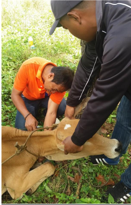
The Technical Staff of the NVSU and PVET Office collect blood and fecal samples in the selected municipalities of the province.