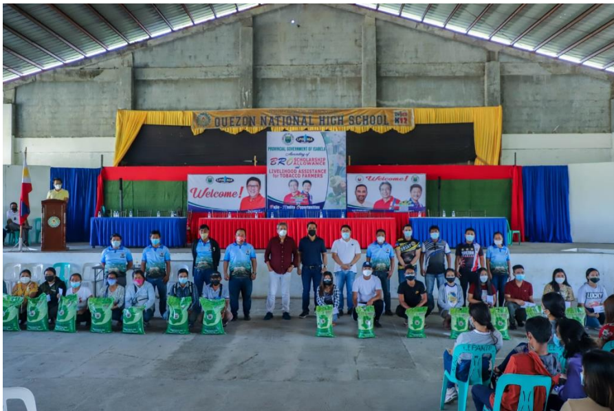
December 16, 2021 – Quezon, Isabela