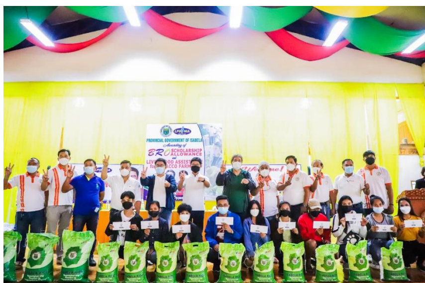
December 20, 2021 – Naguilian, Isabela