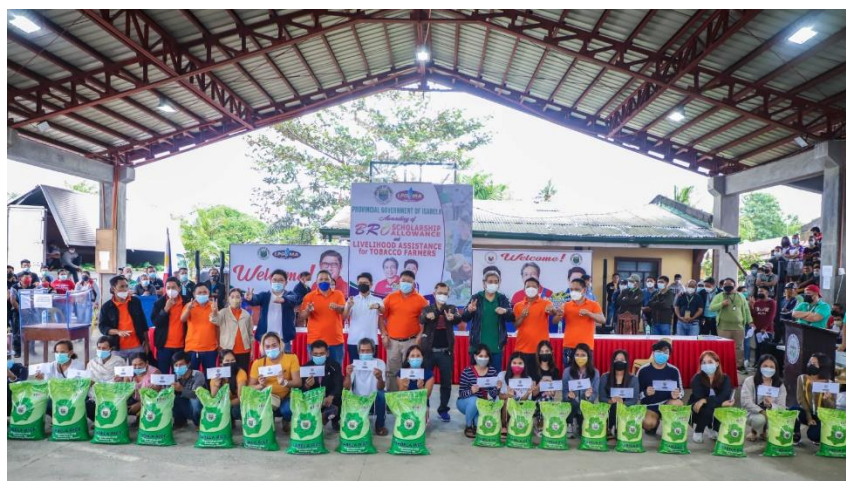
December 20, 2021 – Gamu, Isabela