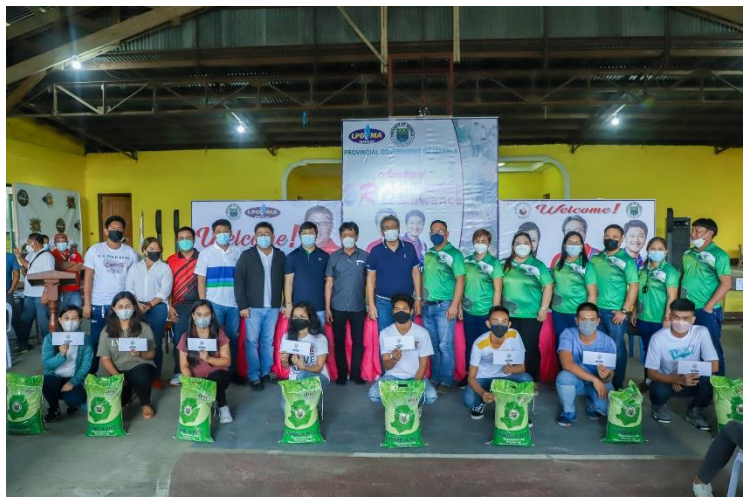
December 14, 2021 – San Agustin, Isabela