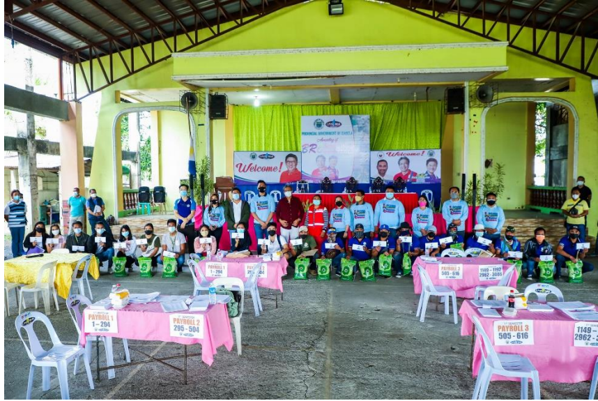
December 16, 2021 – Roxas, Isabela