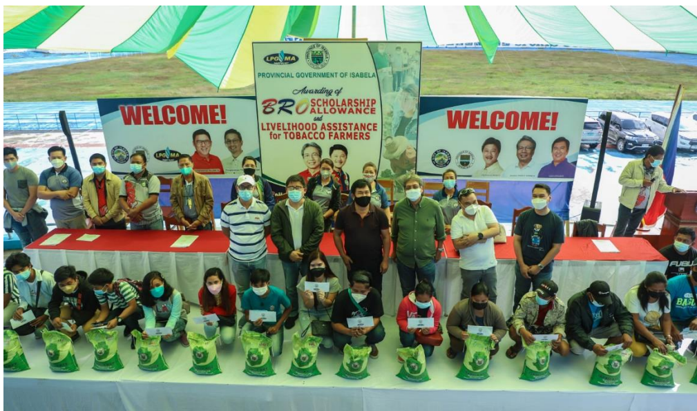
December 10, 2021 – City of Ilagan, Isabela