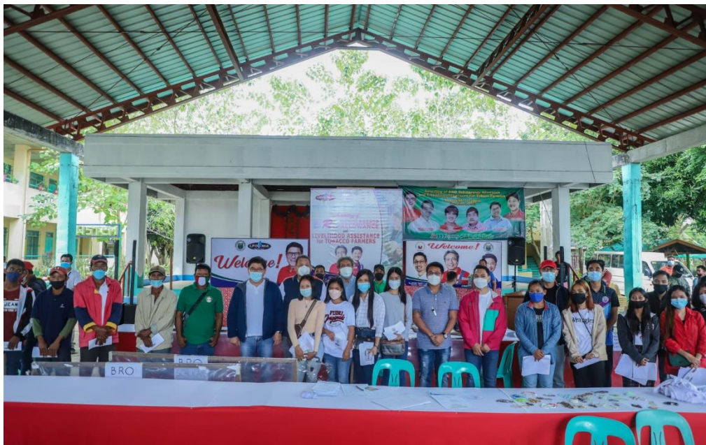
December 11, 2021 – San Pablo, Isabela