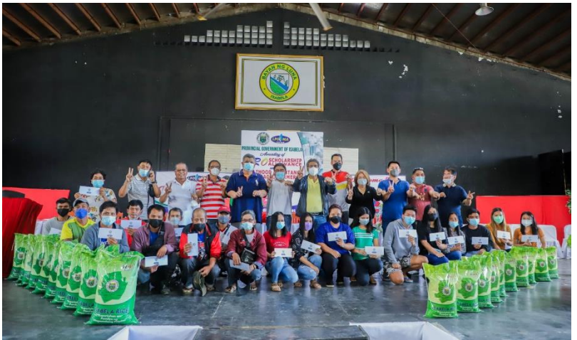
December 21, 2021 – Luna, Isabela