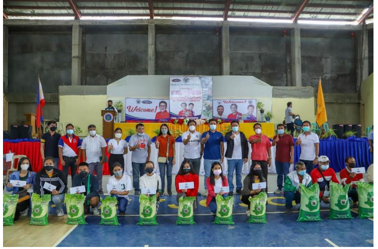
December 13, 2021 – Mallig, Isabela