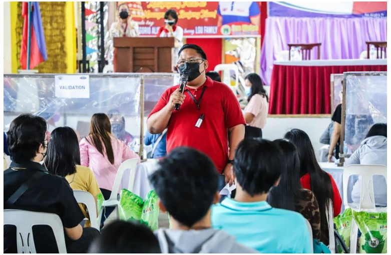
December 21, 2021 – San Mateo, Isabela