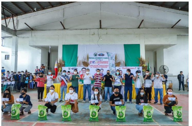
December 17, 2021 – Burgos, Isabela