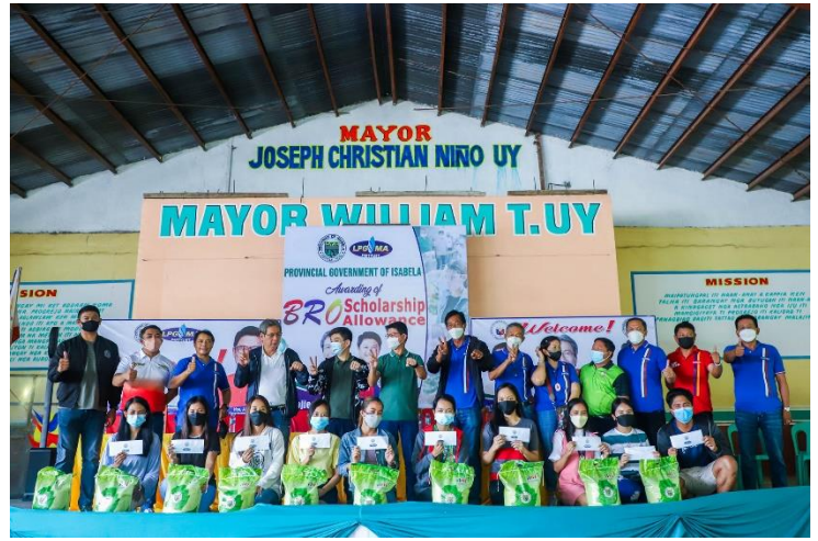
December 17, 2021 – Aurora, Isabela