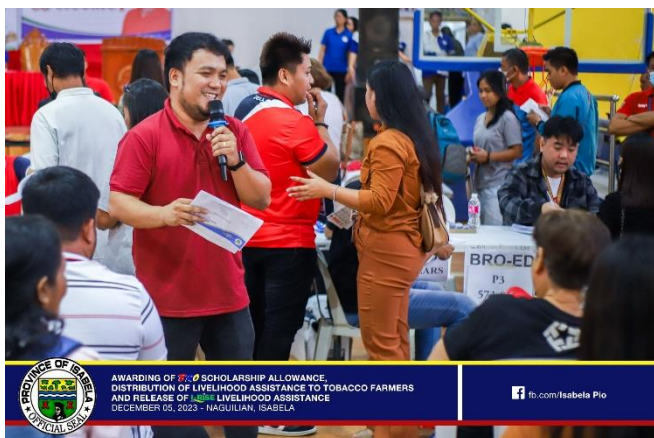
AWARDING OF ₱2.0 SCHOLARSHIP ALLOWANCE, DISTRIBUTION OF LIVELIHOOD ASSISTANCE TO TOBACCO FARMERS AND RELEASE OF ₱1.0 LIVELIHOOD ASSISTANCE DECEMBER 05, 2023 - NAGUILIAN, ISABELA fb.com/Isabela Pio