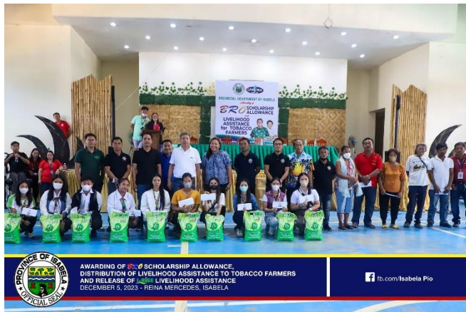
AWARDING OF ₱2.0 SCHOLARSHIP ALLOWANCE, DISTRIBUTION OF LIVELIHOOD ASSISTANCE TO TOBACCO FARMERS AND RELEASE OF ₱1.0 LIVELIHOOD ASSISTANCE DECEMBER 9, 2023 - REINA MERCEDES, ISABELA fb.com/Isabela Pio