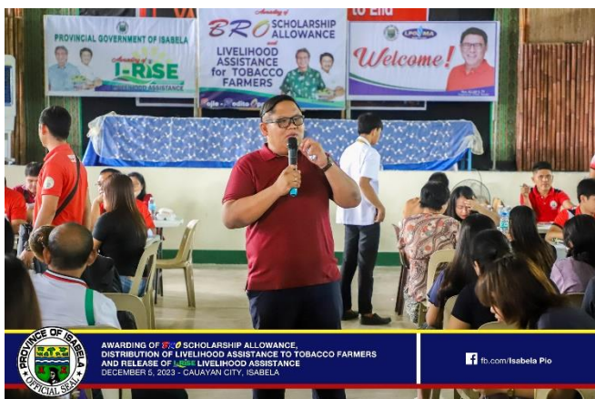
AWARDING OF ₱2.0 SCHOLARSHIP ALLOWANCE, DISTRIBUTION OF LIVELIHOOD ASSISTANCE TO TOBACCO FARMERS AND RELEASE OF ₱1.0 LIVELIHOOD ASSISTANCE DECEMBER 5, 2023 - CAUAYAN CITY, ISABELA fb.com/Isabela Pio