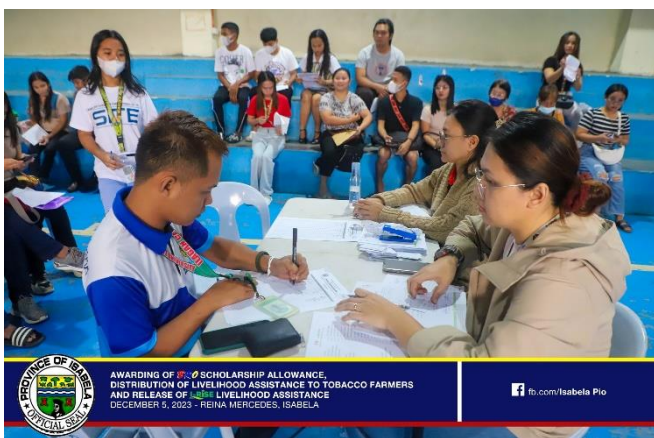
AWARDING OF ₱2.0 SCHOLARSHIP ALLOWANCE, DISTRIBUTION OF LIVELIHOOD ASSISTANCE TO TOBACCO FARMERS AND RELEASE OF ₱1.0 LIVELIHOOD ASSISTANCE DECEMBER 9, 2023 - REINA MERCEDES, ISABELA