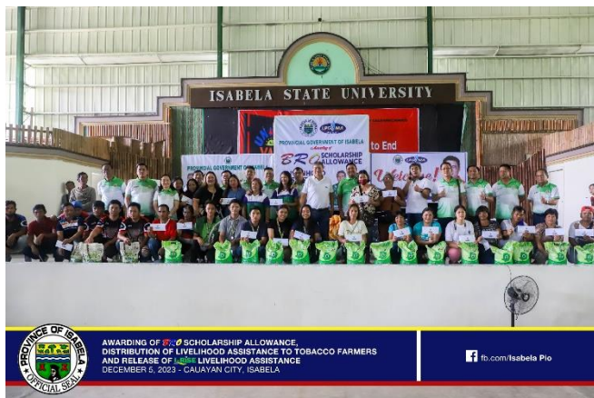
AWARDING OF ₱2.0 SCHOLARSHIP ALLOWANCE, DISTRIBUTION OF LIVELIHOOD ASSISTANCE TO TOBACCO FARMERS AND RELEASE OF ₱1.0 LIVELIHOOD ASSISTANCE DECEMBER 5, 2023 - CAUAYAN CITY, ISABELA fb.com/Isabela Pio