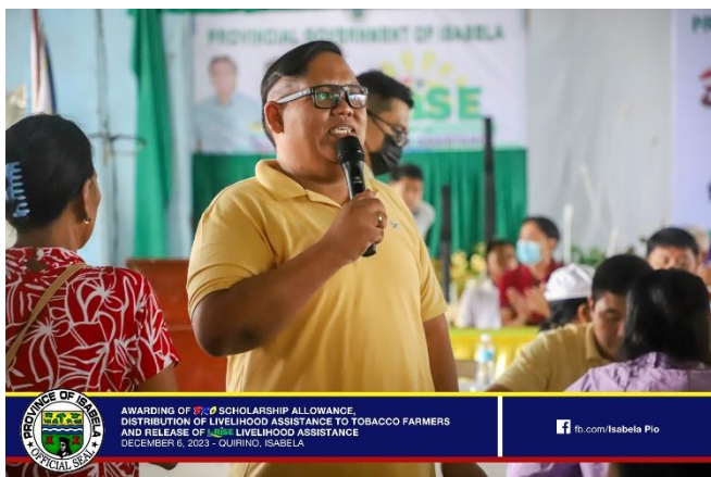
AWARDING OF ₱2.0 SCHOLARSHIP ALLOWANCE, DISTRIBUTION OF LIVELIHOOD ASSISTANCE TO TOBACCO FARMERS AND RELEASE OF ₱1.0 LIVELIHOOD ASSISTANCE DECEMBER 6, 2023 - QUIRINO, ISABELA fb.com/Isabela Pio