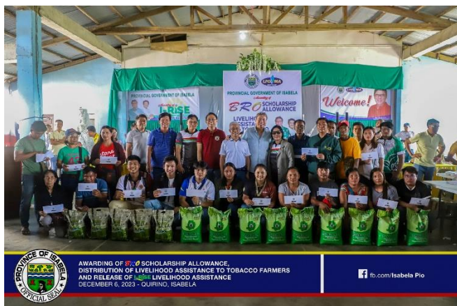
AWARDING OF ₱2.0 SCHOLARSHIP ALLOWANCE, DISTRIBUTION OF LIVELIHOOD ASSISTANCE TO TOBACCO FARMERS AND RELEASE OF ₱1.0 LIVELIHOOD ASSISTANCE DECEMBER 6, 2023 - QUIRINO, ISABELA fb.com/Isabela Pio