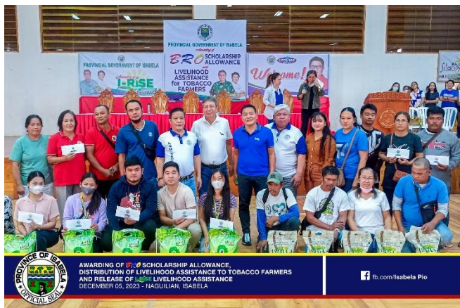
AWARDING OF ₱2.0 SCHOLARSHIP ALLOWANCE, DISTRIBUTION OF LIVELIHOOD ASSISTANCE TO TOBACCO FARMERS AND RELEASE OF ₱1.0 LIVELIHOOD ASSISTANCE DECEMBER 05, 2023 - NAGUILIAN, ISABELA fb.com/Isabela Pio