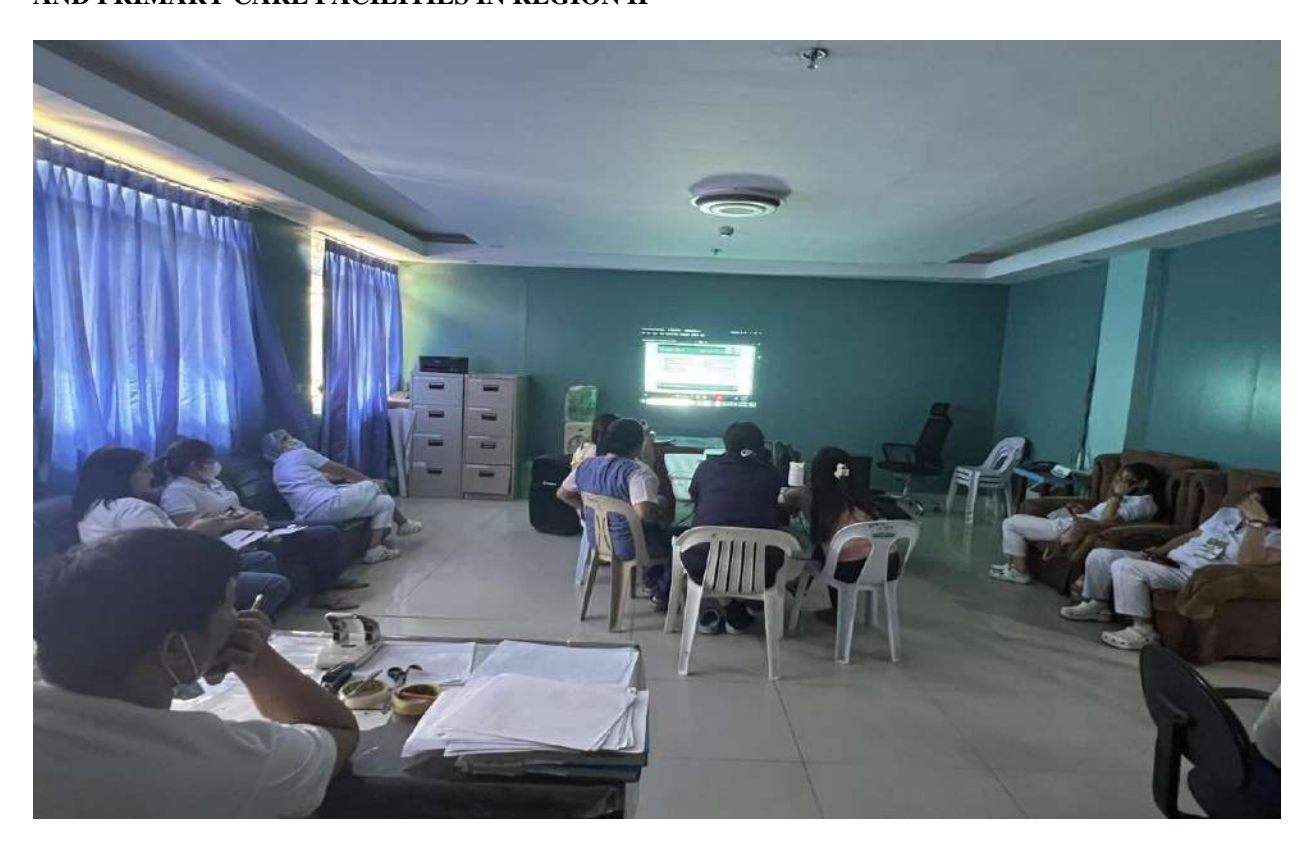
On July 28, 2023, at exactly 1:30 PM, the online orientation on navigating the application and answering each module for the health facility profiling system was attended by representatives from various concerned sections/committees of the hospital conducted at the Cauayan District Hospital in the Administrative Office.

***THE DEPARTMENT OF HEALTH – CAGAYAN VALLEY CENTER FOR HEALTH DEVELOPMENT CONDUCTED ONLINE ORIENTATION ON THE IMPLEMENTATION OF THE 2023 HEALTH FACILITY PROFILING SYSTEM IN ALL GOVERNMENT AND PRIVATE HOSPITALS, INFIRMARIES, AND PRIMARY CARE FACILITIES IN REGION II