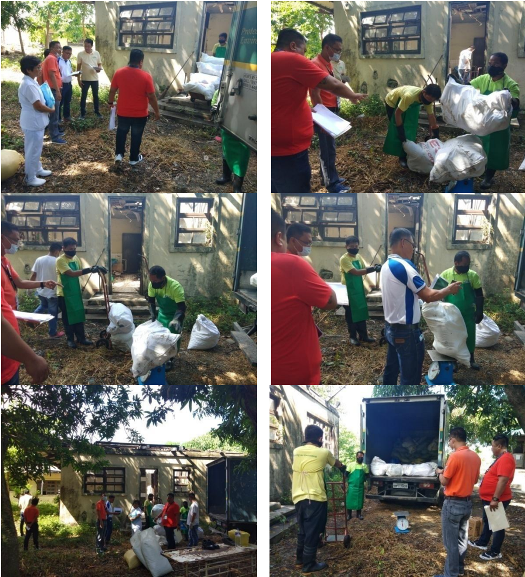
➤ On August 21, 2019, collection of hospital hazardous waste