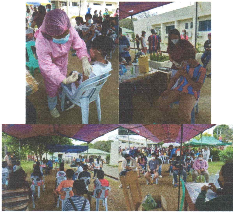
➤ On December 15, 2021, National Vaccination Days Phase 2 (1 st day)