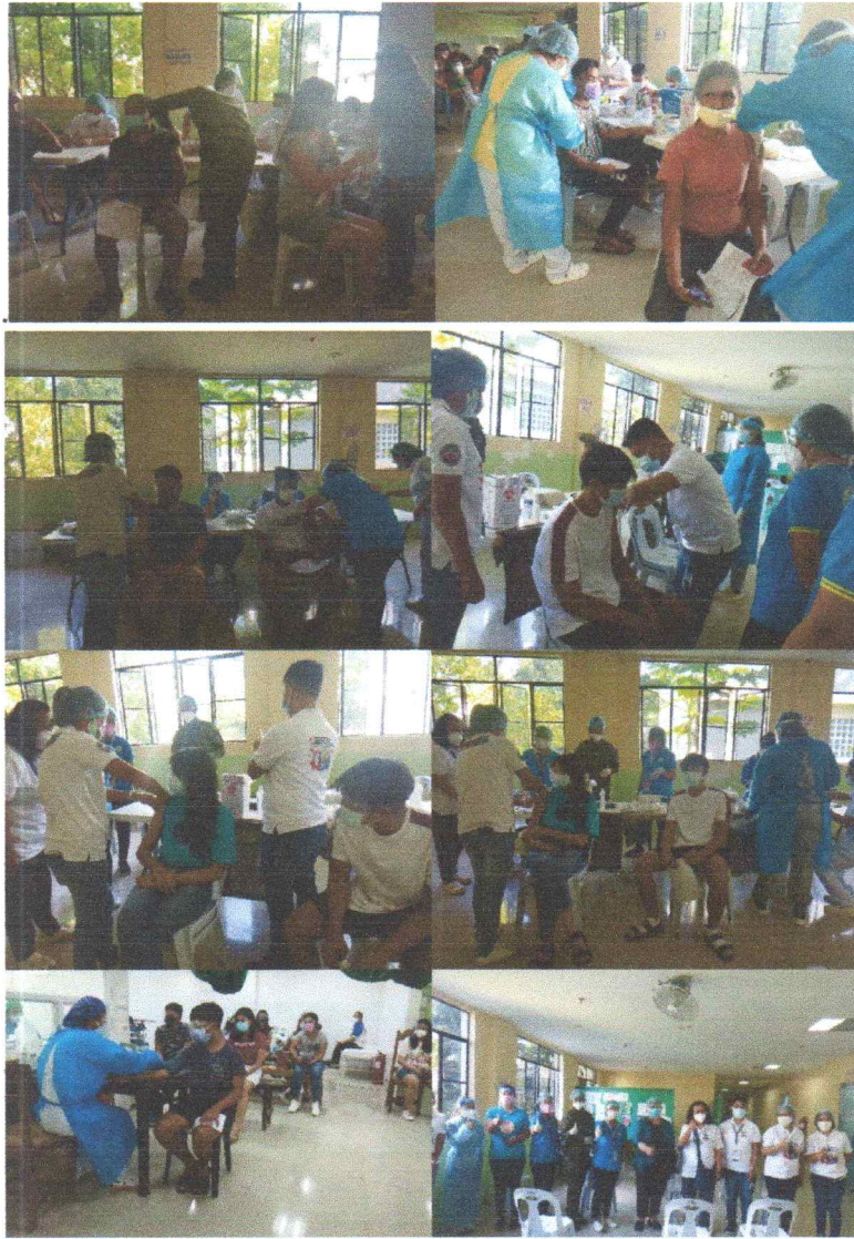
➤ On November 18, 2021, COVID-19 Vaccination Activities – 1 st Dose for A3 Pediatric (12 to 17 years old with or without comorbidity) and 18 years above