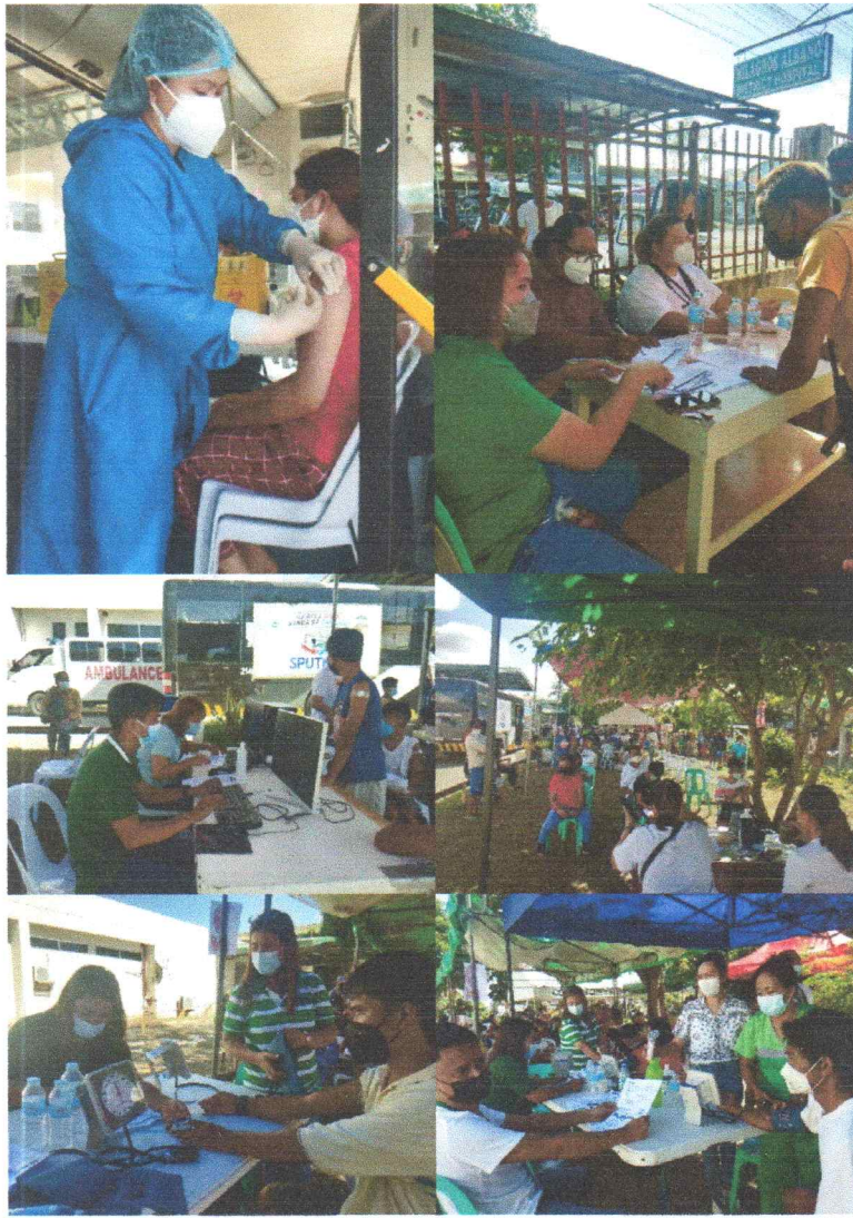
➤ On November 30, 2021, National Vaccination Days (2 nd Day) at MADH