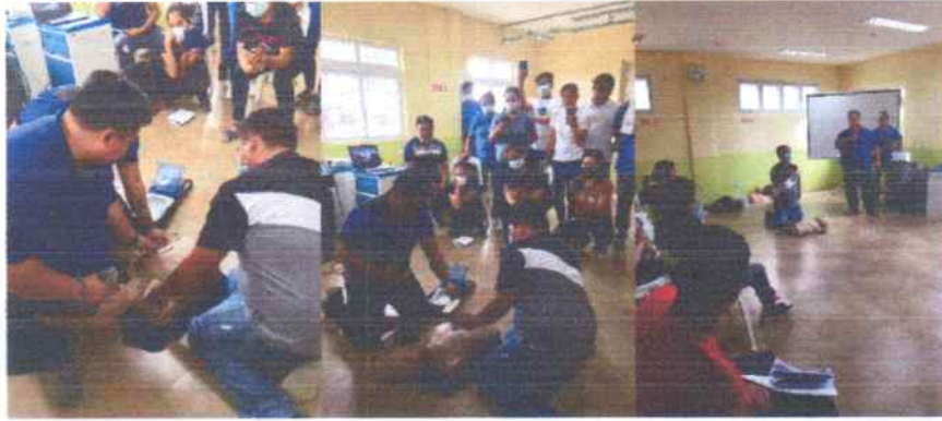
➤ On June 8, 2023, MADH Personnel participated in the Second Quarter Nationwide Simultaneously Earthquake Drill