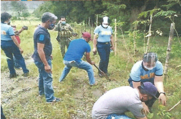
Tree-planting activities with the Brgy.Officials & PNP