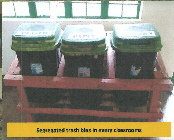
Segregated trash bins in every classrooms