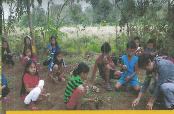
Tree-planting activities with the pupils of AES