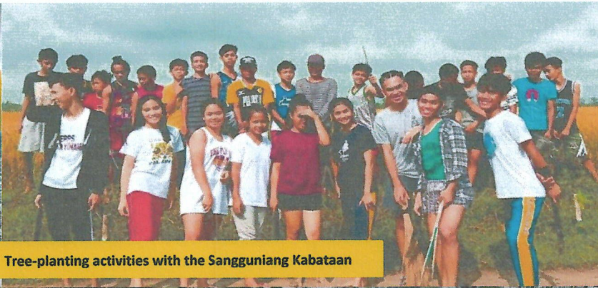
Tree-planting activities with the Sangguniang Kabataan