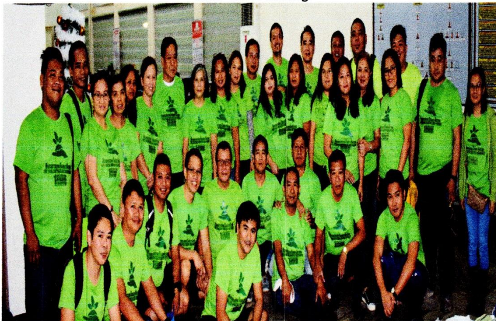
Before going to Sitio Laguis, Barangay Sindon Bayabo, City of Ilagan, Isabela for the Tree Planting Activity "One Million Trees in One Day" project