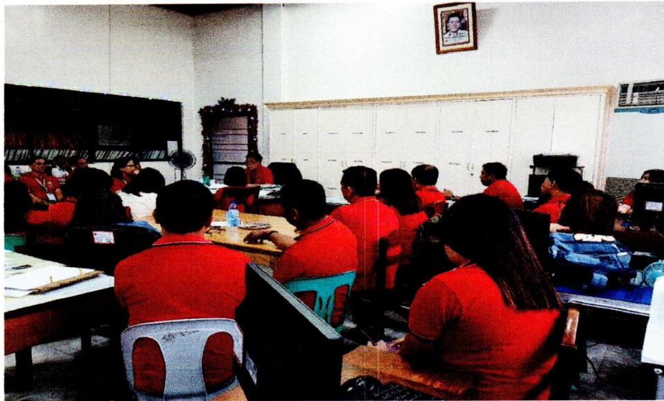
Staff meeting of Provincial Assessor's Office presided by the Provincial Assessor on December 3, 2019