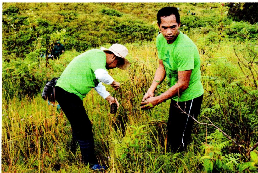
The Provincial Assessor in action during the Tree Planting