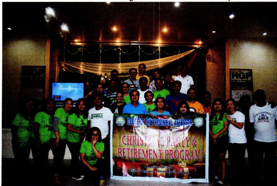
Provincial Assessor's Office personnel during the Christmas Party