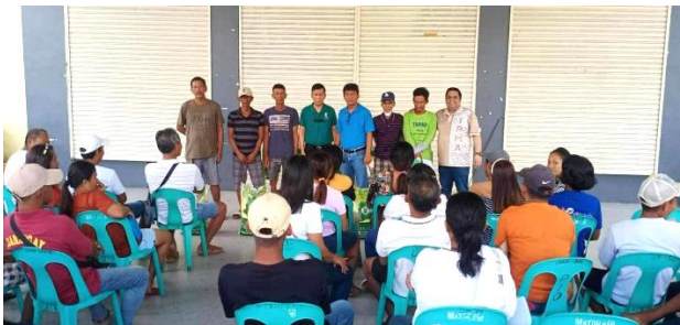
April 29, 2025 – LGU Mallig (787 Tobacco Farmers) LGU Angadanan (265 Tobacco Farmers)