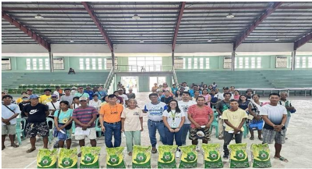
April 29, 2025 – LGU Tumauni (109 Tobacco Farmers)