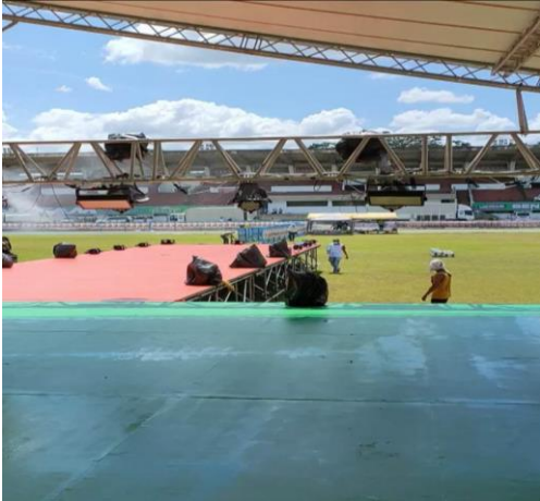
Preparation of stage for PGI program