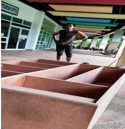
Fabrication of Cabinet for Isabela Tourism Office