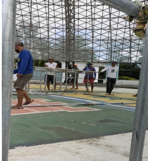
Repair/construction of Paskuhan Village