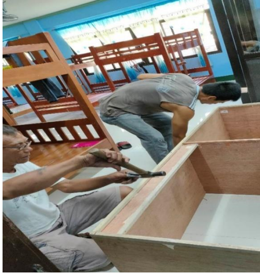
Fabrication of Cabinet dorm for School for the deaf