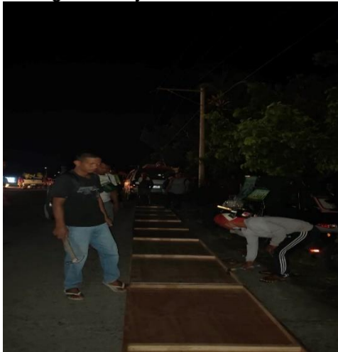
Repair & preparation of stage for oath Taking of newly elected official