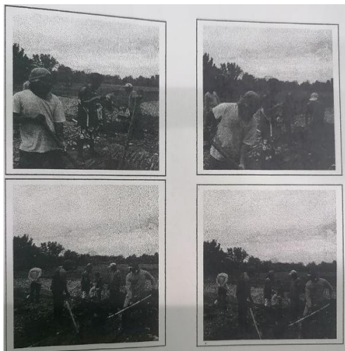
Construction of Septic Tank