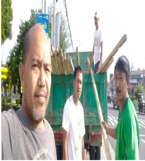
Transportation of materials for the repair Of school building