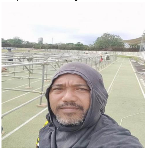
Preparation of Stage