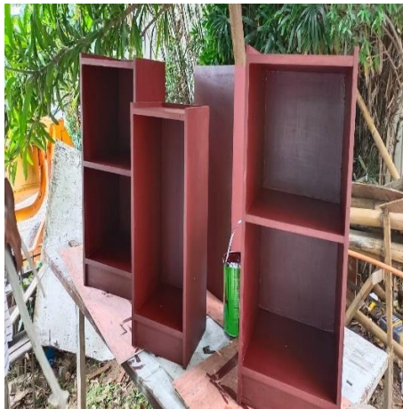
Fabrication of Cabinet