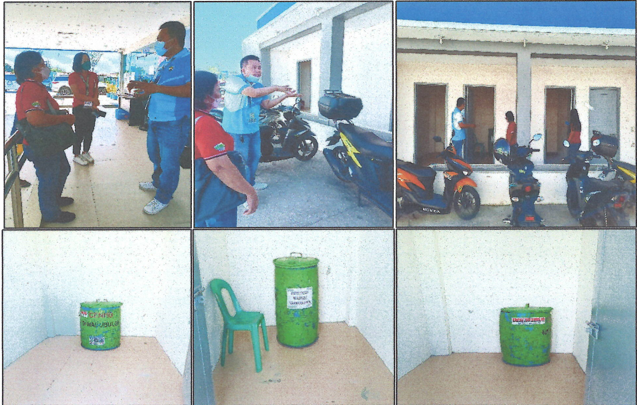
Photos during the conduct of Joint Anti-Smoke Belching Campaign at Benito Soliven, Isabela