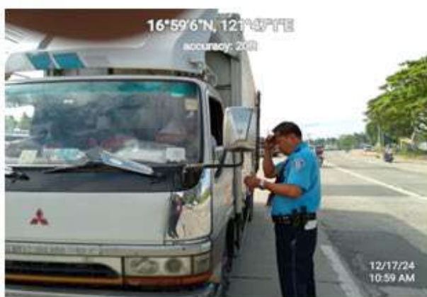
Halting of utility vehicles by deputized LTO personnel for emission testing.