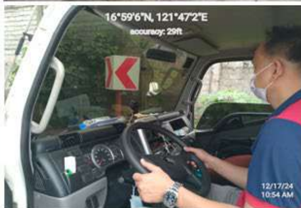
The Opacimeter setup process, including the start-up, insertion of the probe, reading emission levels through controlled pedaling, and printing out the test results.