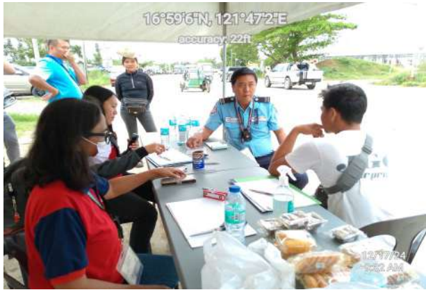
Filling out forms and recording drivers' personal information along with the results of the opacimeter testing.