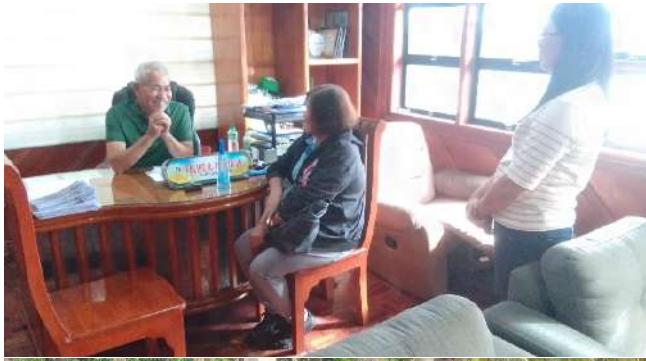
These photos taken during the conduct of final field validation of the winner for the 2024 Search for the Most Environment Friendly Barangays