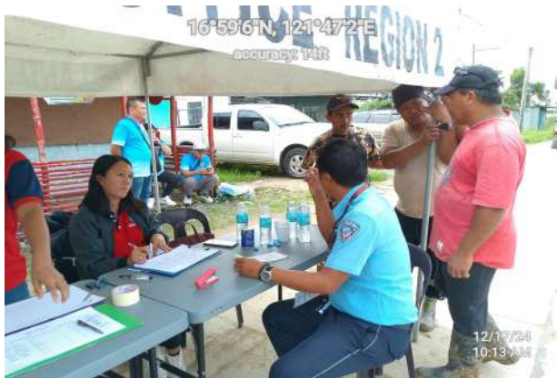
Issuing penalty tickets to drivers whose emission test results did not meet the standard values.