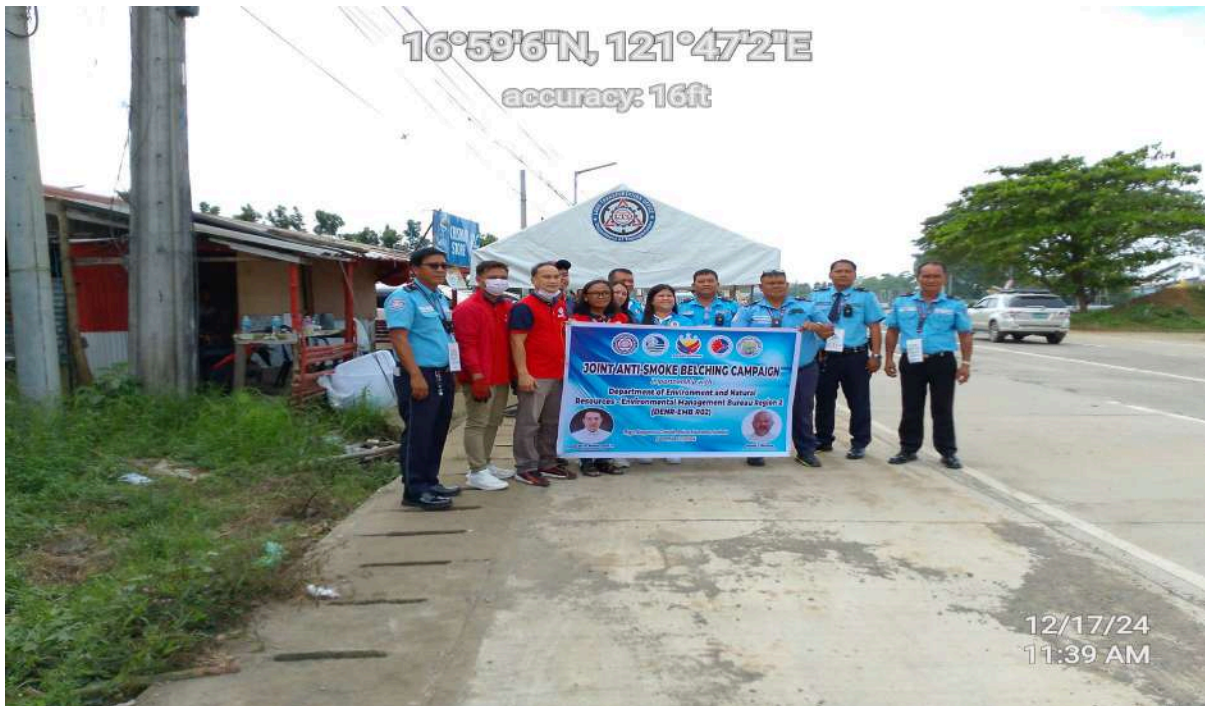
A final group photo was captured to signify the successful conduct of the Anti-Smoke Belching Campaign and inspection.