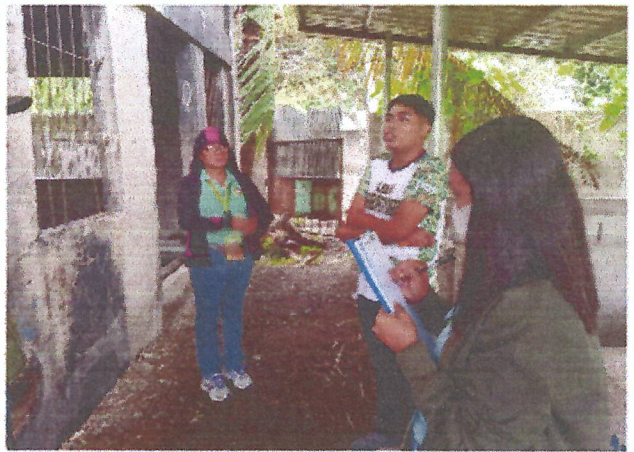
📍 BURGOS STREET, CABATUAN, ISABELA