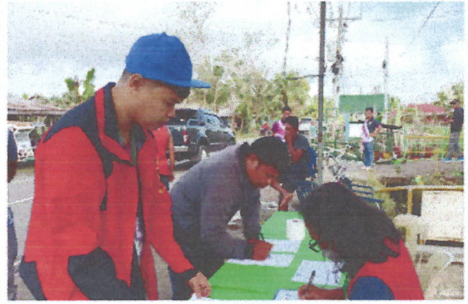
Discussion for the operation of the Anti-Smoke Belching Campaign and filling up of the attendance sheet.