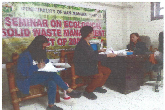
SAN MANUEL MUNICIPAL HALL, ISABELA