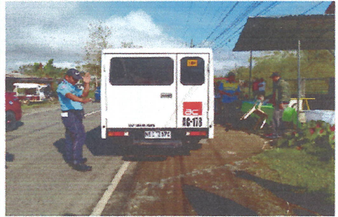
Halting of utility vehicles by deputized LTO personnel for emission testing.