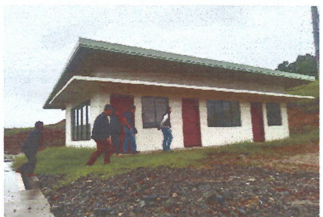
BRGY. EDEN, SAN MANUEL, ISABELA