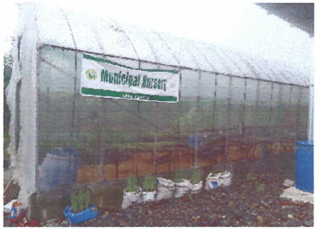
📍 LUNA AGRICULTURE OFFICE, ISABELA