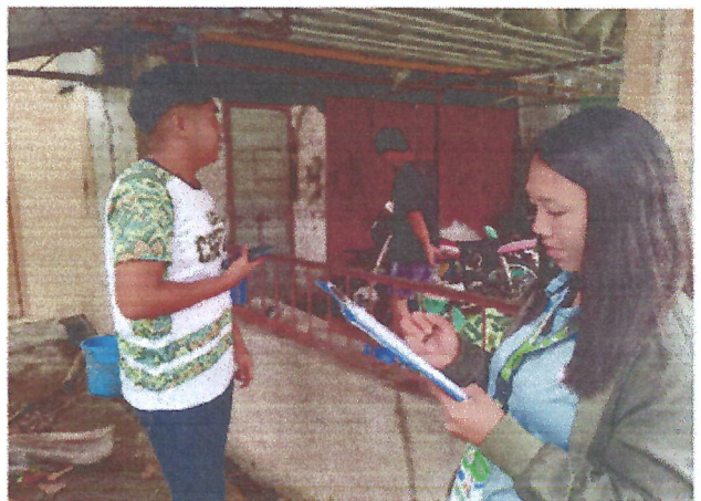
📍 BRGY. SARANAY, CABATUAN, ISABELA