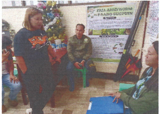
📍 CABATUAN MUNICIPAL HALL, ISABELA