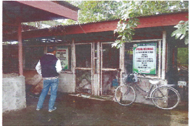
AURORA MUNICIPAL HALL, ISABELA