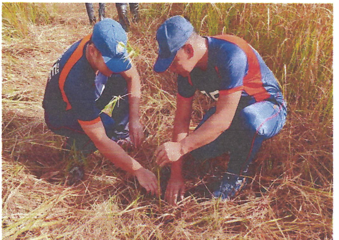
Photos of the Watershed Project located at Brgy. Namnama, Tumaui, Isabela, for the month of November, 2024