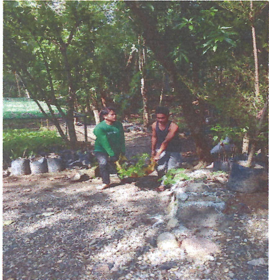
Photos of activities conducted at the Provincial Clonal Nursery for the month of November, 2024.