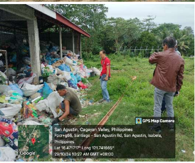
Brgy. Santos, San Agustin, Isabela (Residual Containment Area)