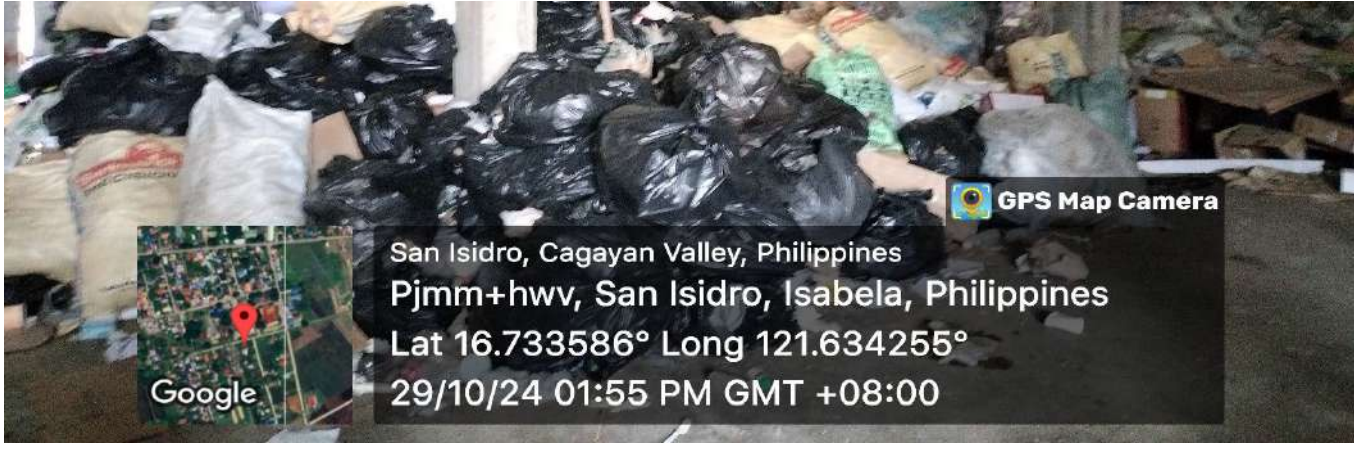
Brgy. San Antonino and San Miguel, Burgos, Isabela