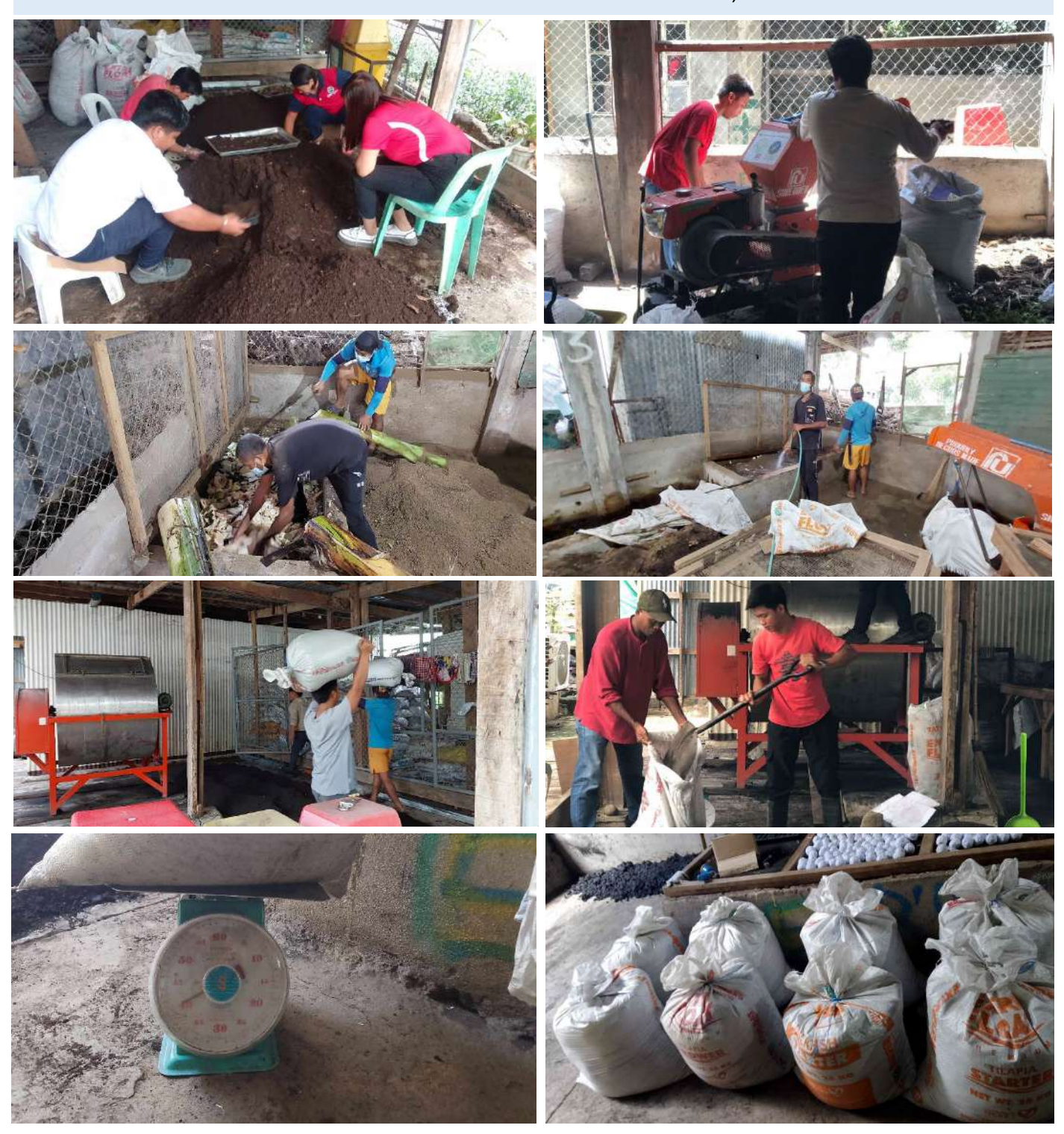
Green Charcoal Production for the Month of October, 2024