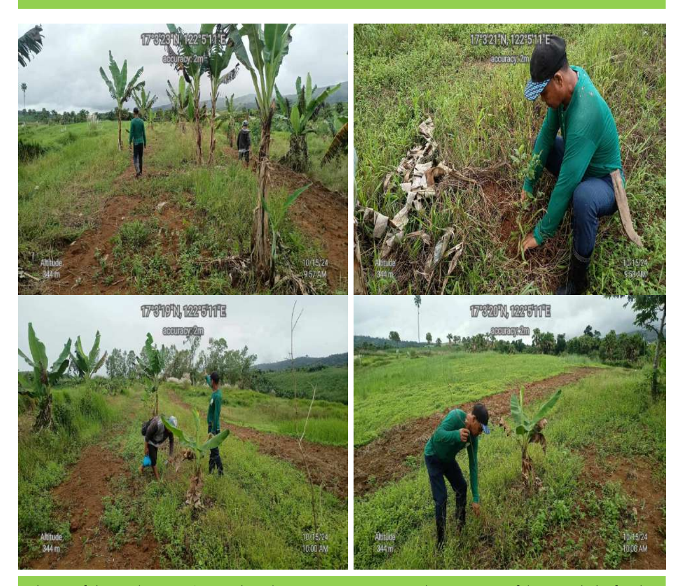
Photos of the Implementation on the 1-km Riparian Project at Cabisera 7, City of Ilagan. Isabela, for the month of October, 2024

Photos of the Implementation on the Agroforestry Project at Sitio Bigao , City of Ilagan, Isabela, for the month of October, 2024