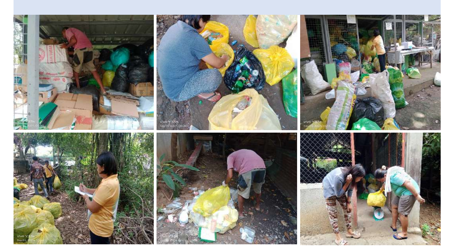
Photos taken during the conduct of Information, Education and Communication (IEC) Campaign and Clean-up Drive within the Isabela Provincial Eco-Park.