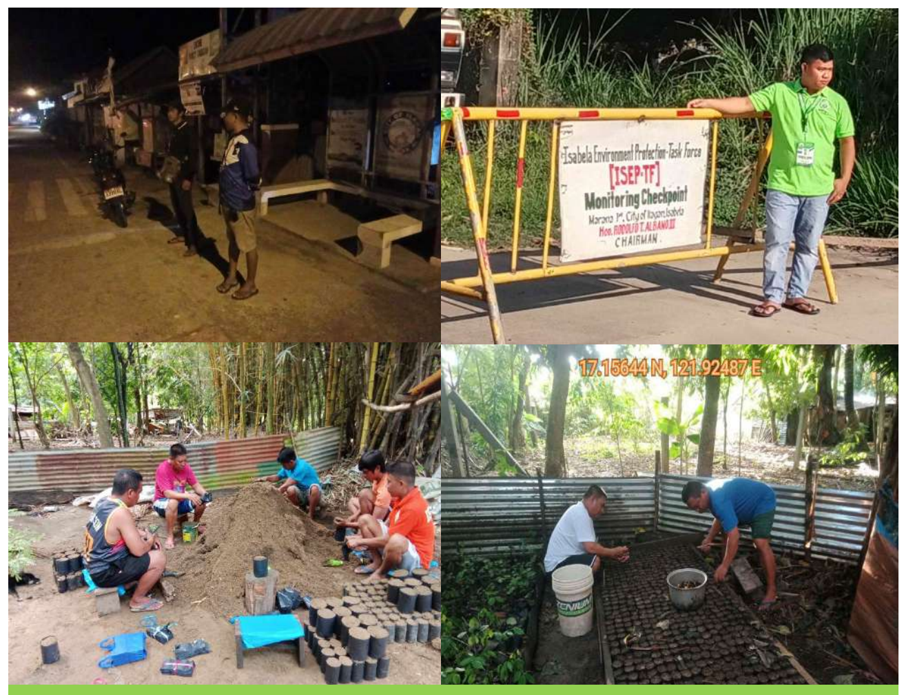
Other Activities by the ISEP-TF Operatives (Clean-up Drive at Cabisera 8, City of Ilagan, Isabela and Isabela Provincial Eco- Park)

Photos taken during the regular conduct of patrolling and monitoring of ISEP-TF Operatives and Nursery Activities for the month of September, 2024.