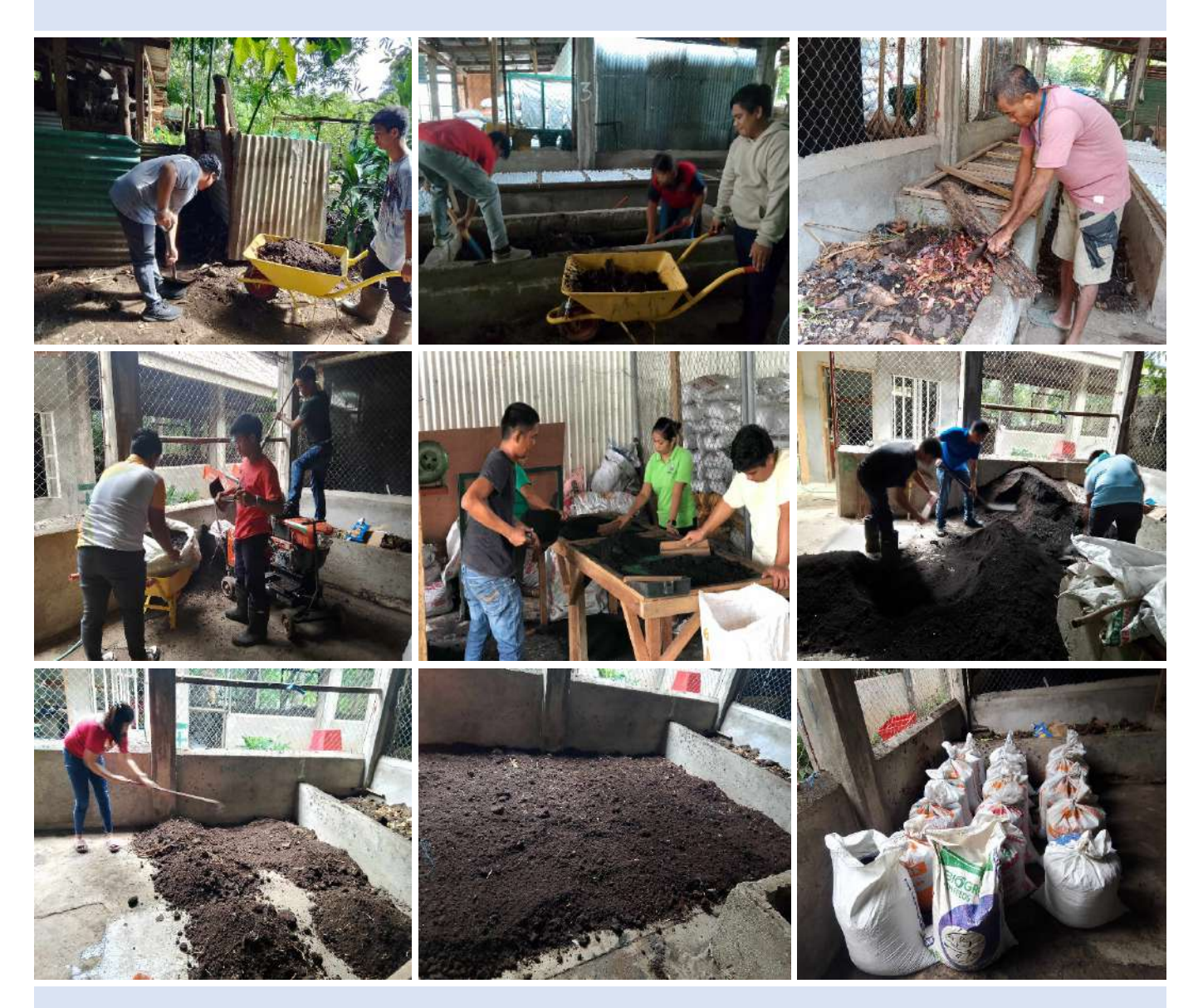
Production of Green Charcoal Briquettes for the month of September, 2024