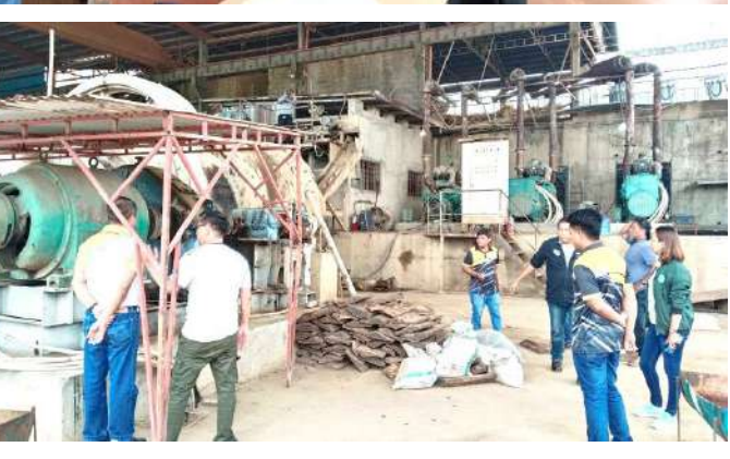
Photos taken during the investigation and verification of an alleged illegal mining activity at Barangay San Manuel, Naguilian, Isabela