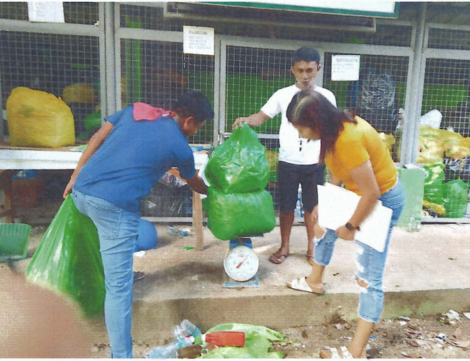
Recording – weighing of wastes including biodegradable, recyclable, residual and hazardous wastes was recorded properly.