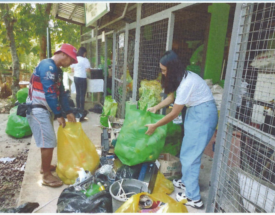
Weighing of wastes was done before disposal at the Residual Containment Area (RCA).