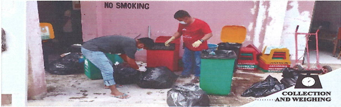
COLLECTION AND WEIGHING