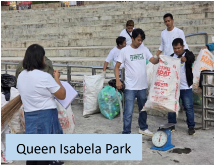
Queen Isabela Park