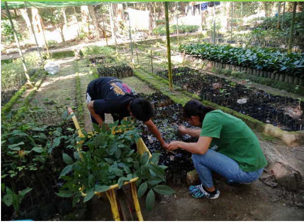
Photos taken during the conduct of Nursery activities for the month of January, 2025.