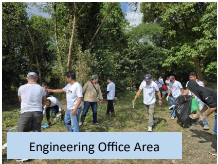
Engineering Office Area