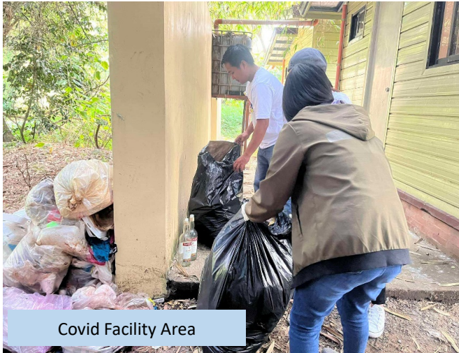
Covid Facility Area